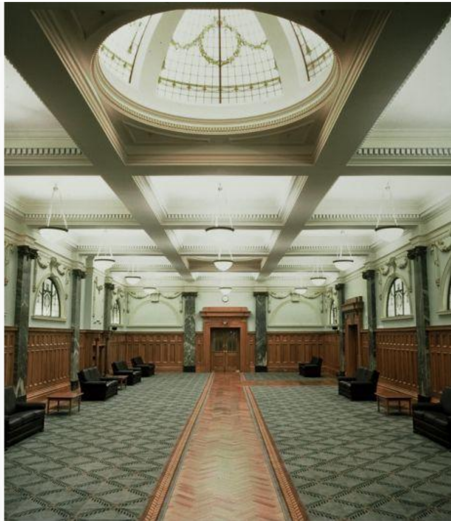
New Zealand Parliament Refurbishment