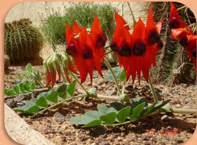
Sturt's desert pea