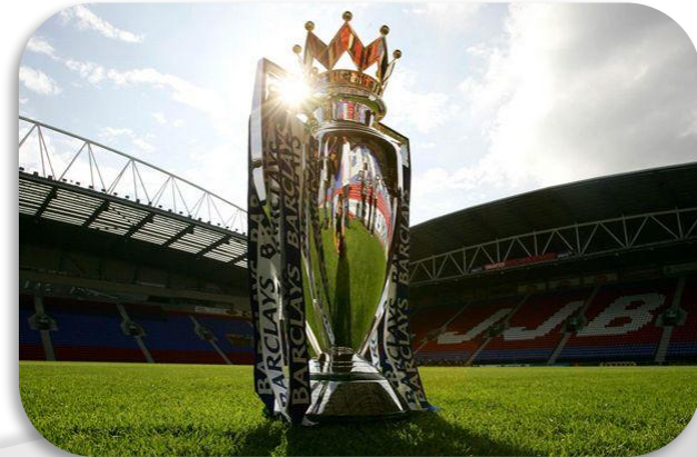
Premiere league Trophy