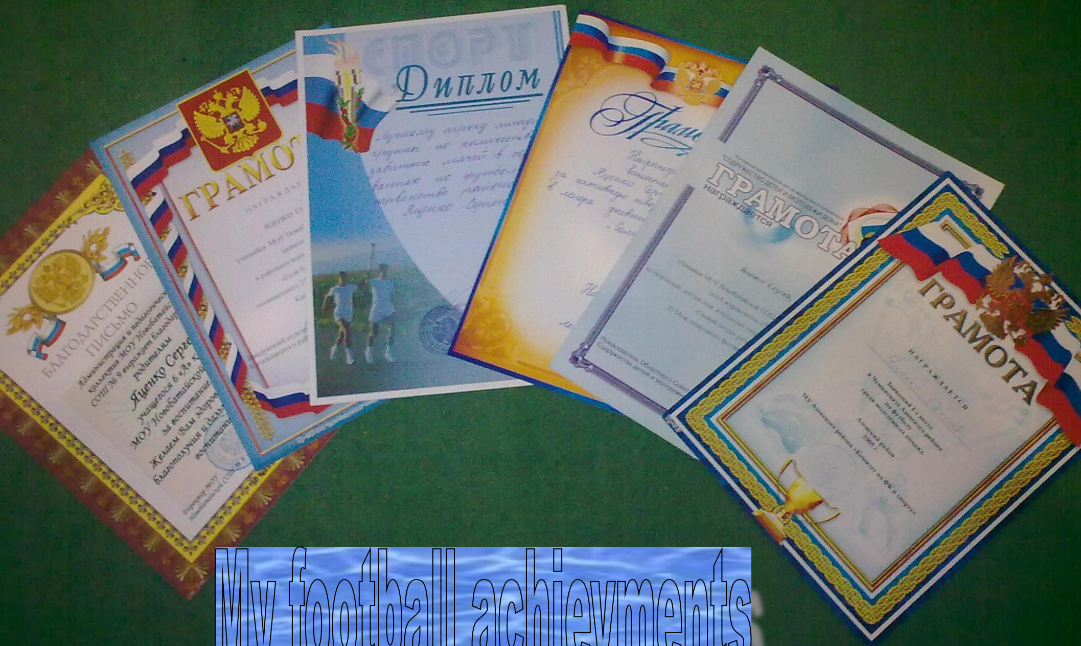
My football achievements