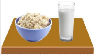
Porridge and fruit