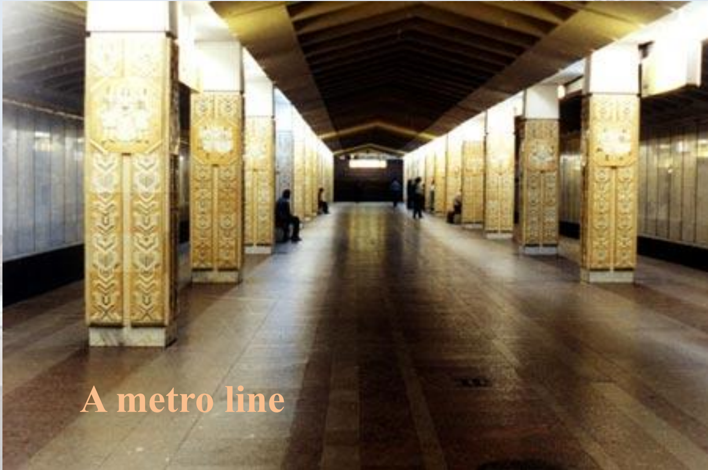
A metro line

... is built under the Prospect of Independence.