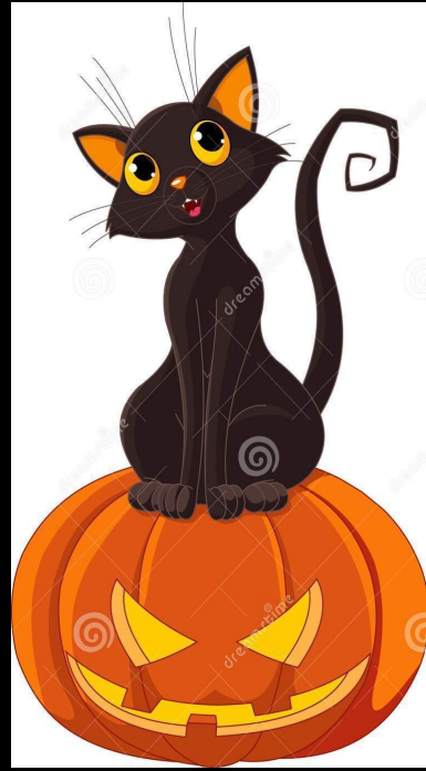
a black cat