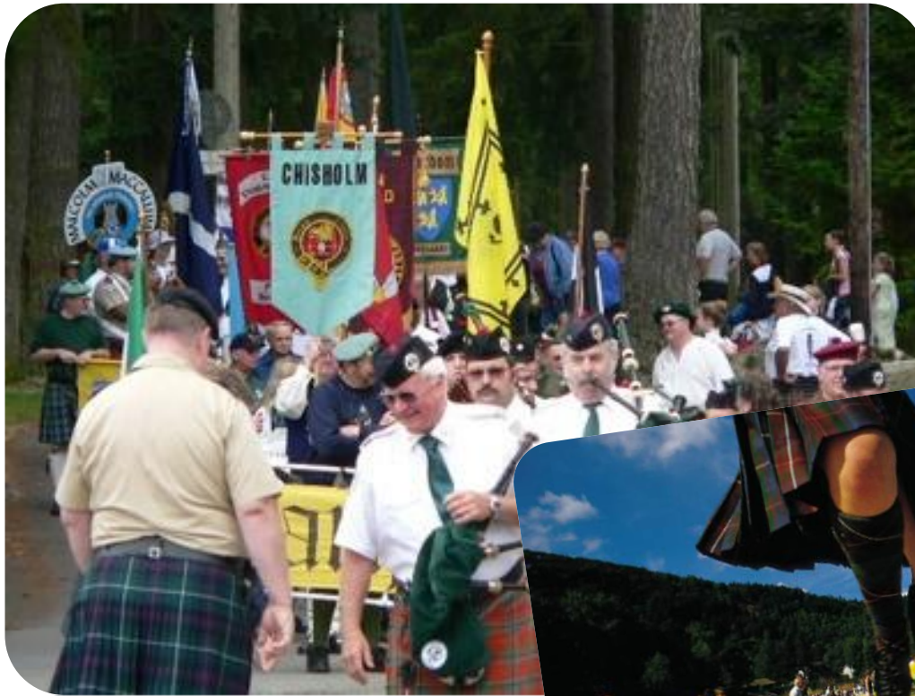
Assembling for the parade of clans at the Highland Games