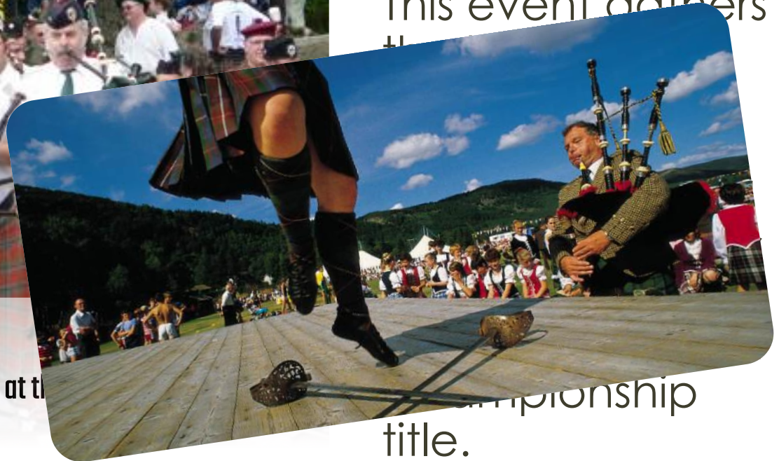
World Highland Dancing Championship title.