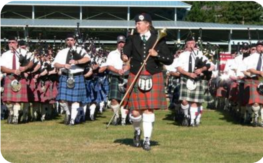
Massed bands at the 2005 Pacific Northwest Highland Games