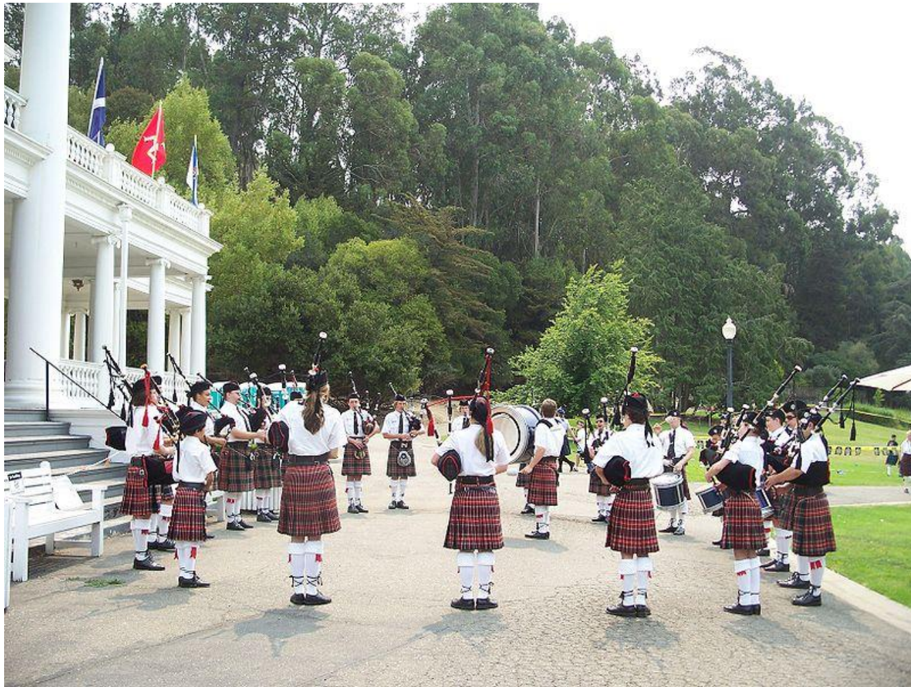
Highland Pipeband Competition Circle [Prince Charles Pipe Band 2008]