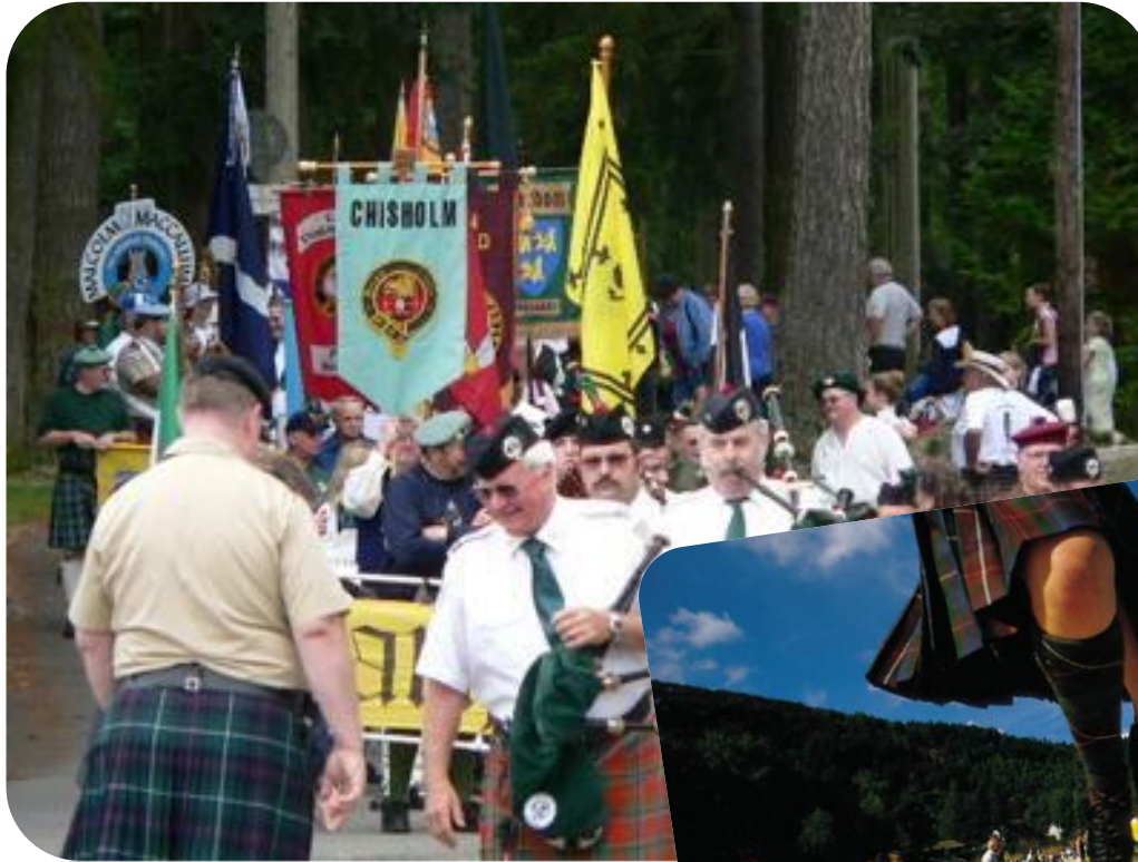
Assembling for the parade of clans at the Highland Games