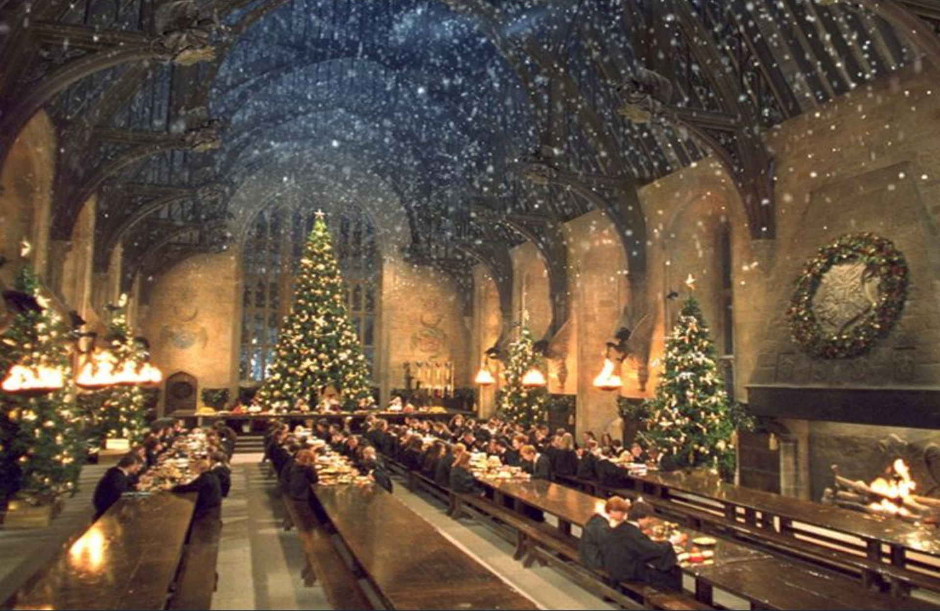
The Dining Hall of Hogwarts