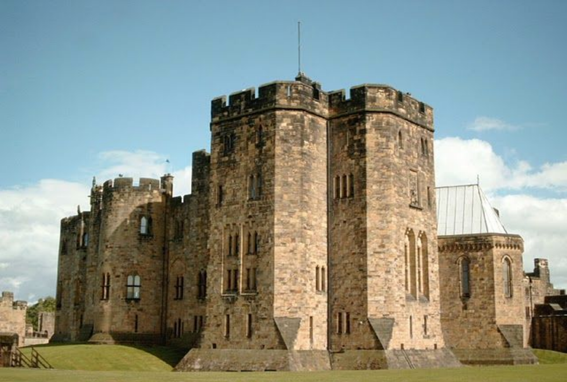
Alnwick Castle, Northumberland