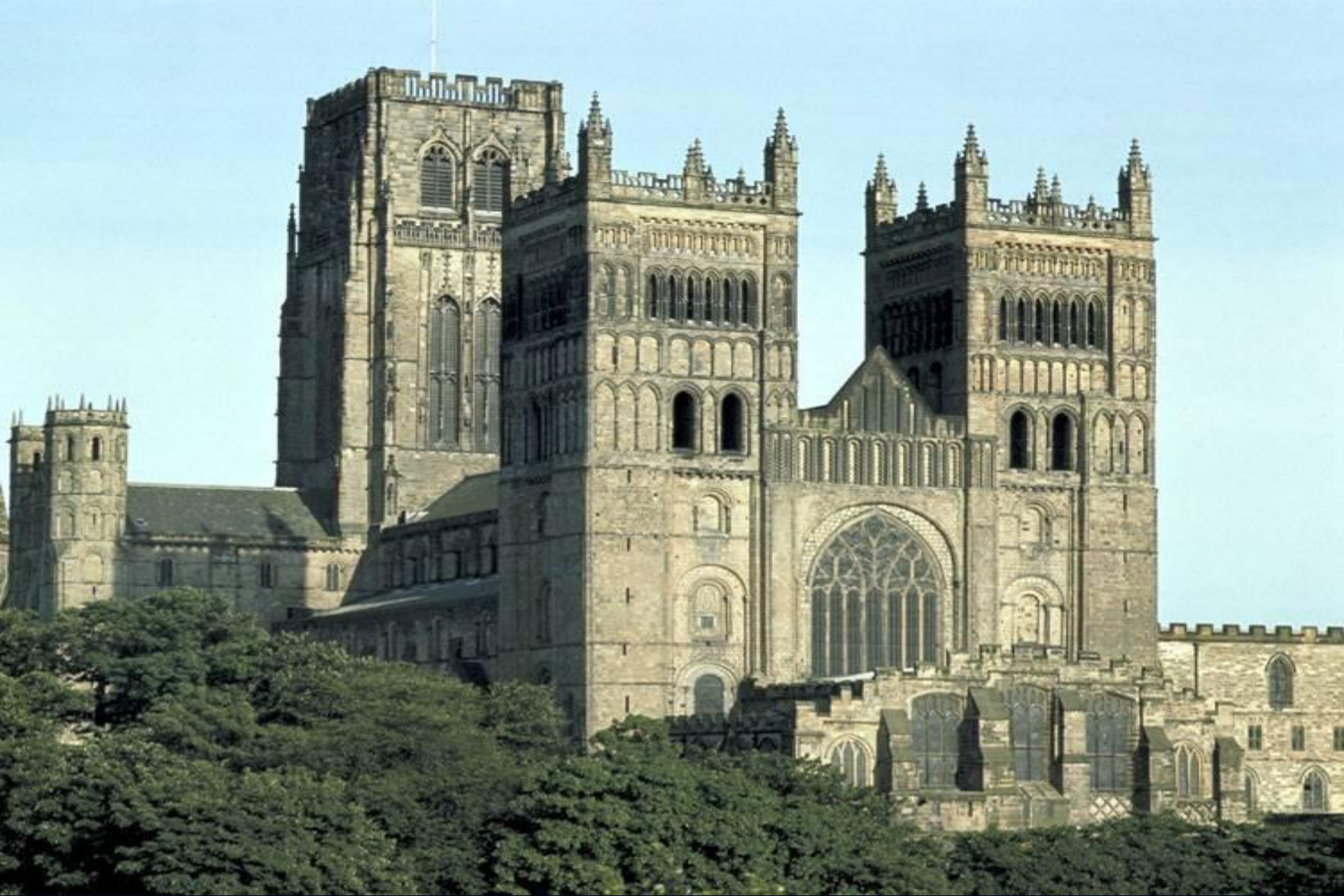
Durham Cathedral, Durham