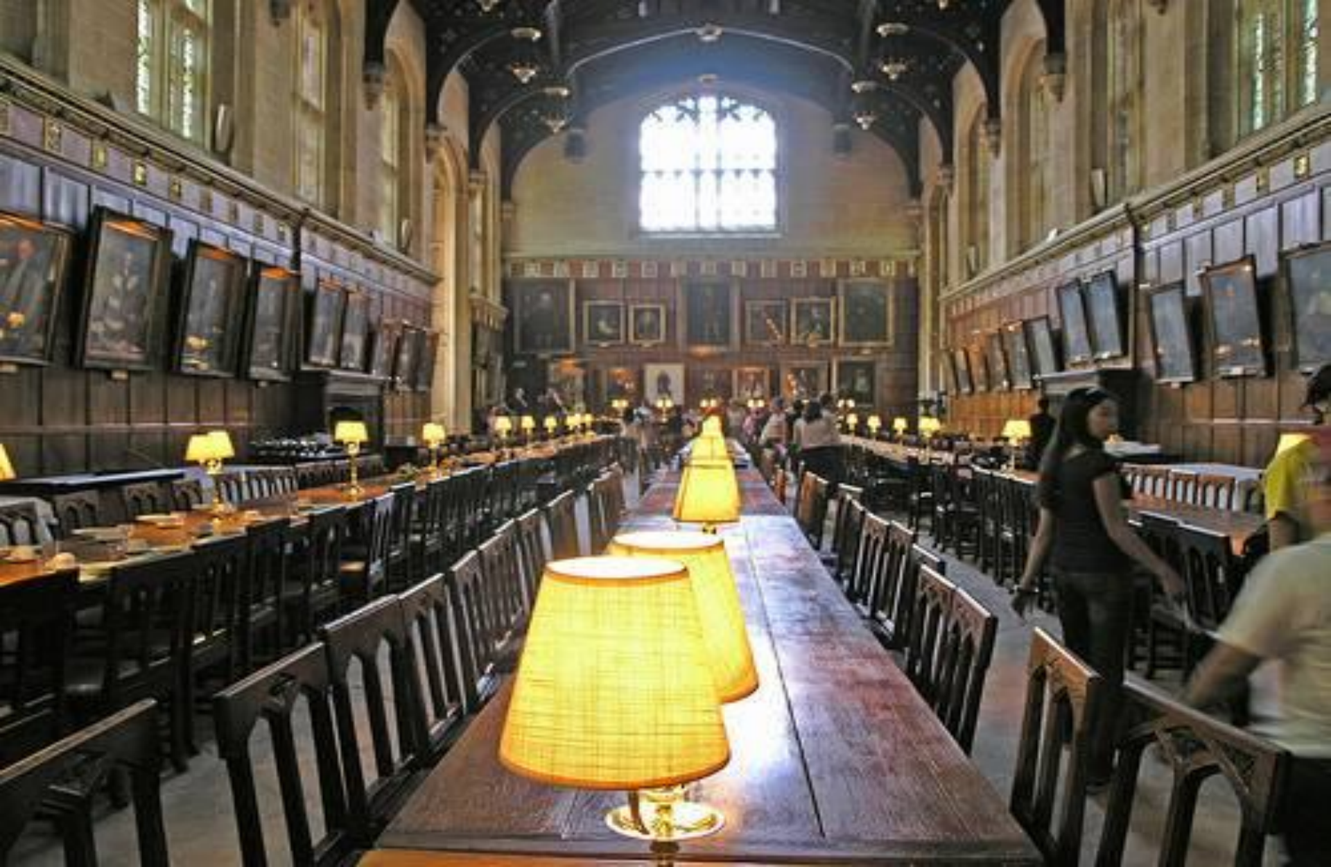
Christ Church College, Oxford