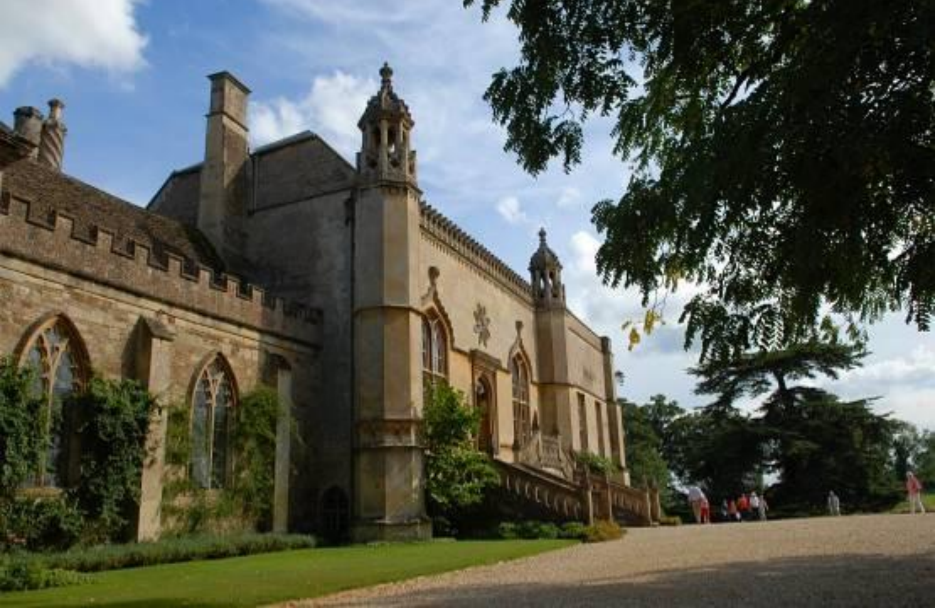
Lacock Abbey, Wiltshire