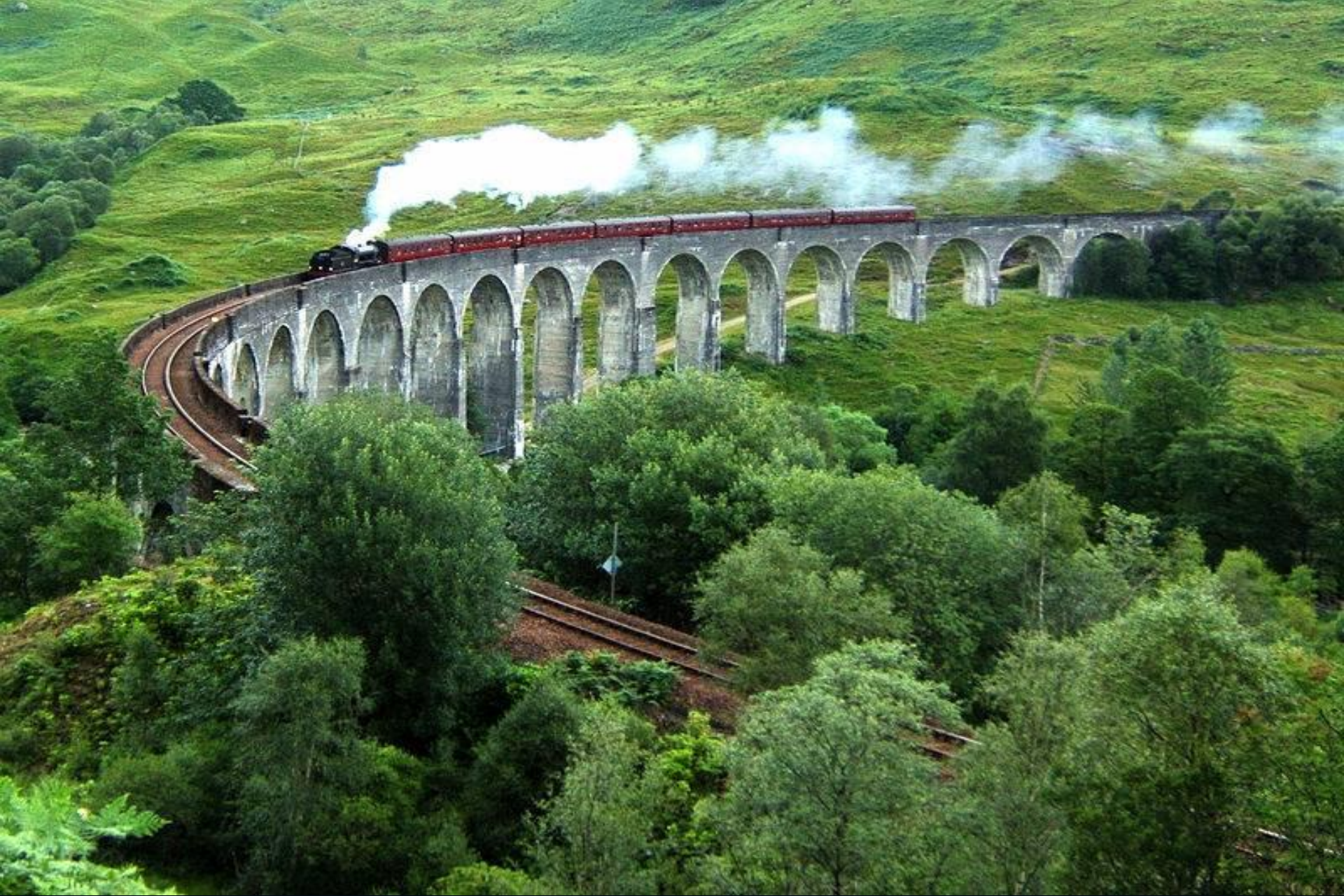
Glennfinnan Viaduct, Scotland