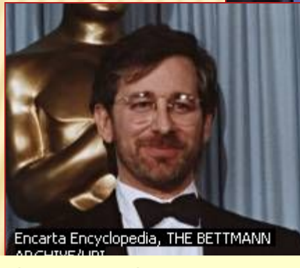
Steven Spielberg