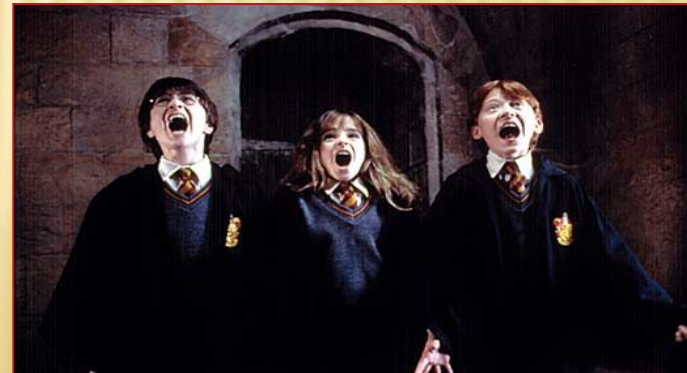
Harry Potter and the Sorcerer's Stone