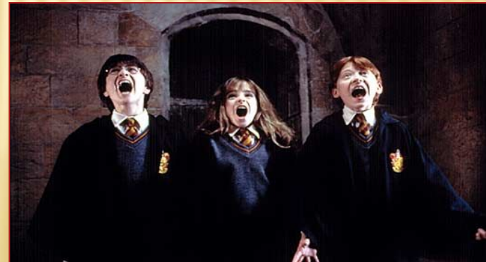
Harry Potter and the Sorcerer's Stone