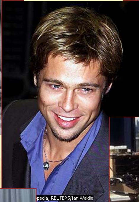
Encarta Encyclopedia, REUTERS/Ian Waldie