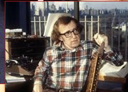
Encarta Encyclopedia, Inc.