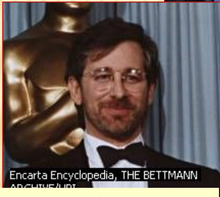
Steven Spielberg