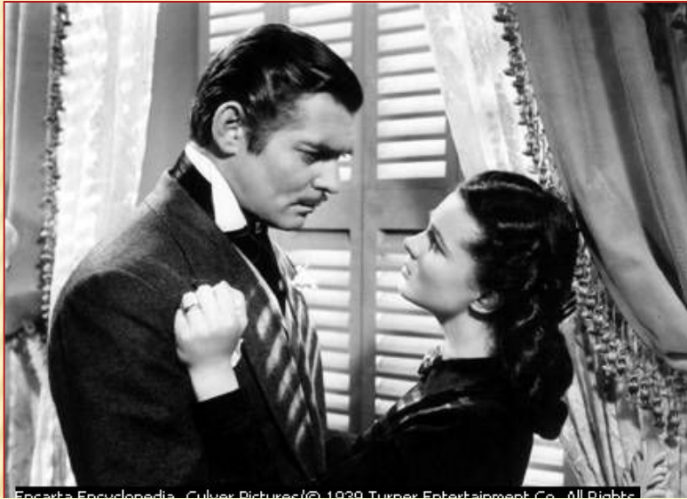
Scene from Gone With the Wind