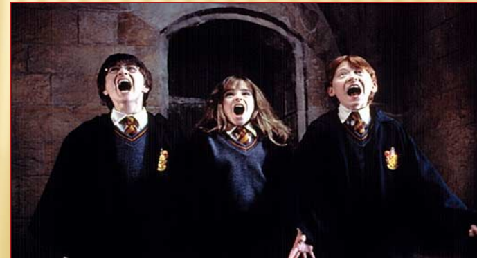
Harry Potter and the Sorcerer's Stone