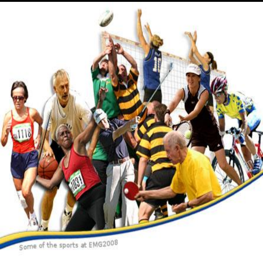
Some of the sports at EMG2008