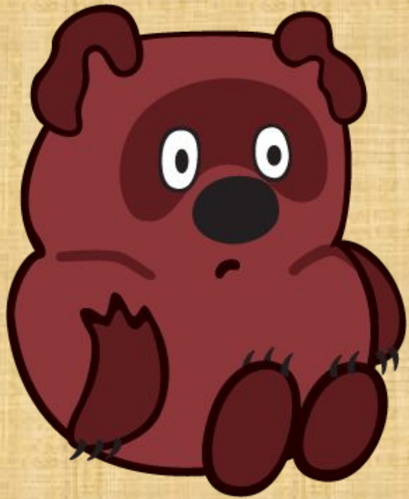
Winnie the Pooh