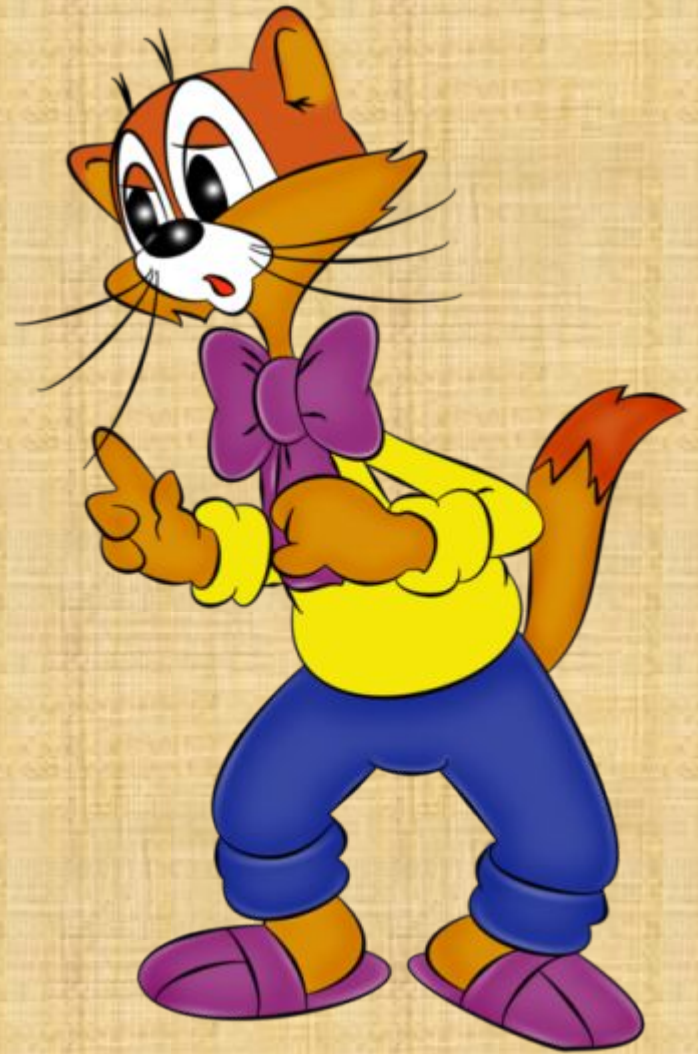
Leopold the Cat