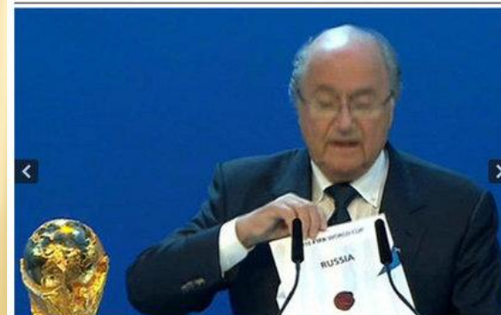
GALLERY: DECISION TIME Decision time in Zurich

Russia wins World Cup bid as English contingent headed by David Cameron and Prince William defeated.