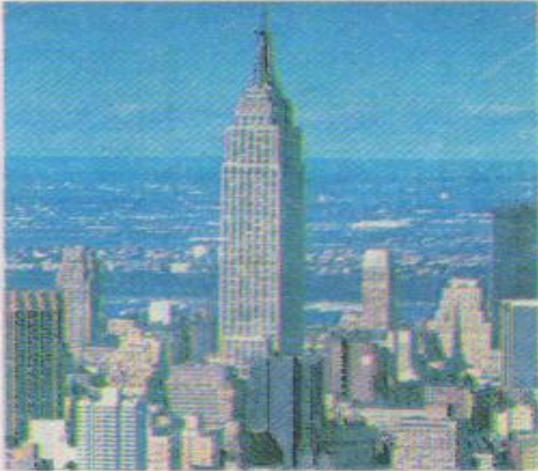
The Empire State Building

It is the most famous building in the world. It's very tall. Here you can visit the Observatory. Visibility on clear day- 80 miles. The Observatory is on the 102 nd floor of the Empire state Building. it's the worlds greatest TV tower. It is 1, 454 feet tall.