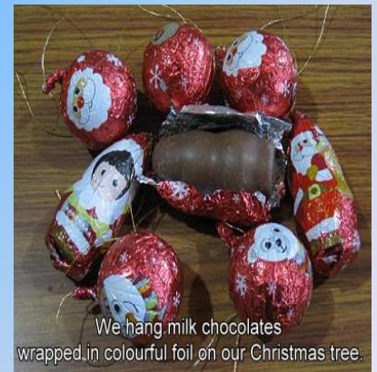
We hang milk chocolates wrapped in colourful foil on our Christmas tree.