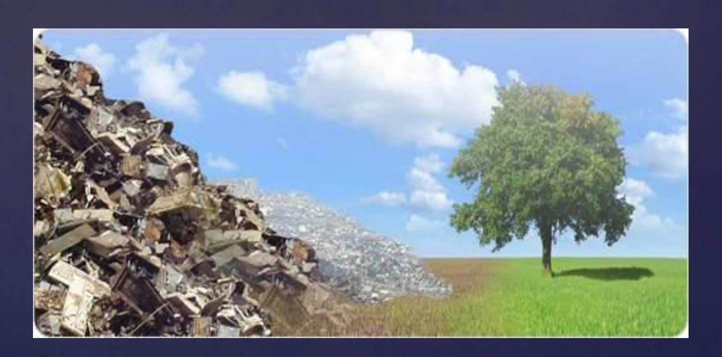
Iryna Petrova Sumy Specialised school 7

It's something we take for granted, throwing the plastic milk jug into the recycling container and putting it on the curb once a week. But knowing what you can recycle isn't really that intuitive.