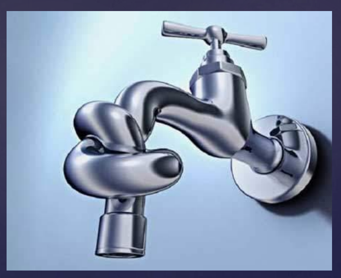
Iryna Petrova Sumy Specialised school 7

Water fun fact: A short, 10-minute shower, even with a low-flow shower head, uses 25 gallons of water. The average tub filled halfway holds just about 20 gallons. And who ever fills it half way for a kid?