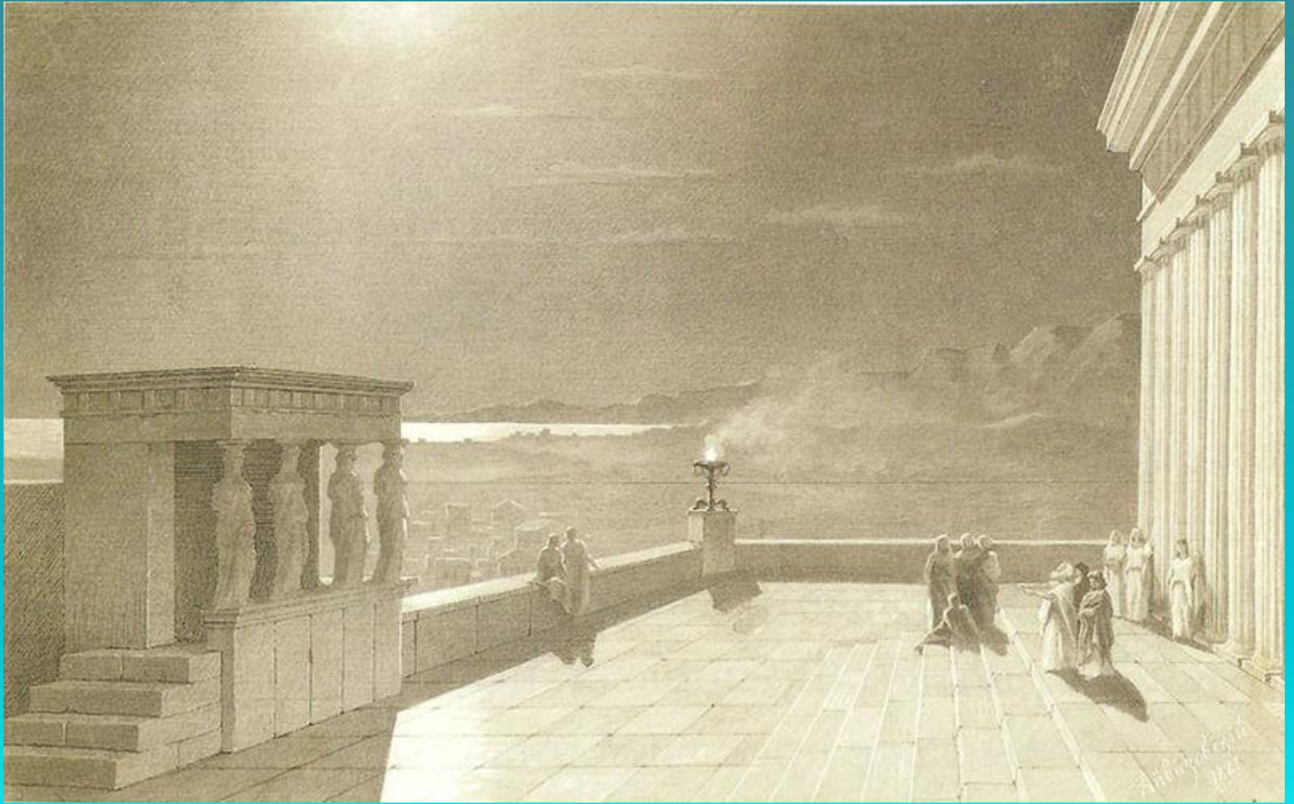
The Acropolis in Athens on a moonlight night.