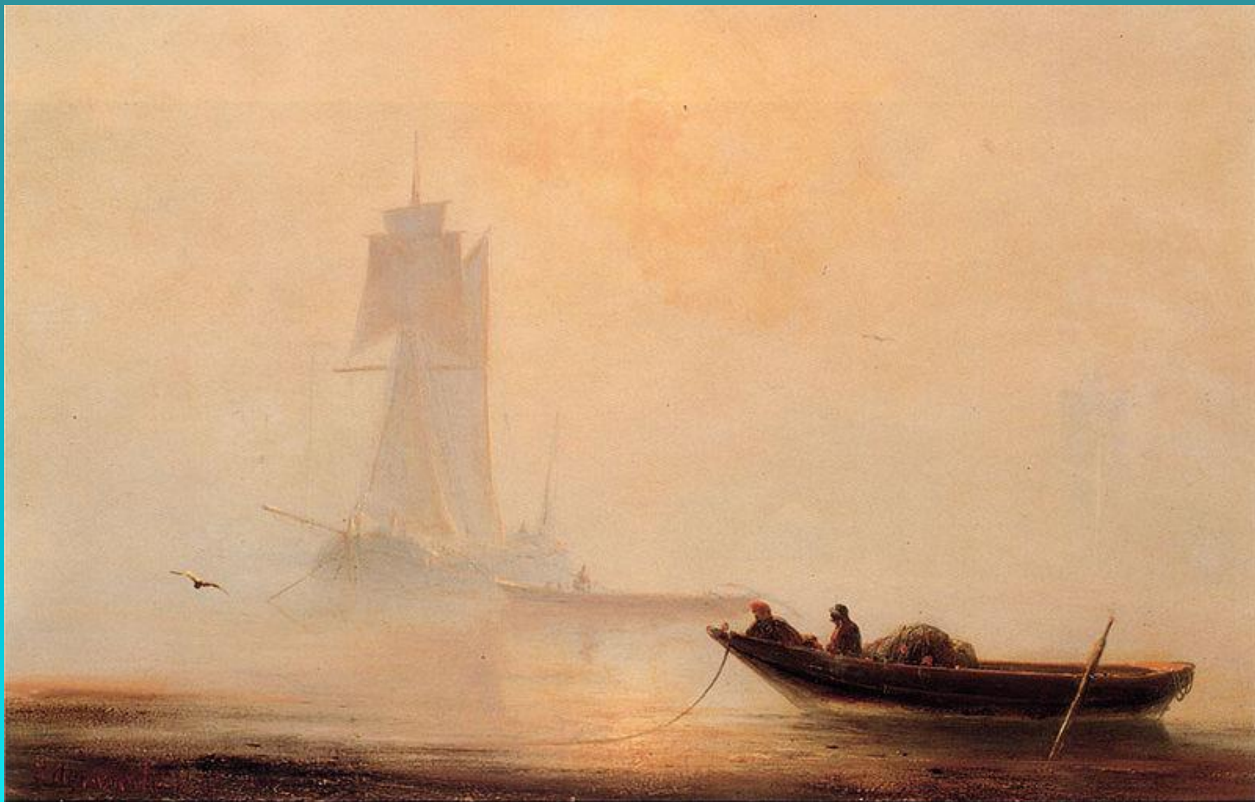
И.К. Айвазовский . Рыболовное судно в гавани.