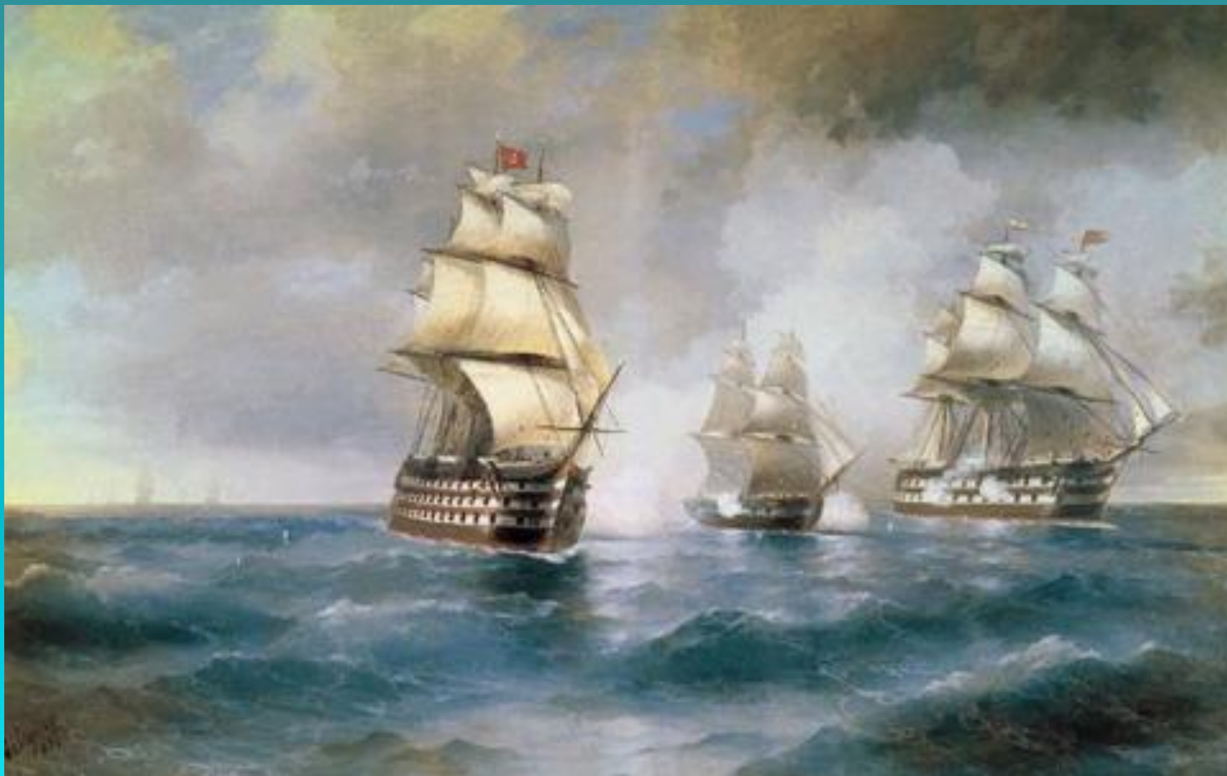
Brig "Mercury" attacked by two turkish ships