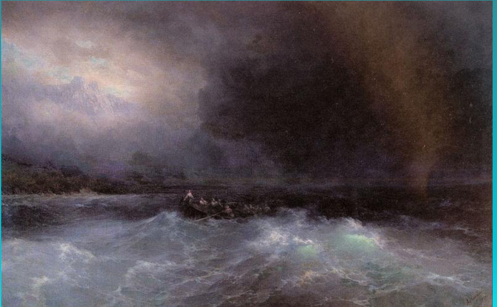
Ship at sea.