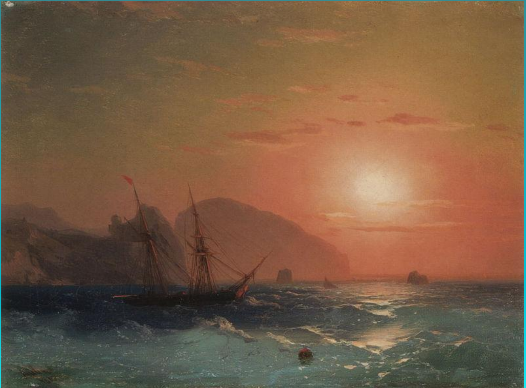
View on Ayu Dag