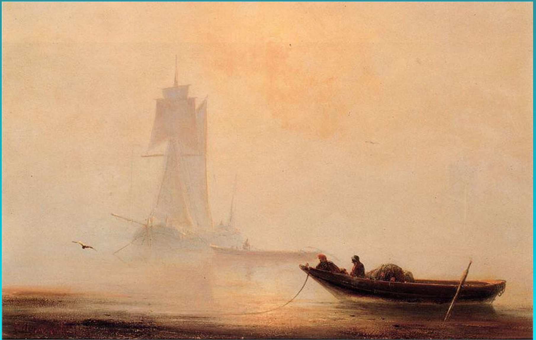
И.К. Айвазовский . Рыболовное судно в гавани.