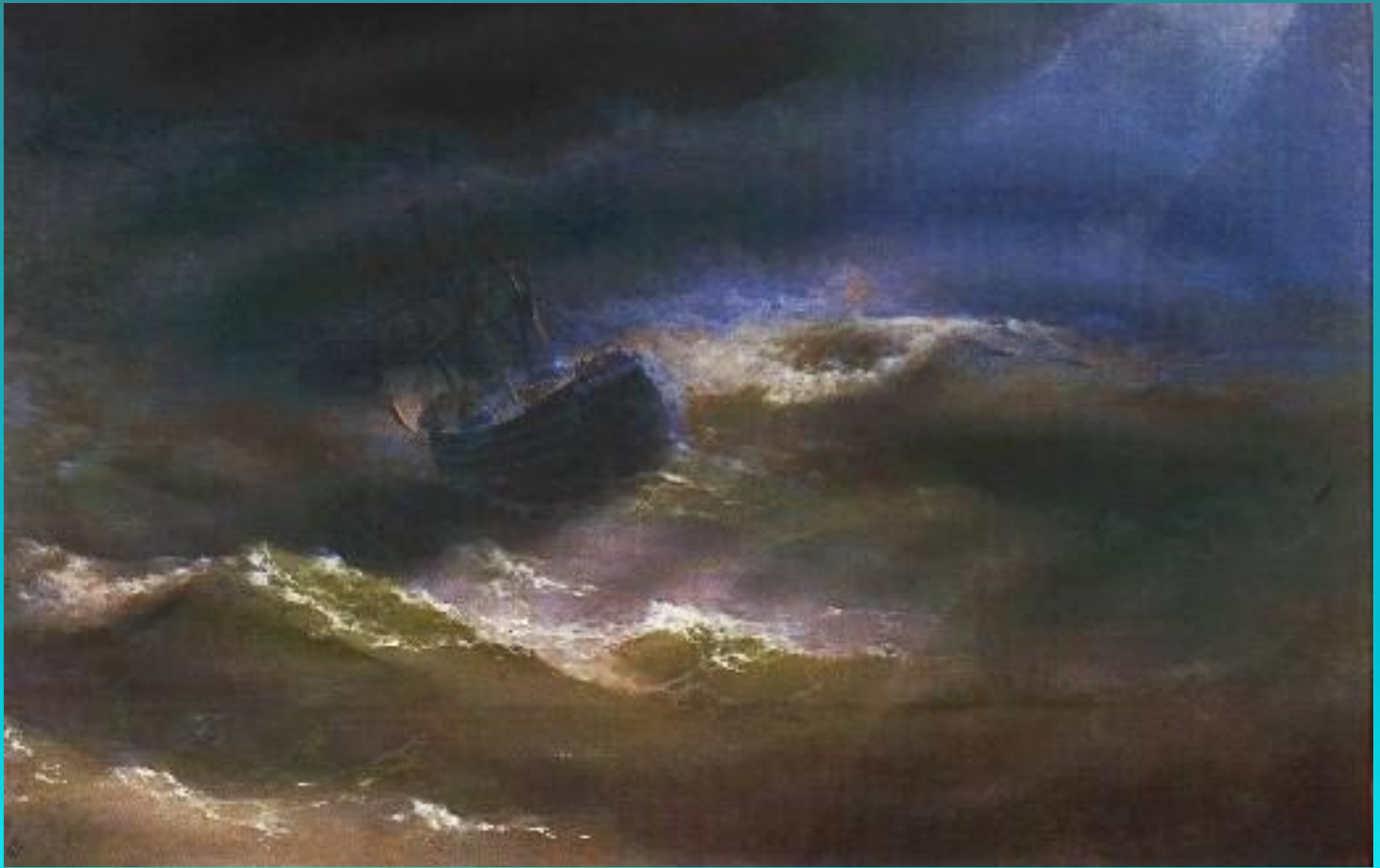
"Maria" in the storm.