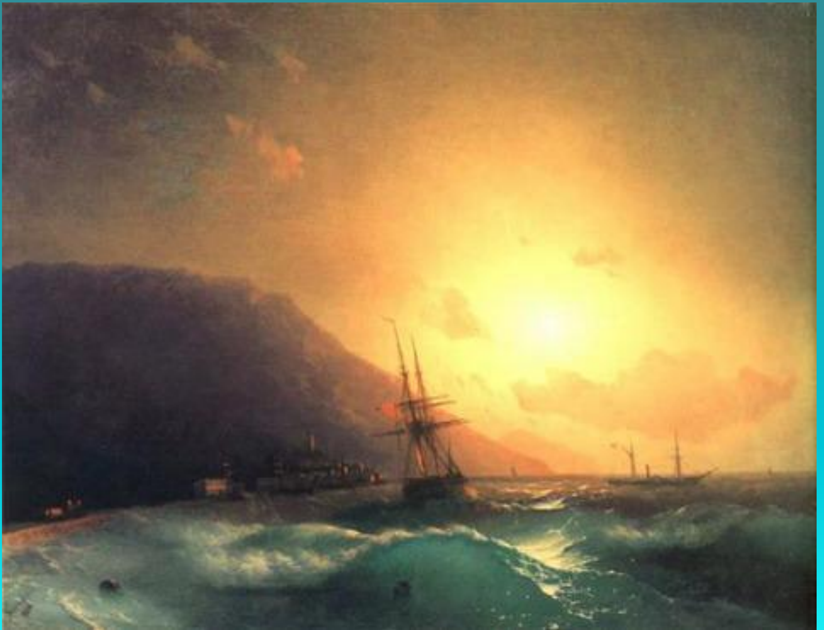
Off the coast of Yalta.