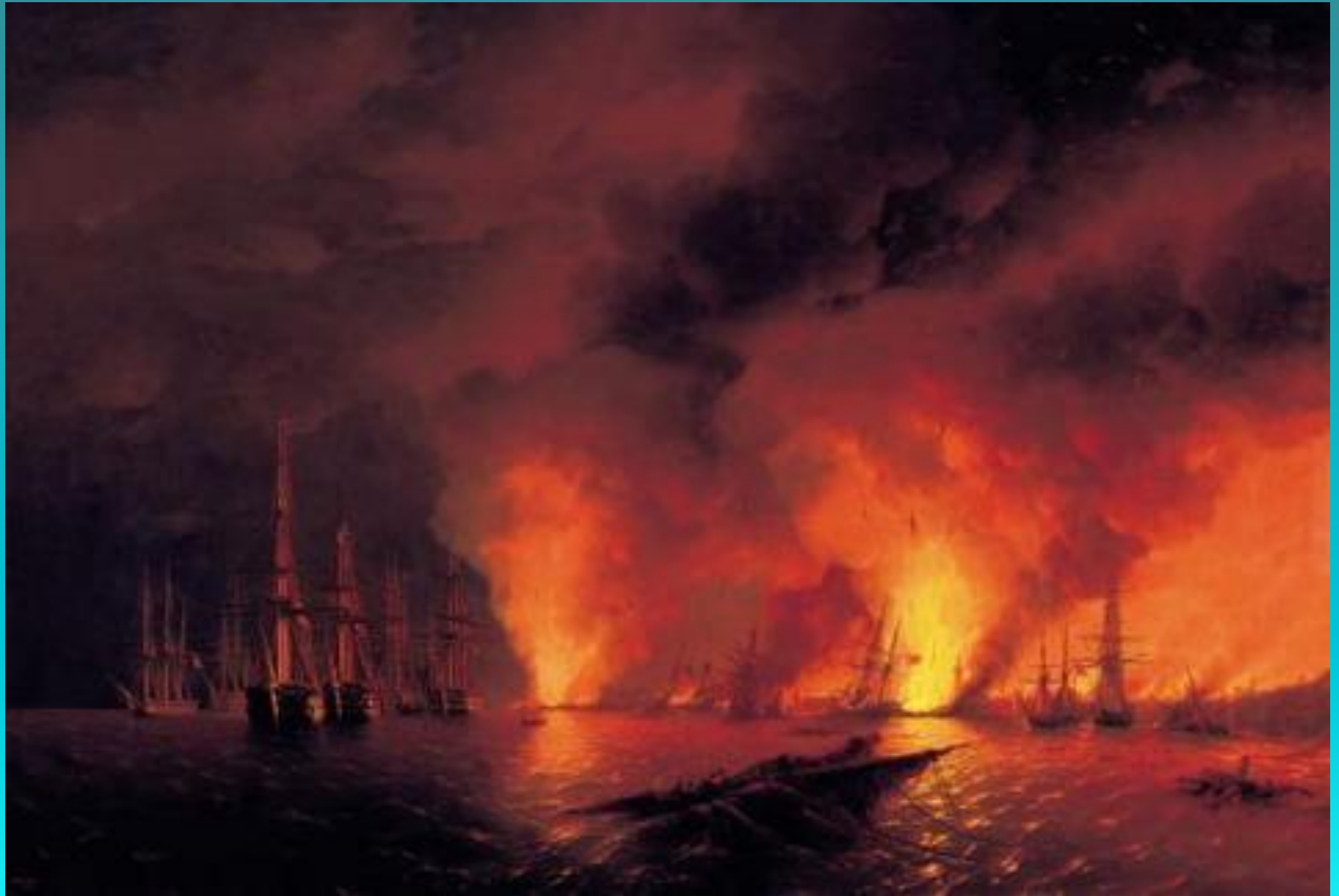
Battle of Sinop. The night after the battle.