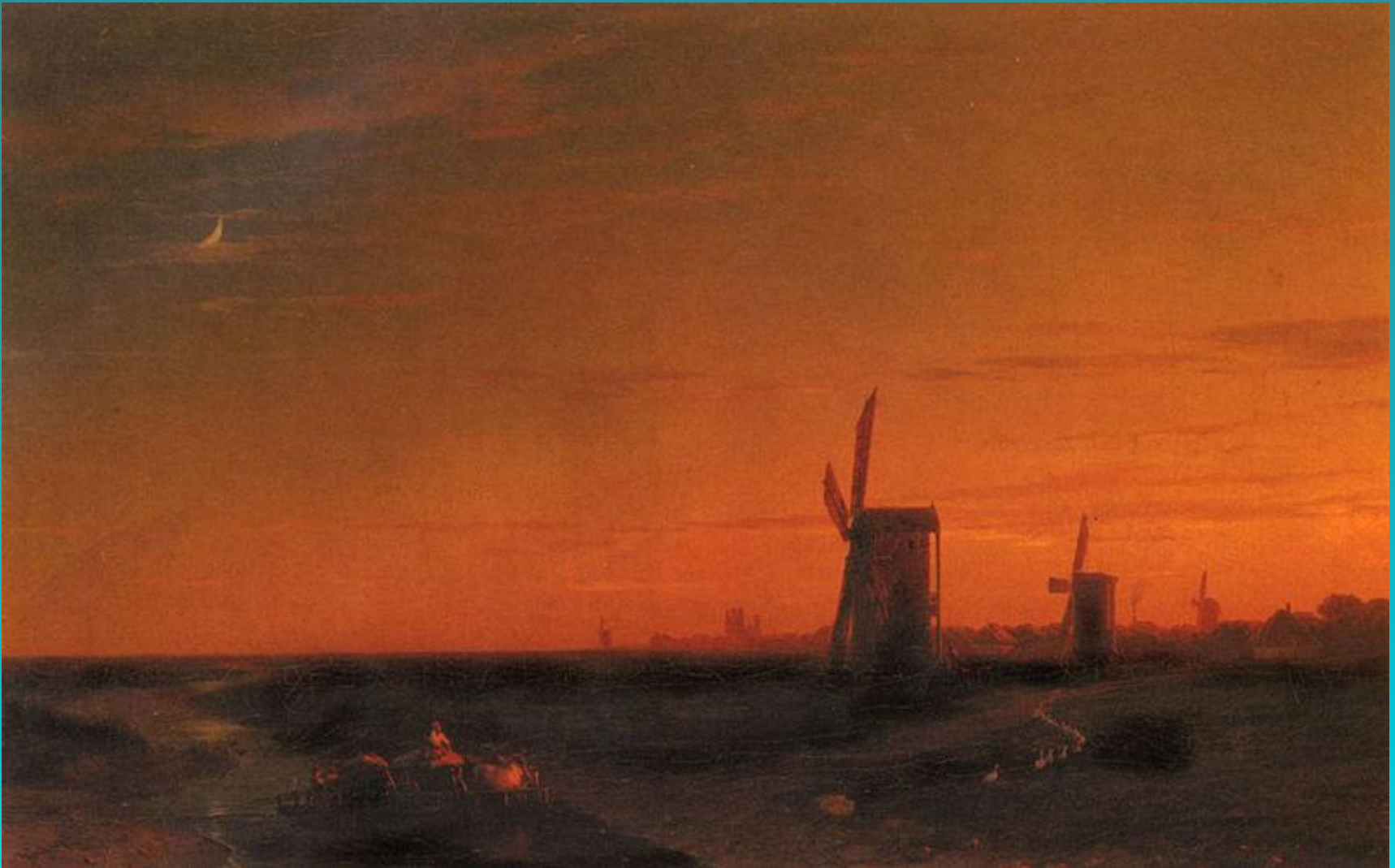
Landscape with windmills.