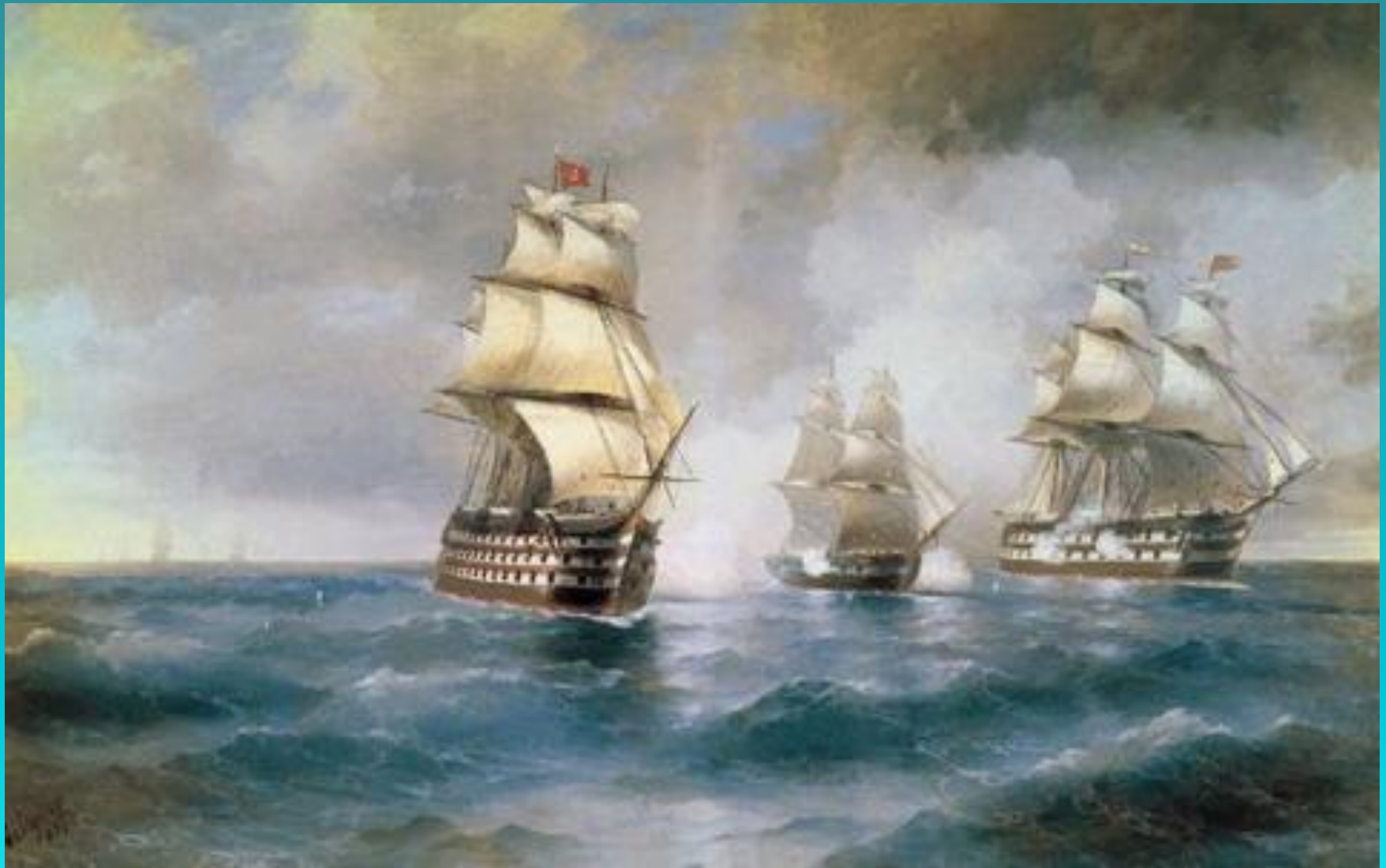
Brig "Mercury" attacked by two turkish ships