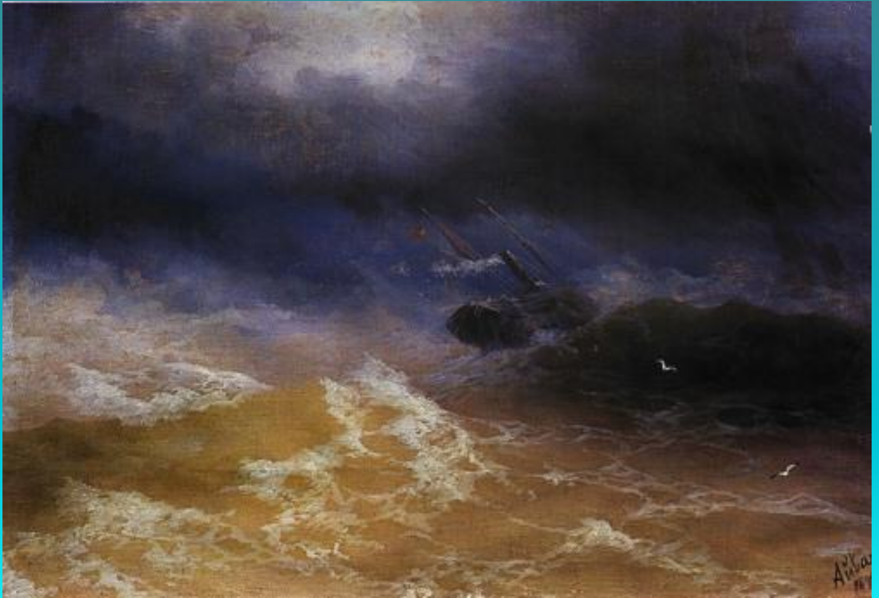
Storm at sea.