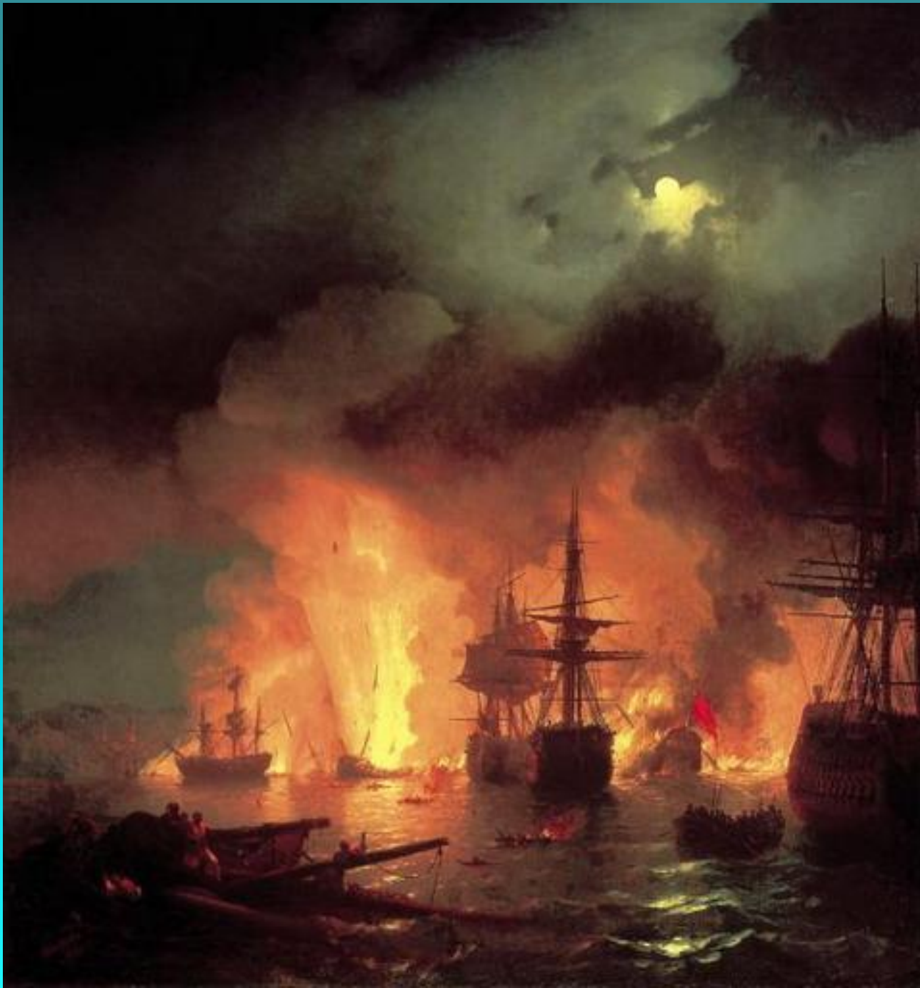
Battle of Chesmen'