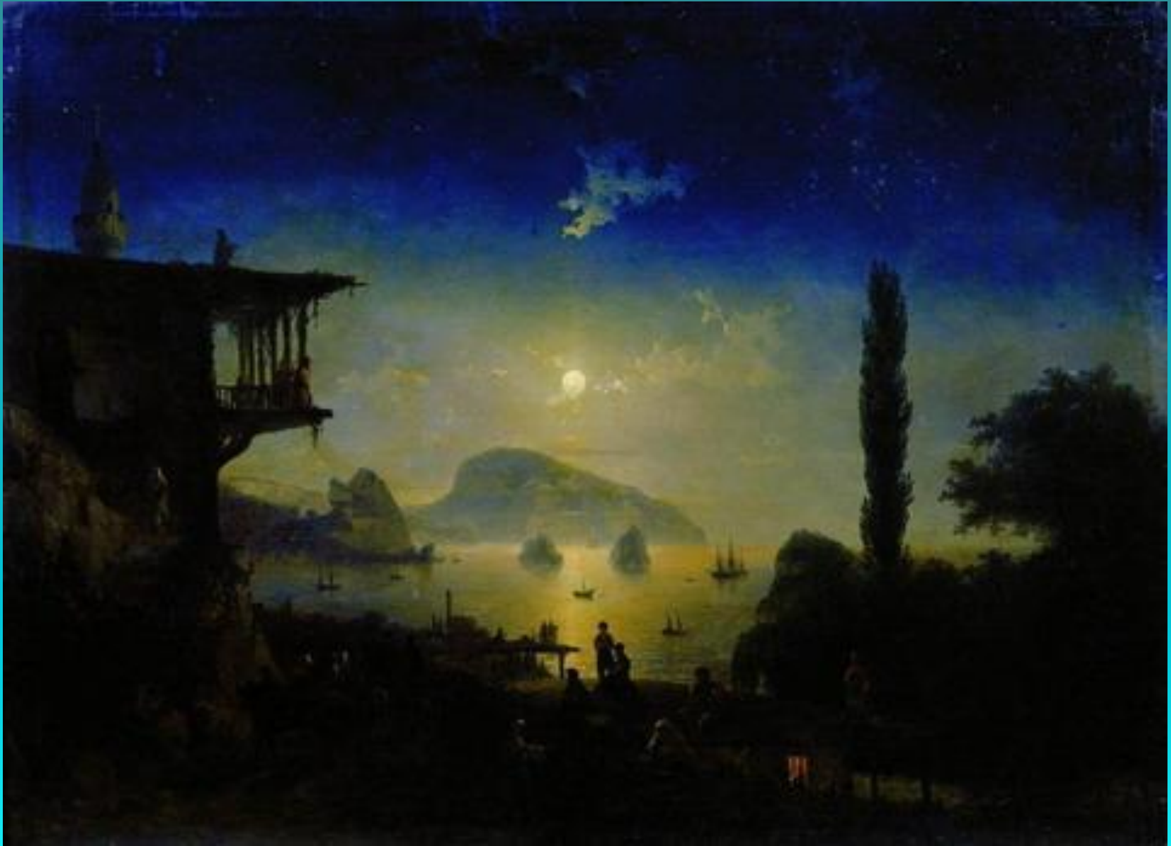
Moonlight night in the Crimea.