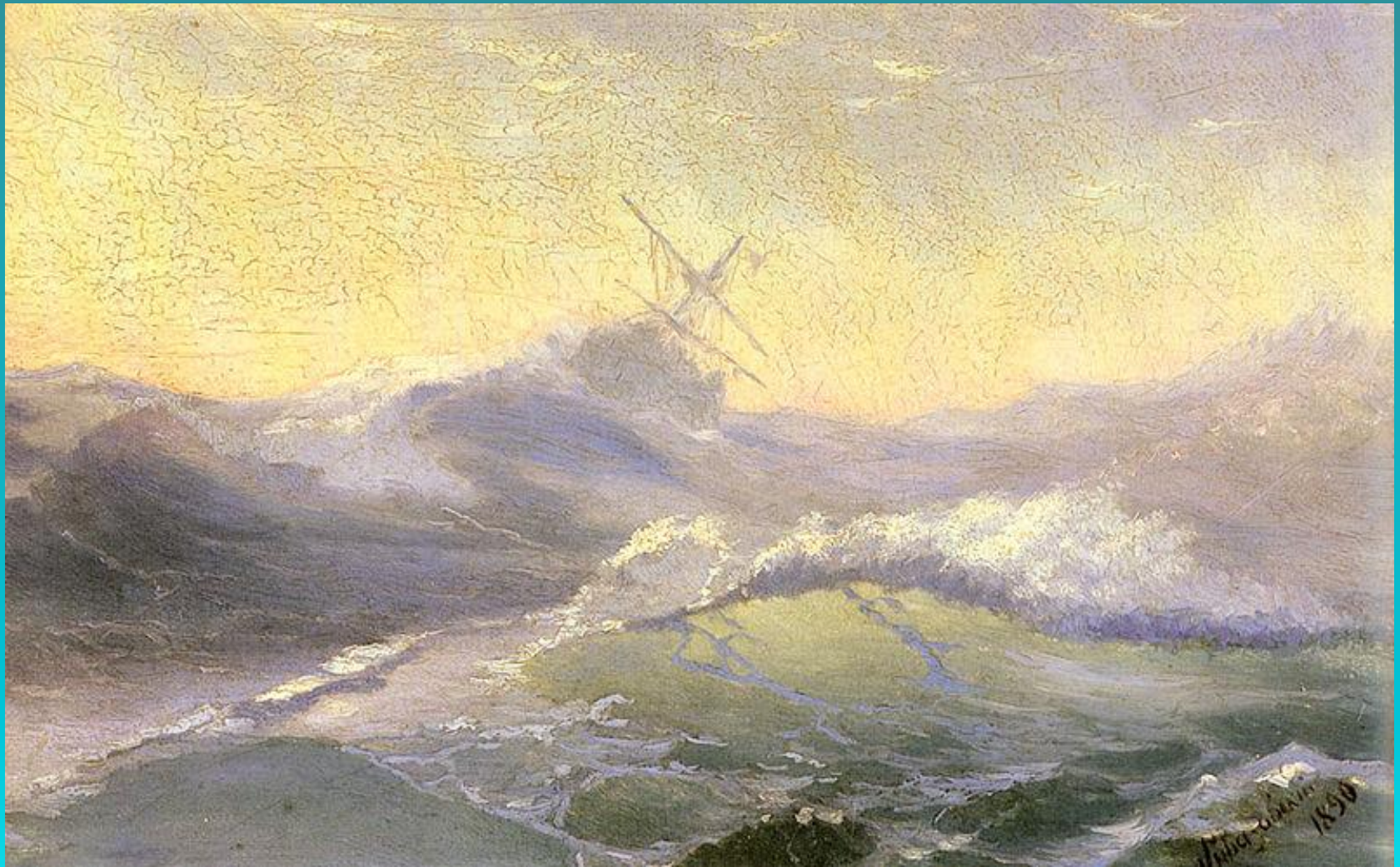
Бодрящая волна. Invigorating wave.