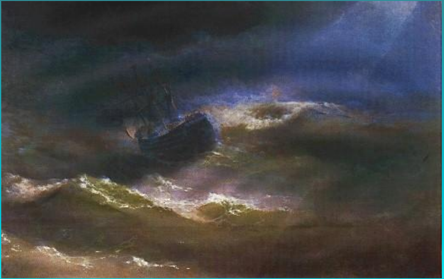
"Maria" in the storm.