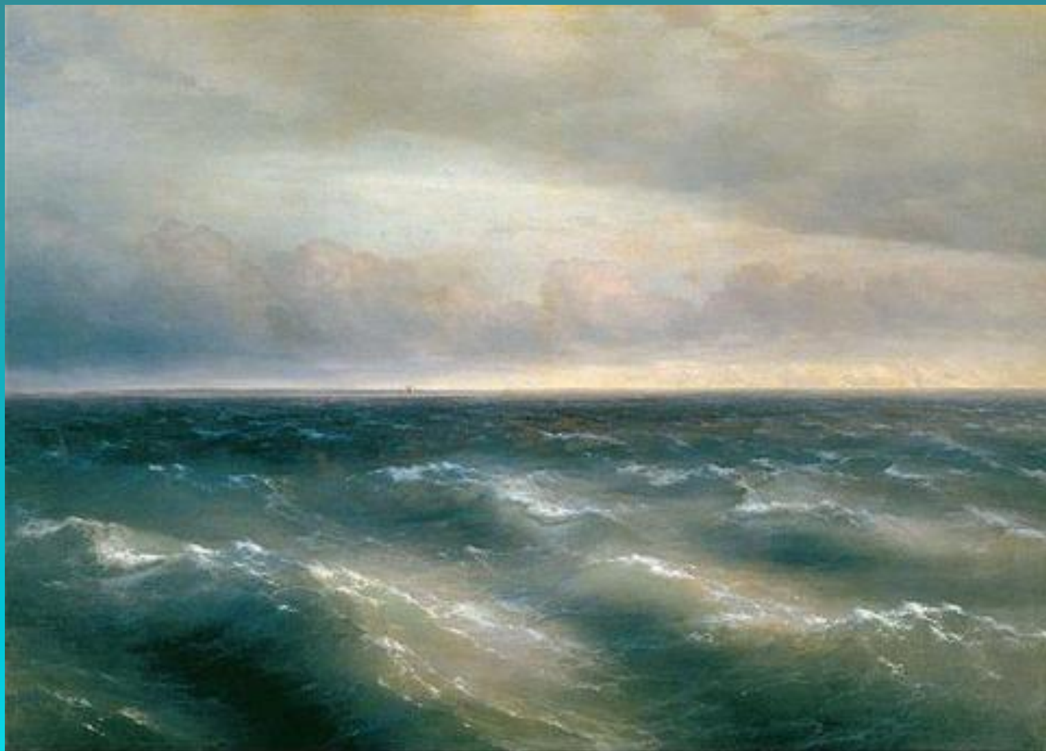
Black Sea. (kept in the Tretyakov Gallery)

The plot is simple - water, waves, and ... the sky. Somewhere in the distance a lone sail. Taken artist highest point of view makes it possible to create the illusion of movement of waves.