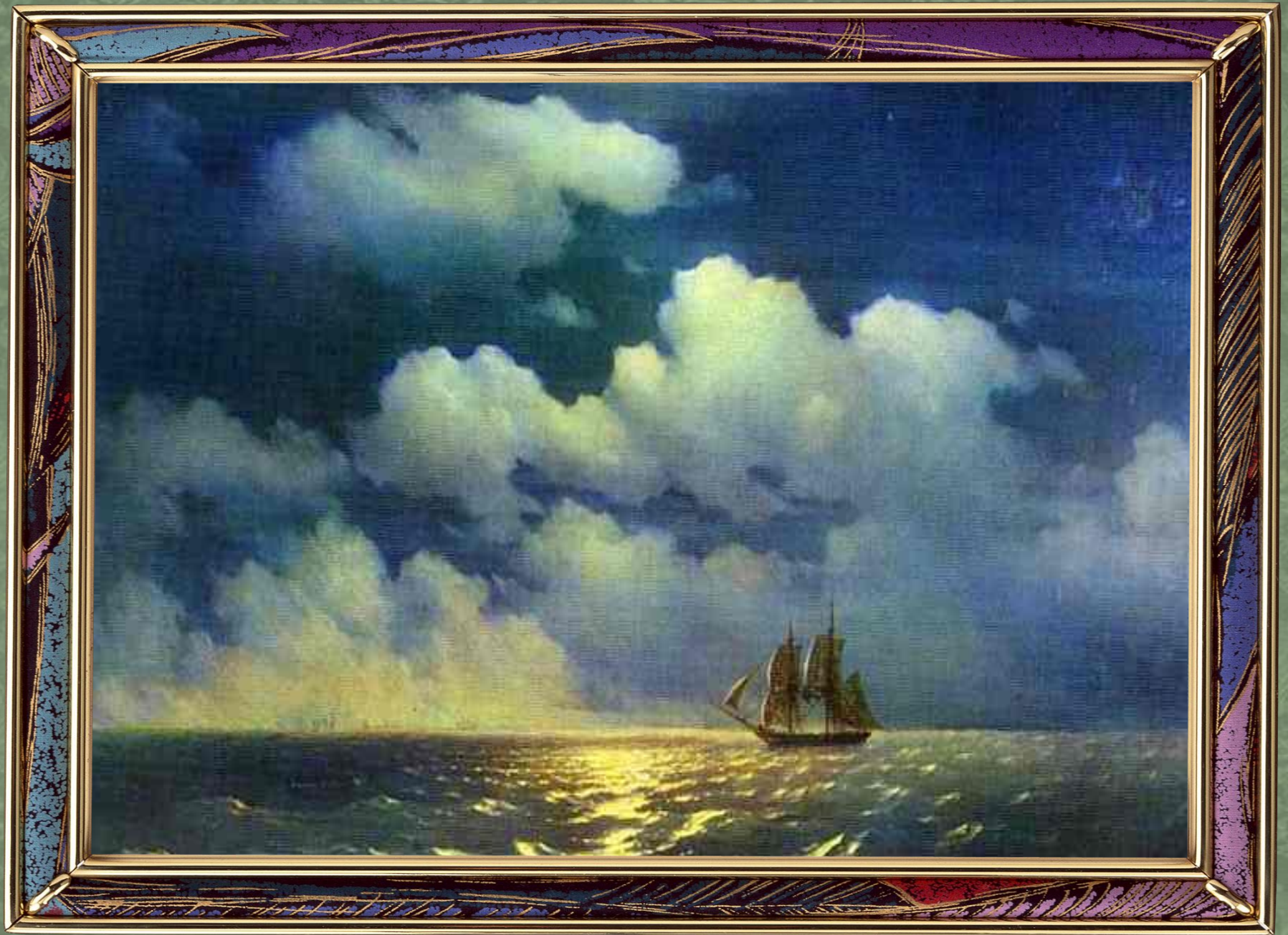
Meeting Brig Mercury with the Russian squadron