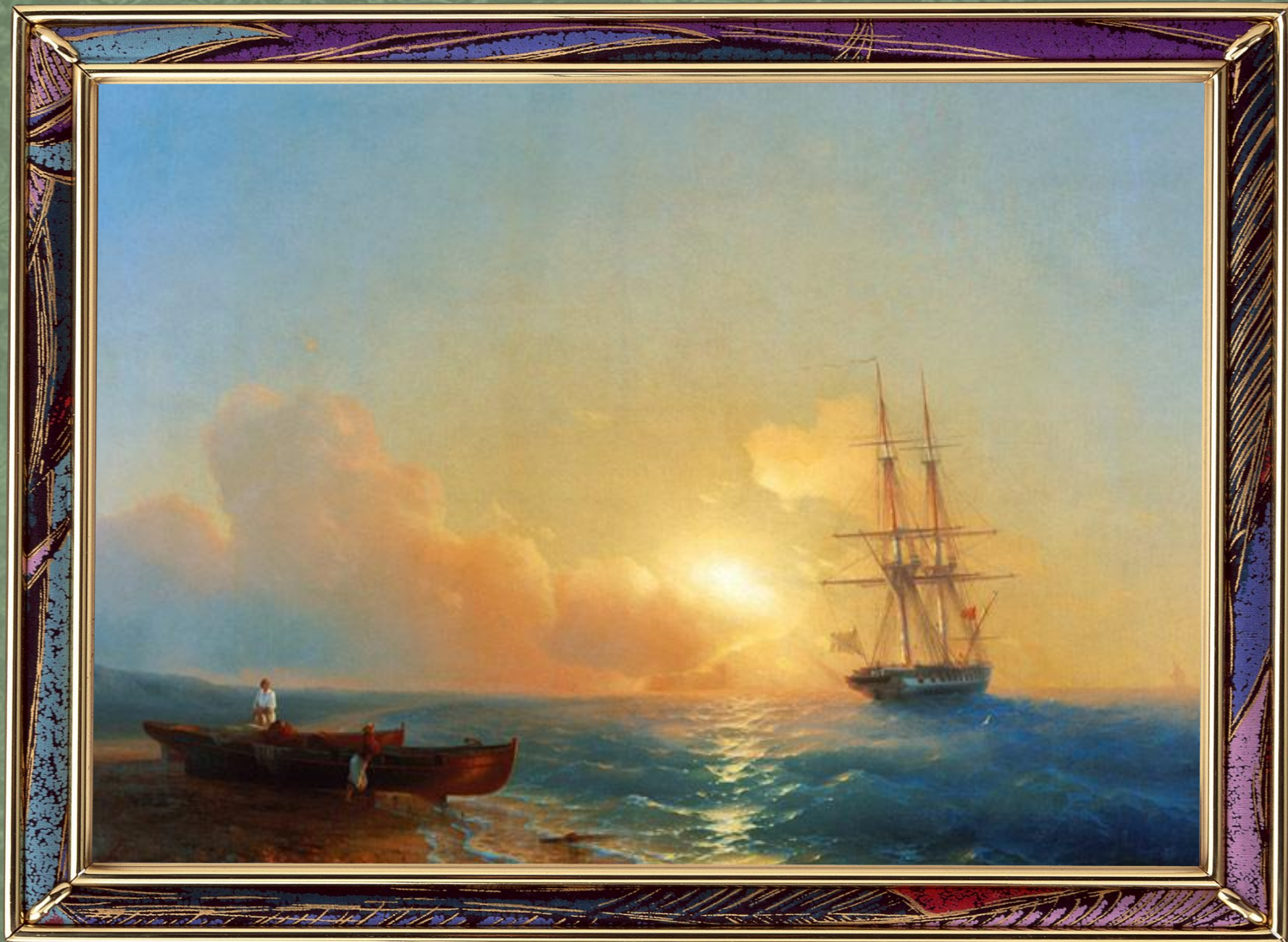
Fishermen on the beach(Рыбаки на берегу моря)