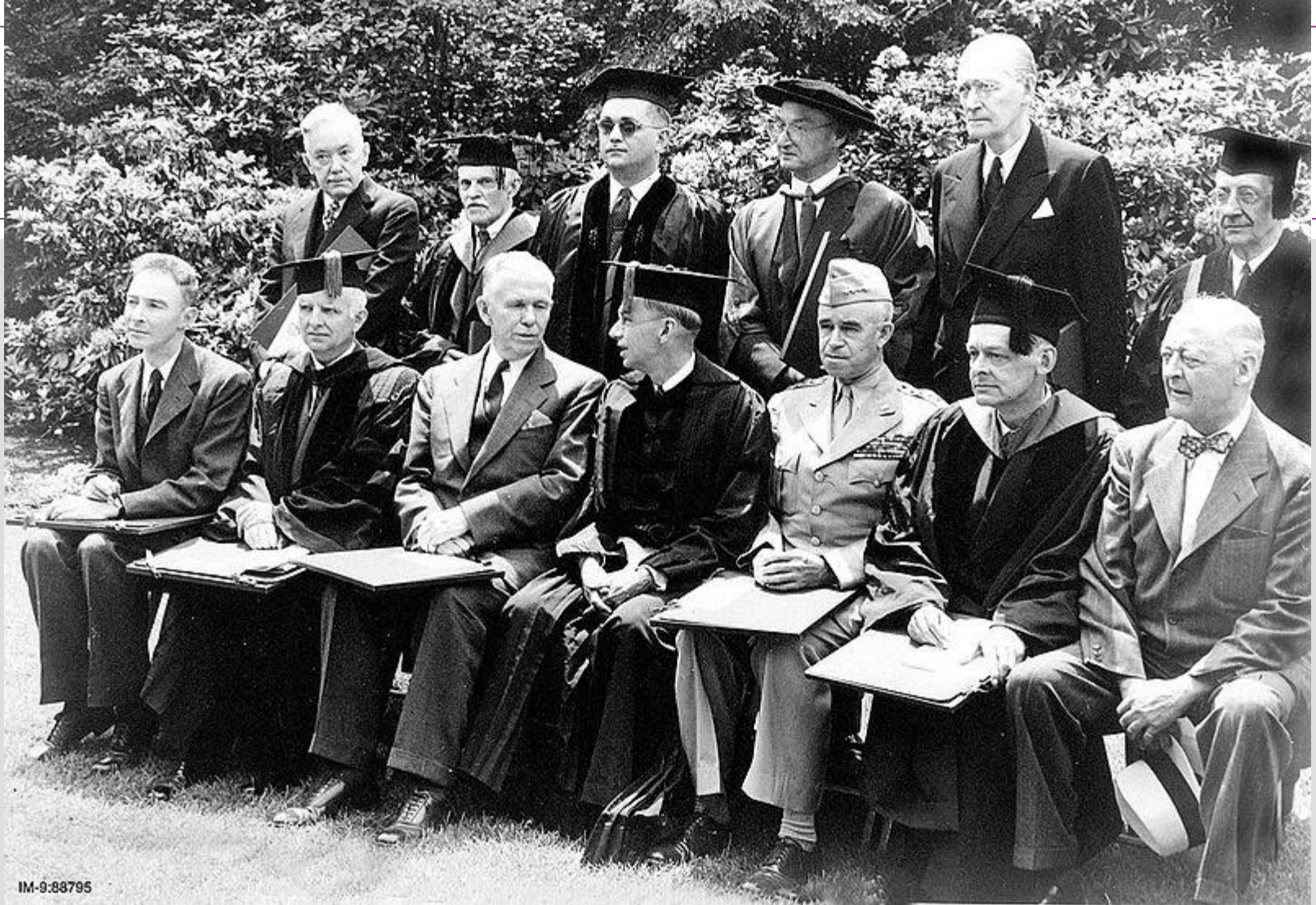
5 June 1947. Award of honorary degrees at Harvard to Oppenheimer (left), George C. Marshall (third from left) and Omar N. Bradley (fifth from left). The President of Harvard University, James B. Conant, sits between Marshall and Bradley.