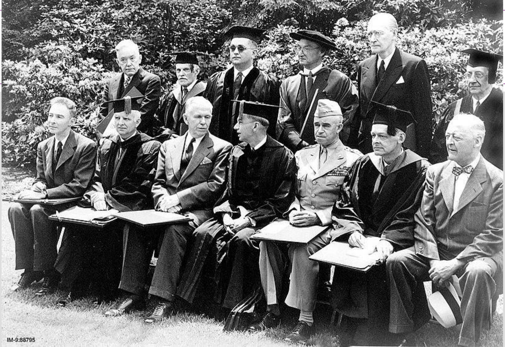
5 June 1947. Award of honorary degrees at Harvard to Oppenheimer (left), George C. Marshall (third from left) and Omar N. Bradley (fifth from left). The President of Harvard University, James B. Conant, sits between Marshall and Bradley.