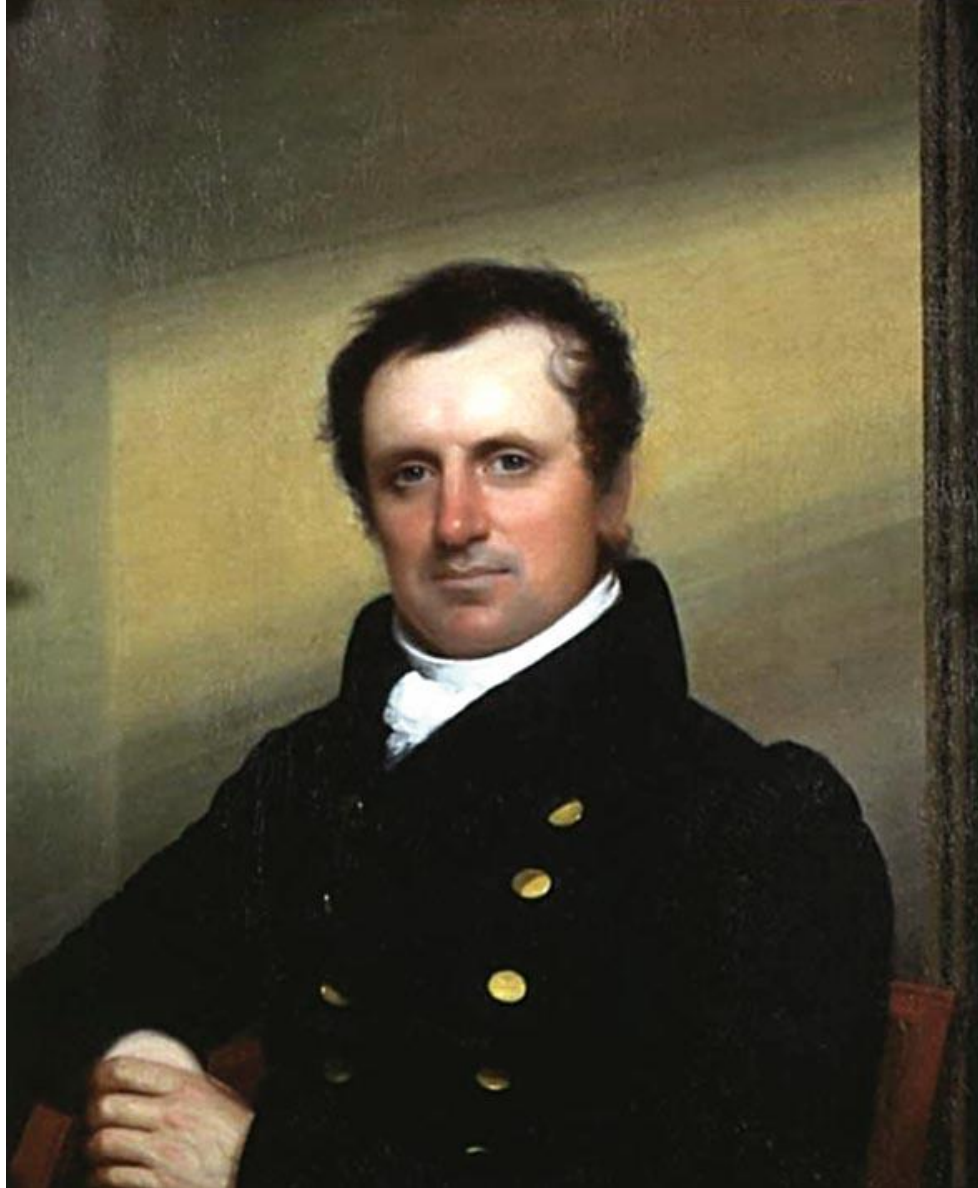
James Fenimore Cooper