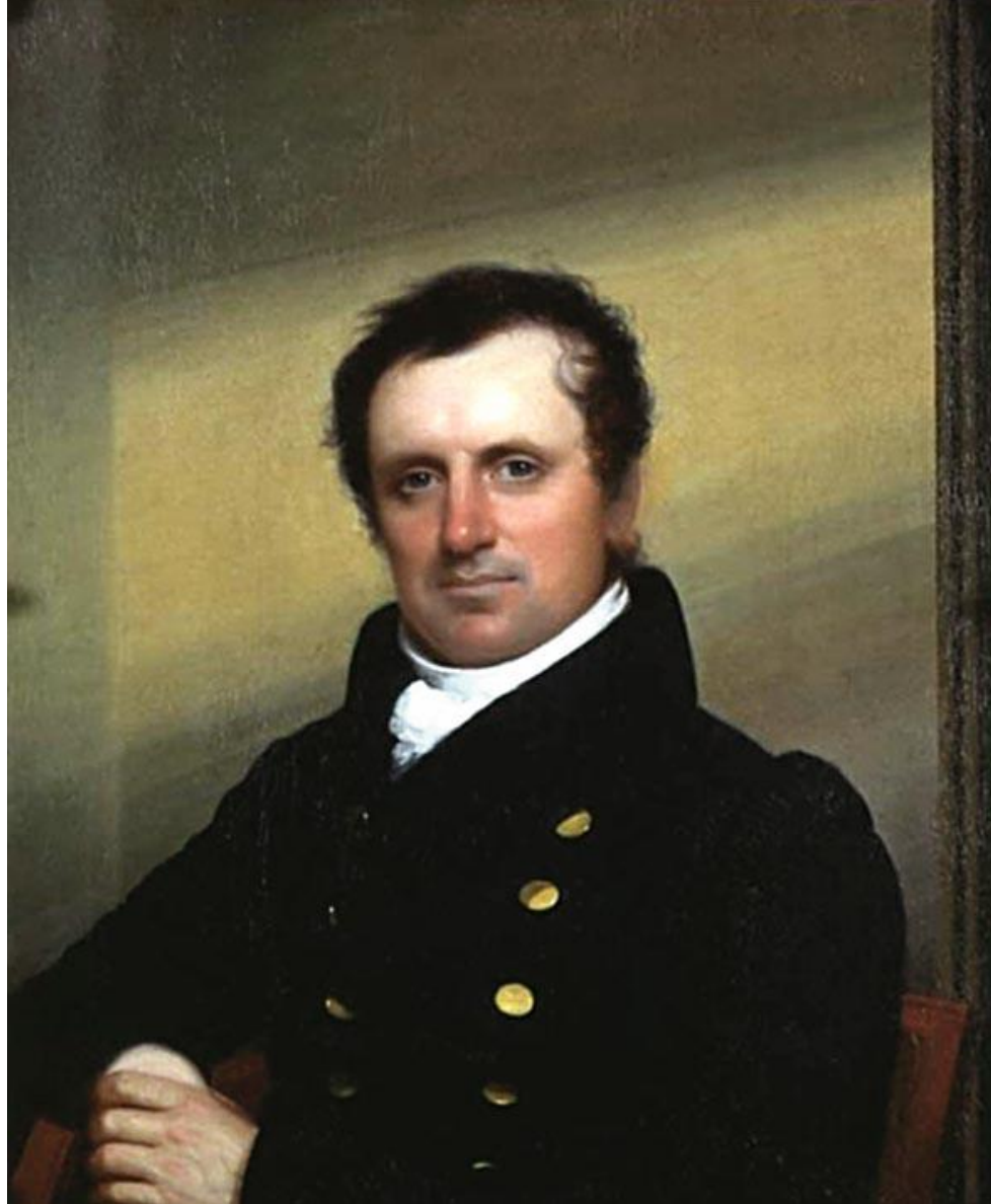
James Fenimore Cooper