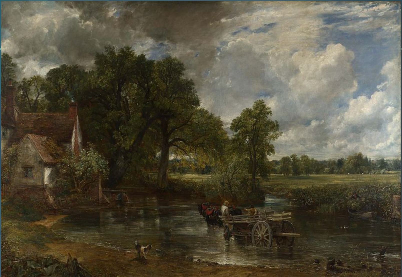
The Hay Wain