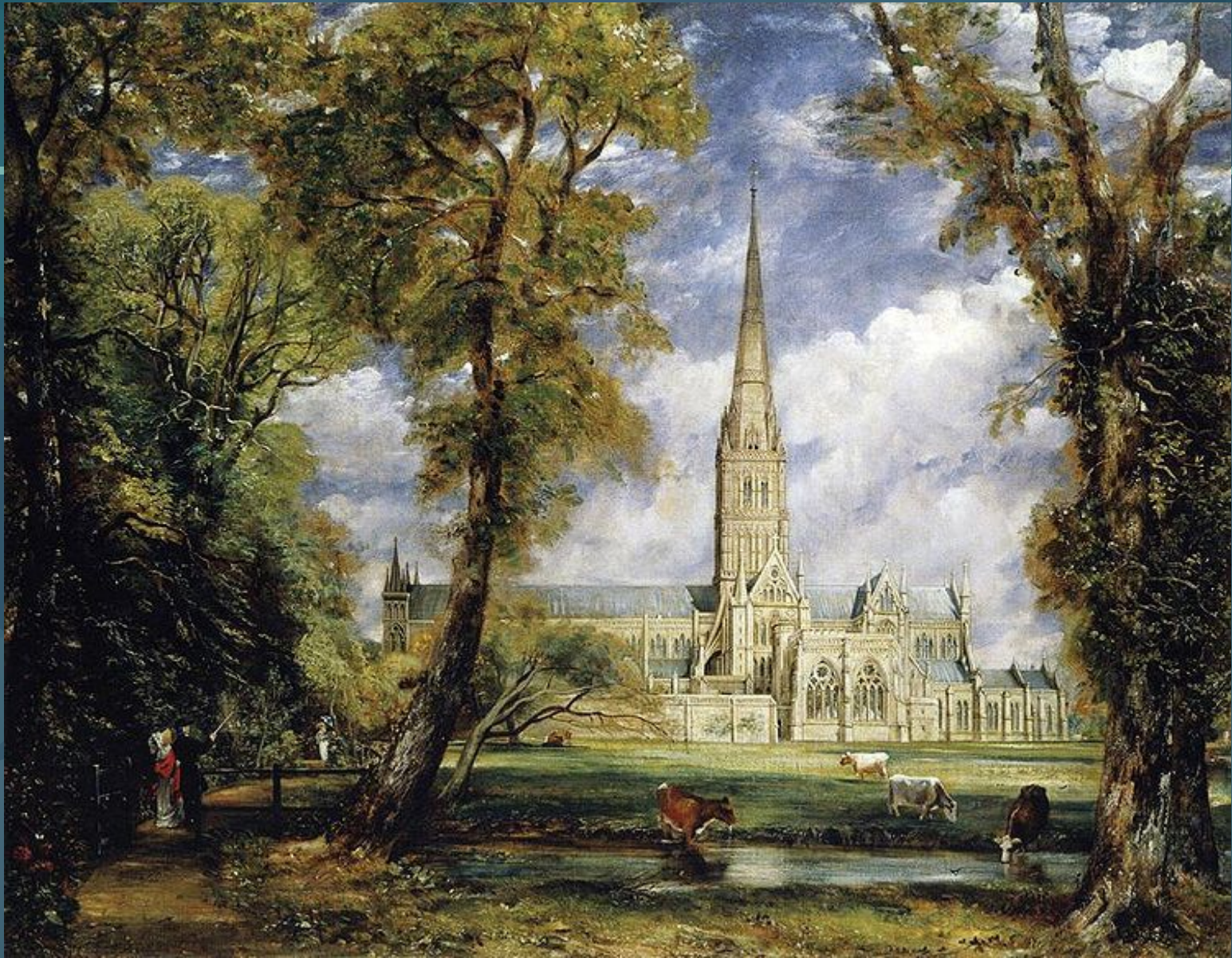
Salisbury Cathedral from the Bishop's Garden John Constable