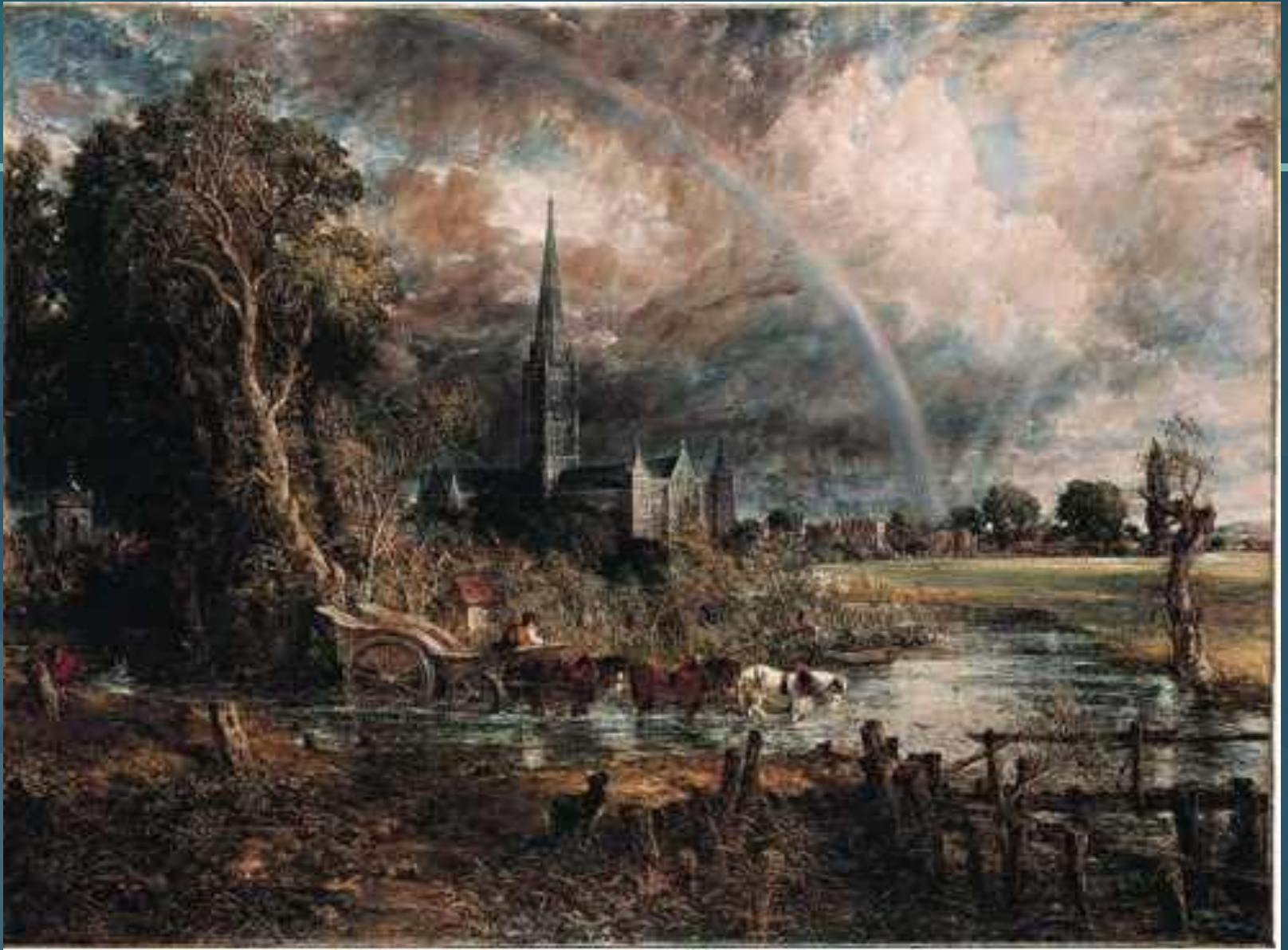
Salisbury Cathedral from the Meadows