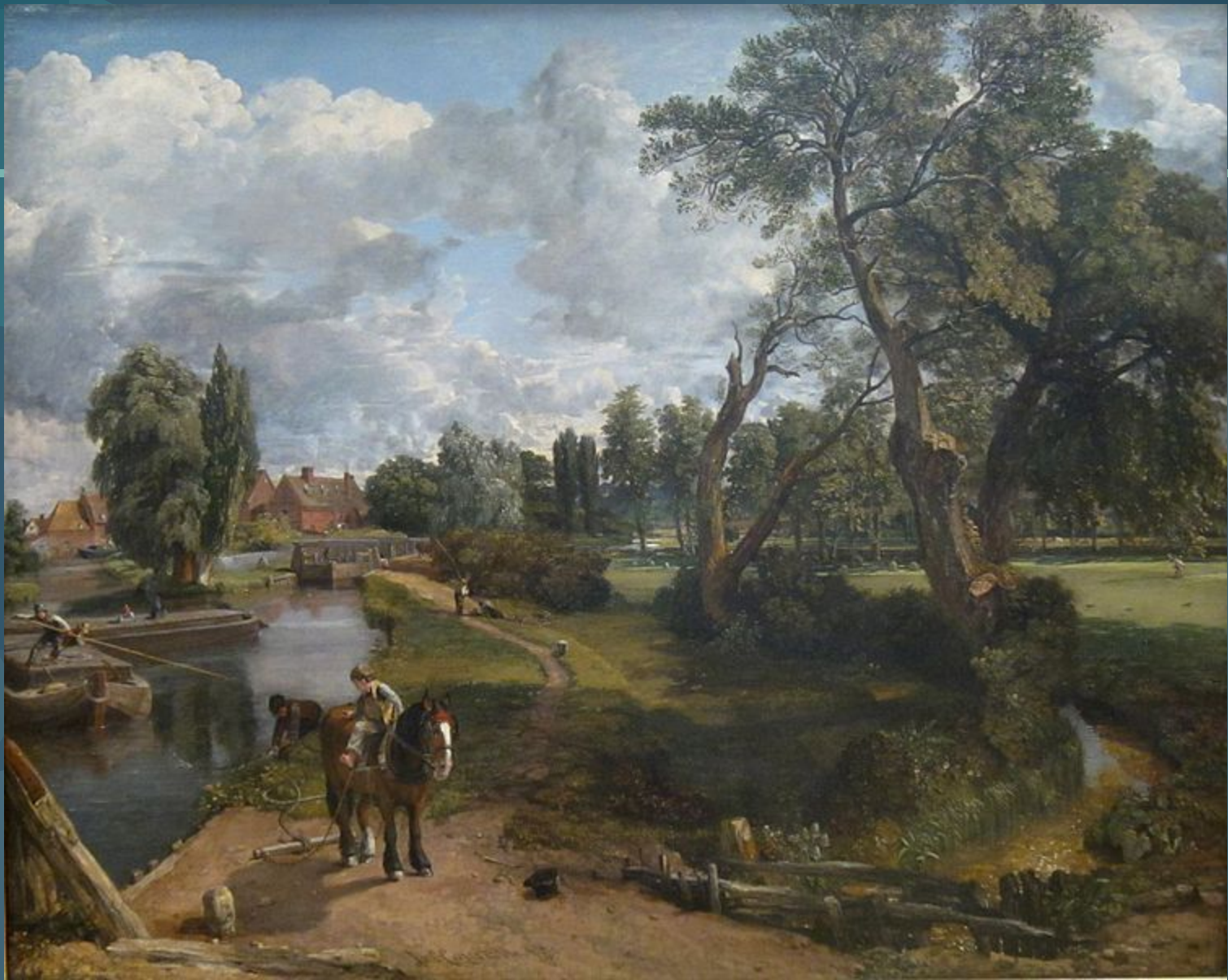
Flatford Mill (Scene on a Navigable River)