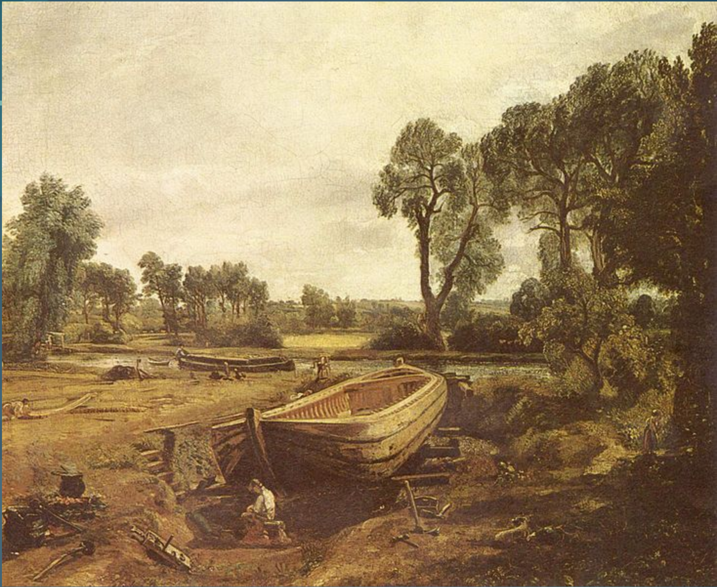
Boat-building near Flatford Mill (1815)