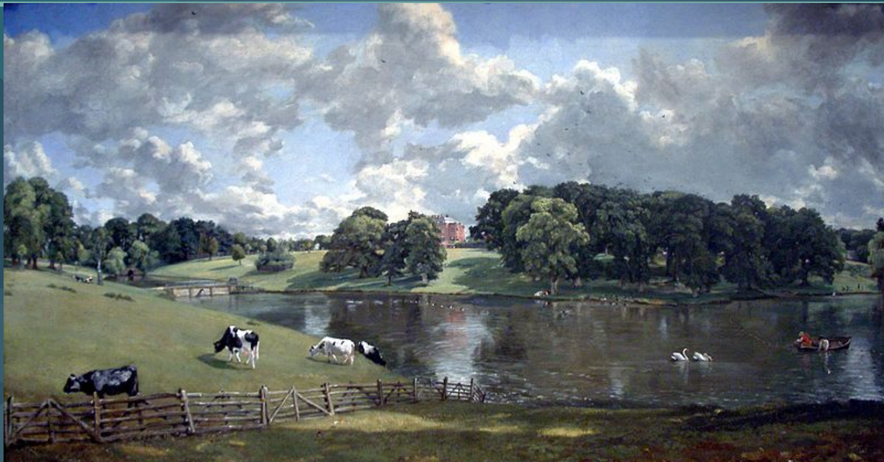
Wivenhoe Park (1816)