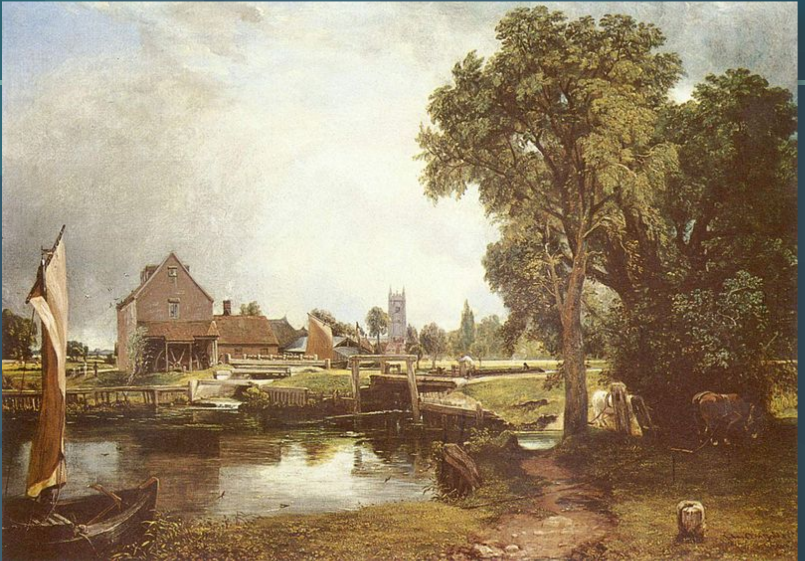
"The dam and mill in Dedham."