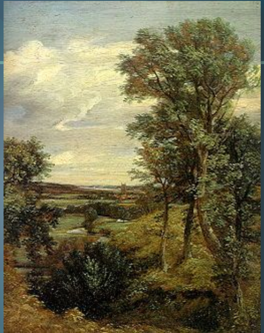
Dedham Vale (1802)