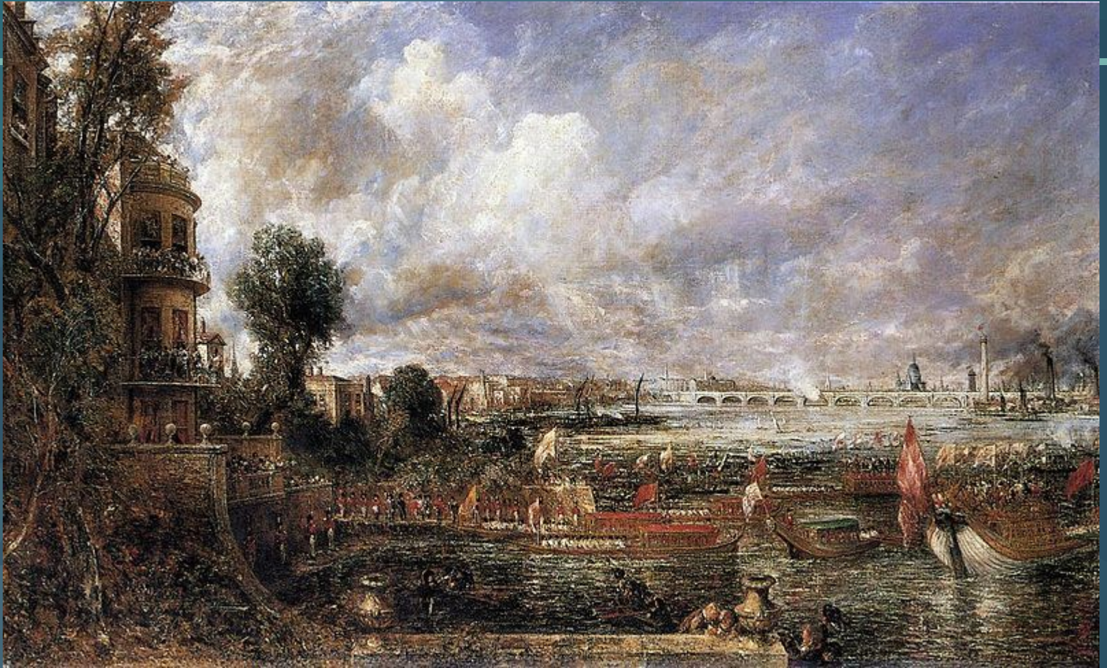
The Opening of Waterloo Bridge seen from Whitehall Stairs, June 1817