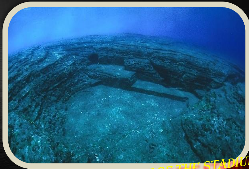
PART OF THE STADIUM