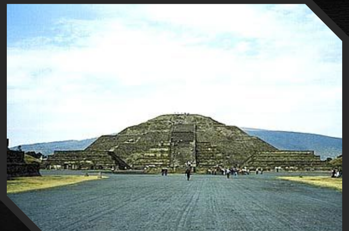
GREAT WHITE PYRAMID, CHINA