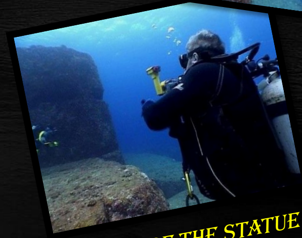
HEAD OF THE STATUE