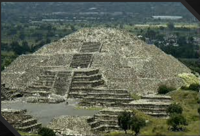
PYRAMID OF THE MOON, TEOTIUKAN

In China there are ruins of pyramids which are at the present a little studied as the Chinese government does not finance such researches and doesn't let experts from other countries investigate them. The white pyramid which edge's length is 300 m, is very similar to pyramids of Teotiukan in Mexico. Provided that the Japanese islands were once a part of the continent, it is possible to assume that builders of a pyramid in Jonaguni received this knowledge from China. Meanwhile the Chinese pyramids received are related to the period about 2000 B.C. Therefore there is a question: whether this knowledge came from other ocean coast, from Central America. The possibility of colonisation of the East by America is not so improbable, as it seems at first sight. Similarity between sculptures of temples Angkor (Cambodia) and Tikal (Guatemala), the American peanuts which are about 4000 years old, weren found in a province Zhejiang, and the Chinese objects in America, apparently, speak well for that between two continents there was a communication, and a constant one.