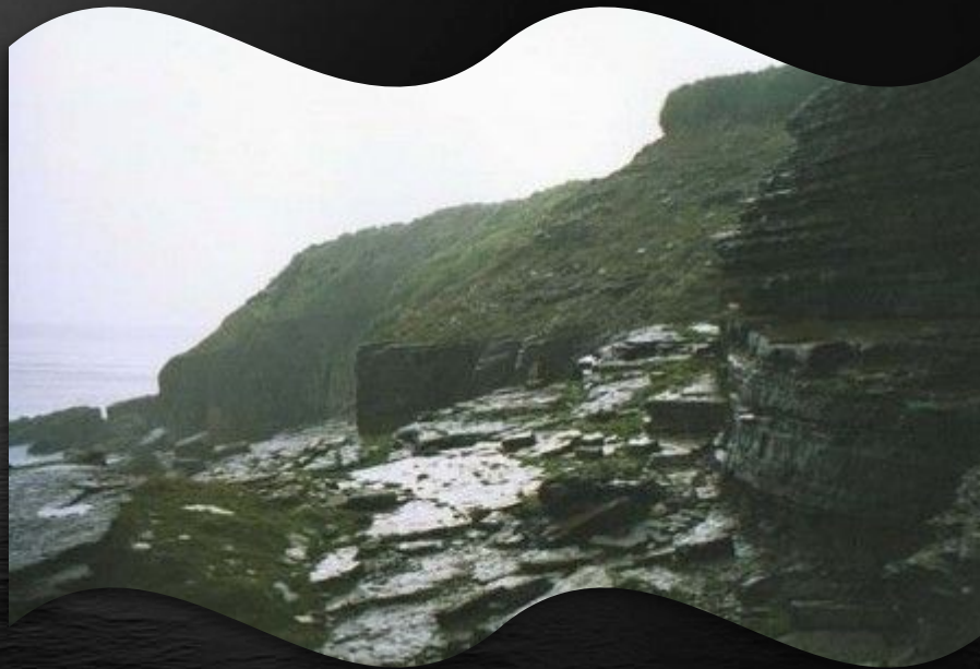
JONAGUNI ISLAND, JAPAN

The complex was casually found in spring of 1985, by the local instructor of diving Kihachiro Aratake. Near the coast it is literally under a surface of waves he saw the enormous stone monument stretched to visibility limits. The wide equal platforms covered with an ornament from rectangles and rhombuses, passed in intricate terraces, which were going downwards the big steps. The object edge breaks vertically downwards a wall to the bottom on depth of 27 metres, forming one of the walls of the trench which are passing lengthways along the monument.