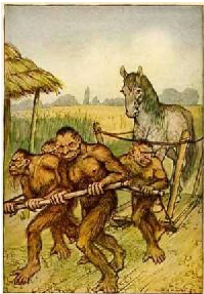
"I am coming towards the house a kind of vehicle driven like a judge by four yaks!"