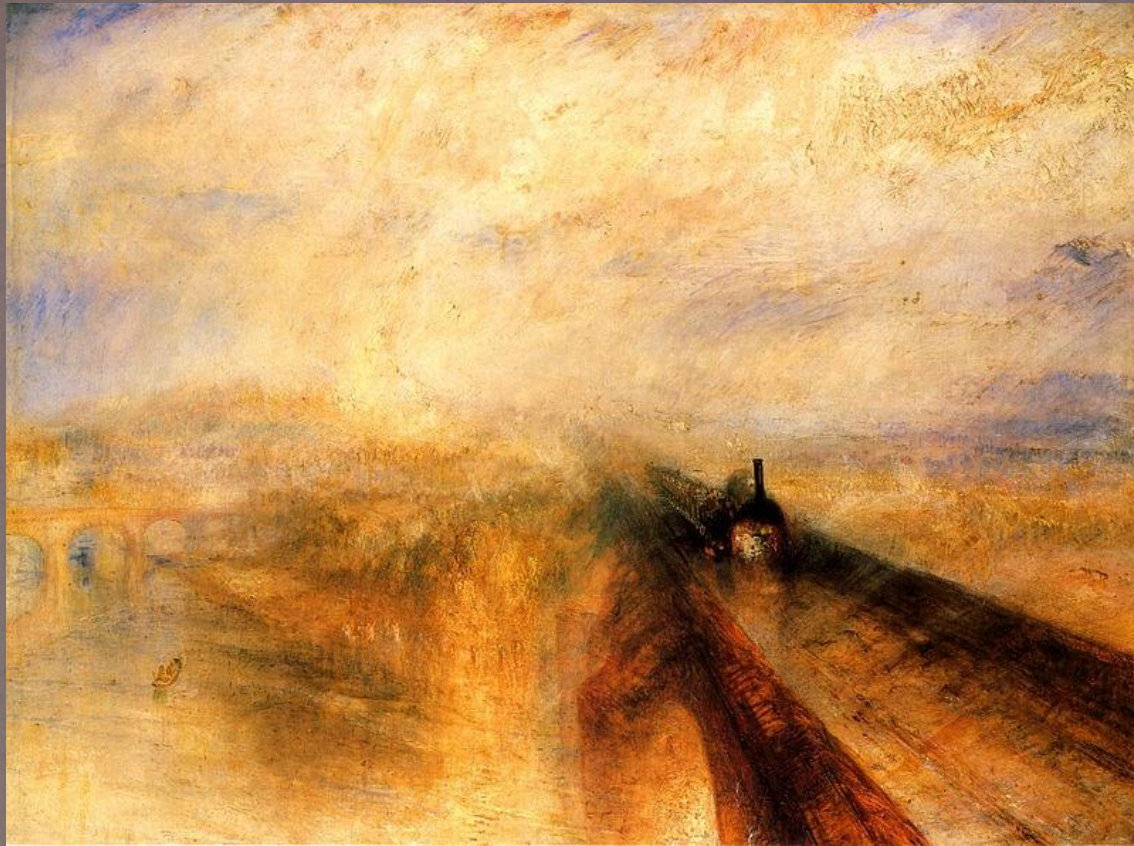
Rain, Steam and Speed

Turner's first drawings are dated 1787 when he was only twelve.