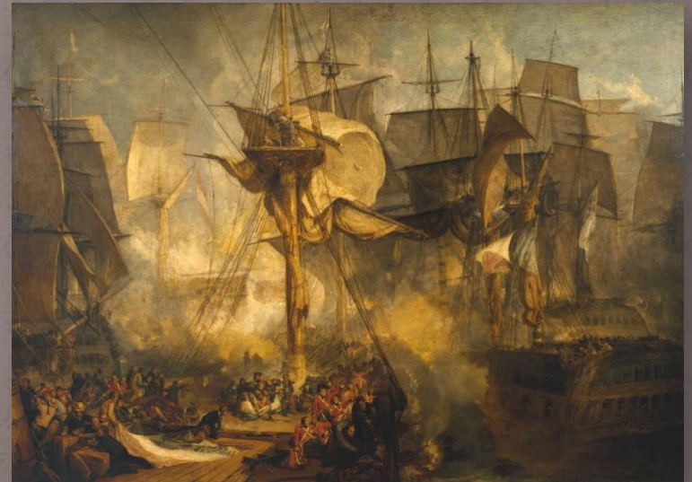
The Trafalgar Battle