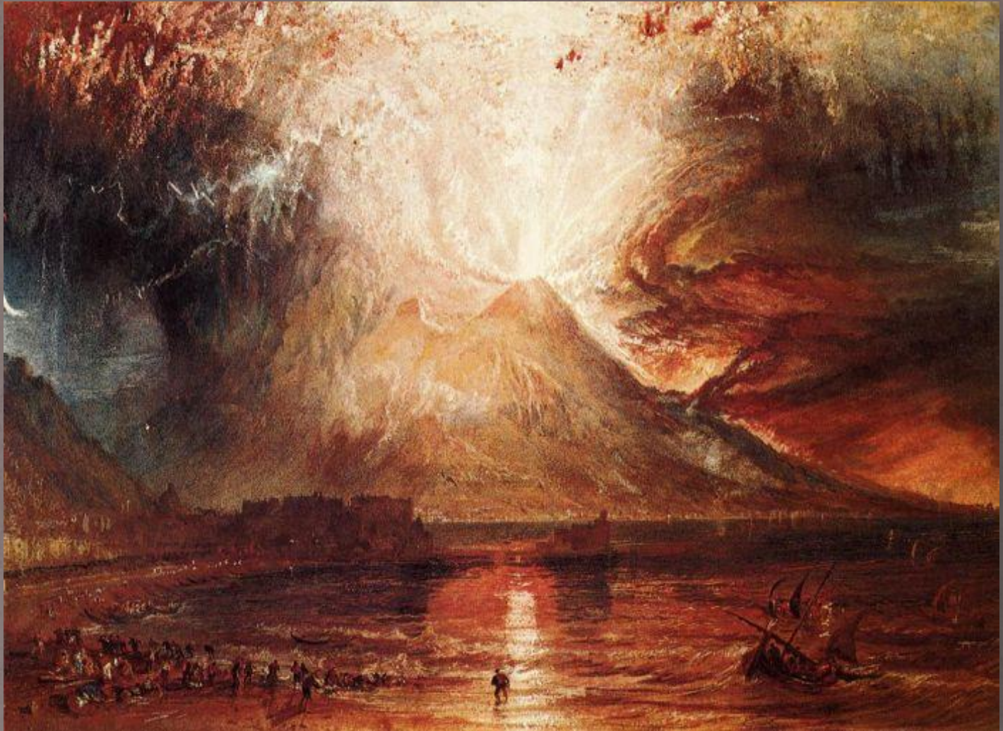
Eruption of Vesuvius