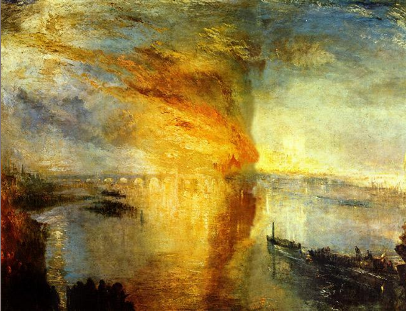
The Burning of the Houses of Lords and Commons.