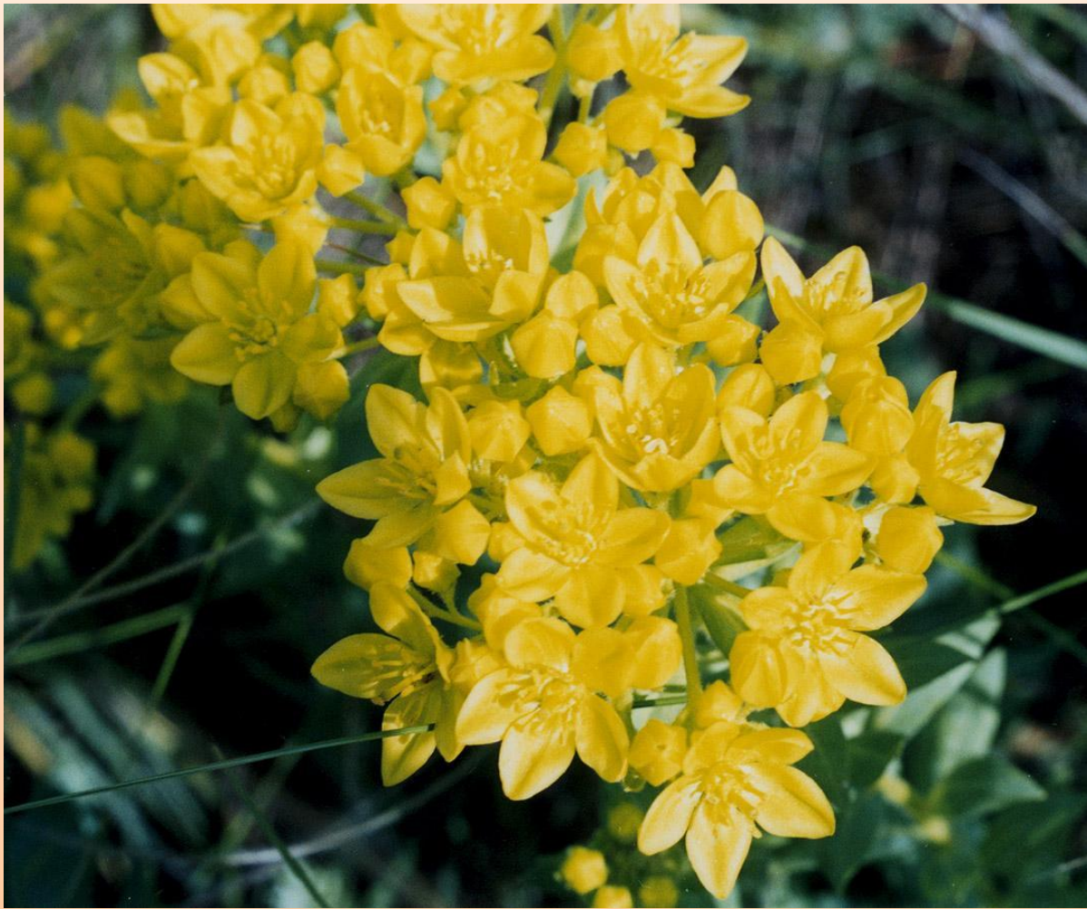
Narlophyllum suaveolens (Цельнолистник душистый)