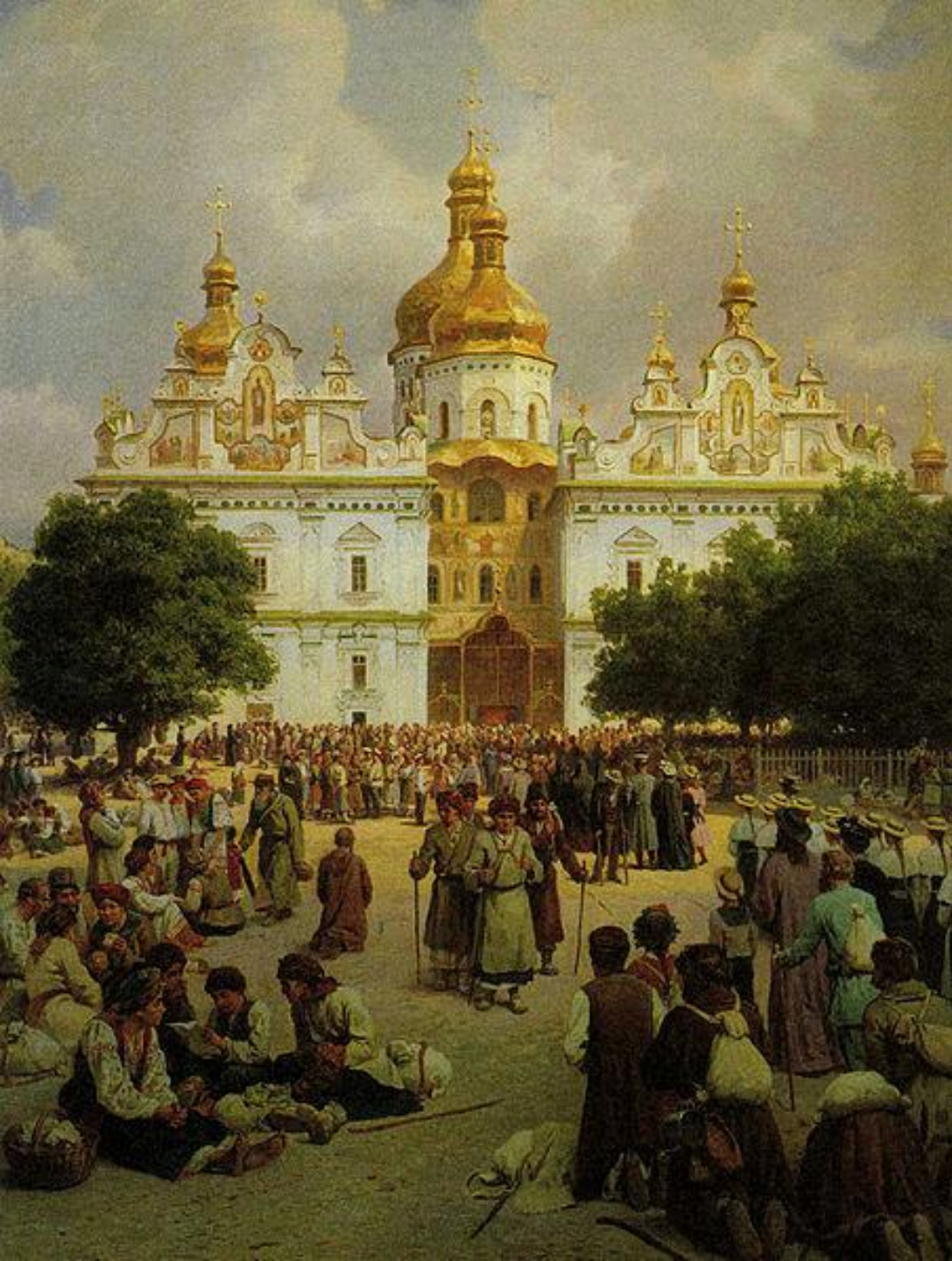
«The Great Church of the Kiev-Pechersk Lavra» painted by V. Vereshagin