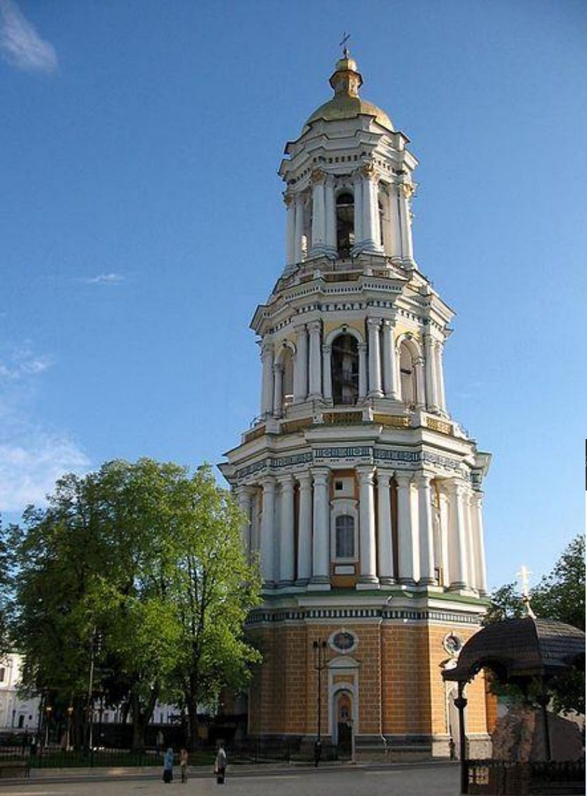
The Great Lavra Belltower