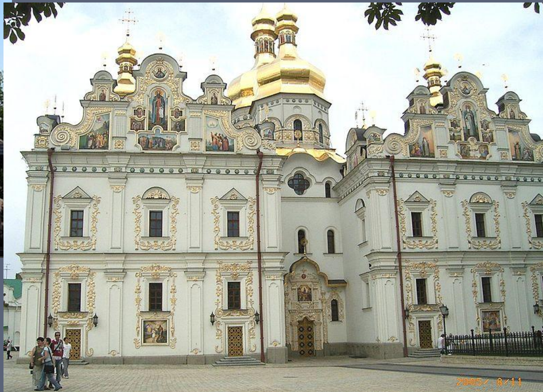
The Cathedral of the Dormition