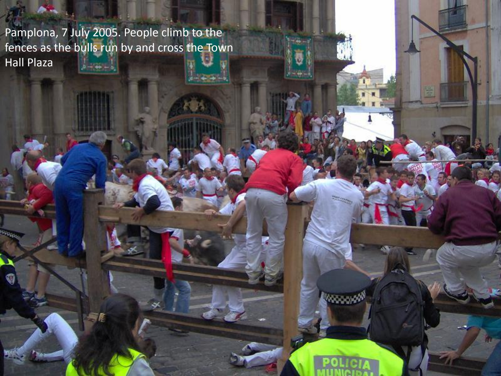
Pamplona, 7 July 2005. People climb to the fences as the bulls run by and cross the Town Hall Plaza