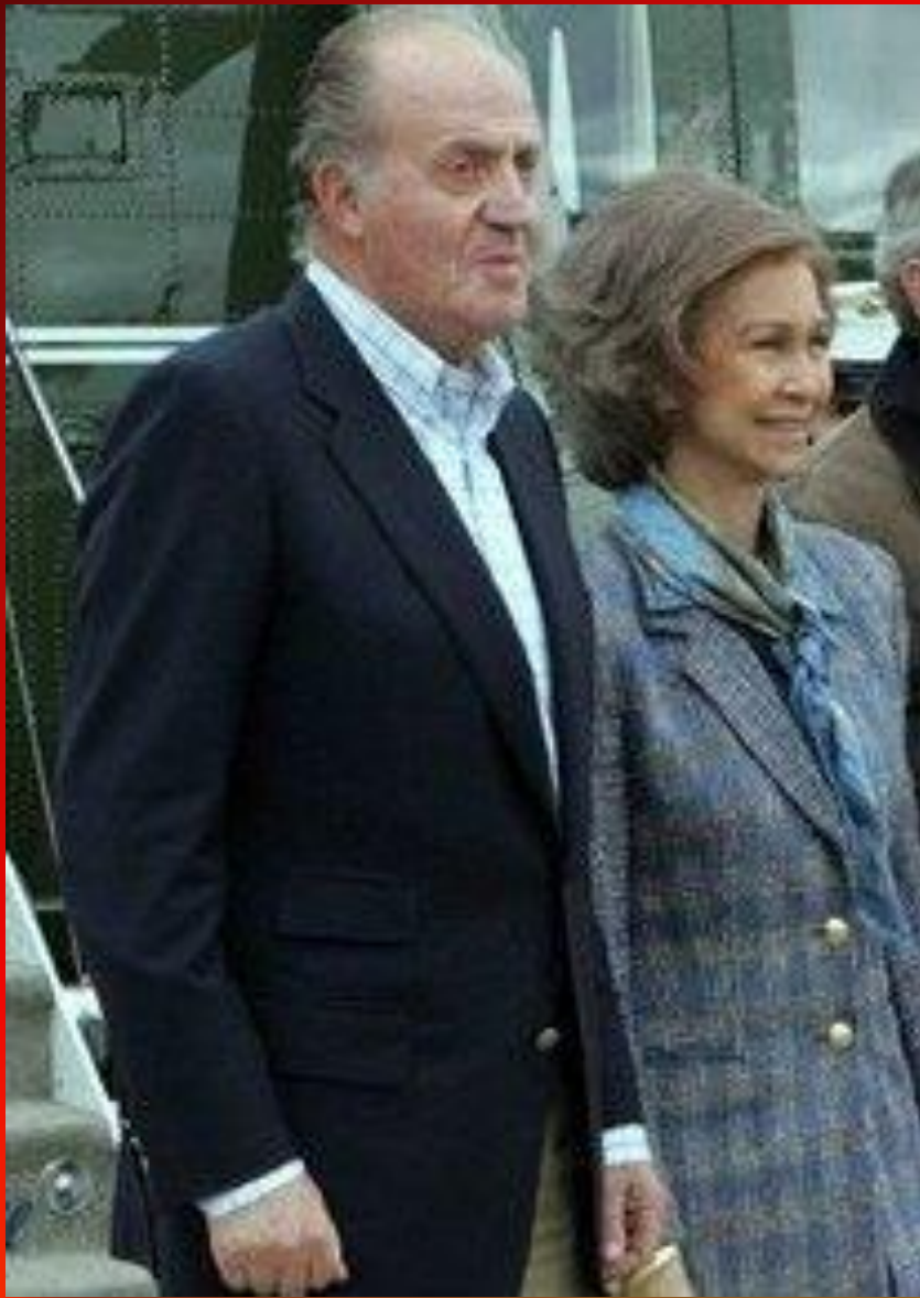
HM Juan Carlos I King of Spain and HM Queen Sofía of Spain.