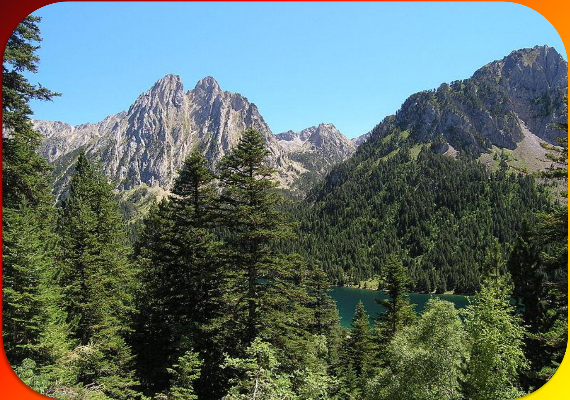
Sant Maurici National Park in the Pyrenees.