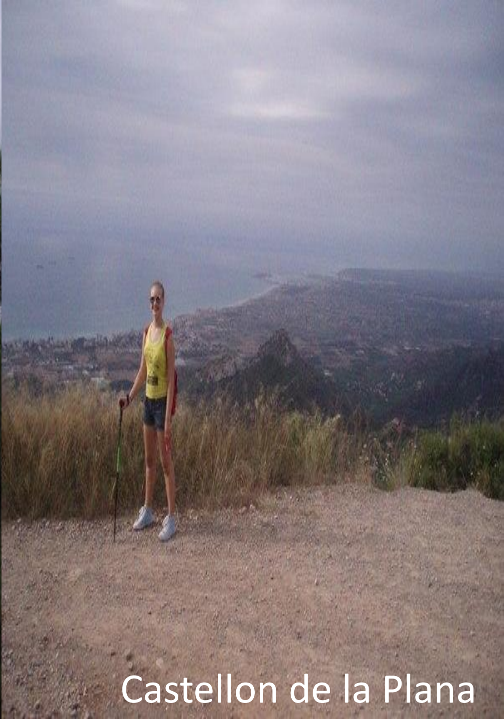
Castellon de la Plana