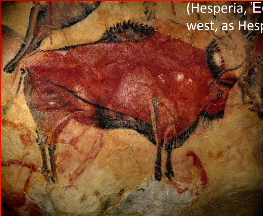
Altamira Cave paintings, in Cantabria

(Hesperia, Ἑσπερία in Greek) and Spain, being still further west, as Hesperia ultima