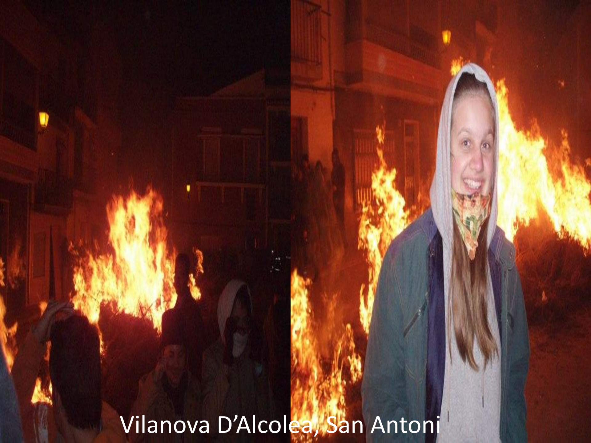
Vilanova D'Alcolea, San Antoni