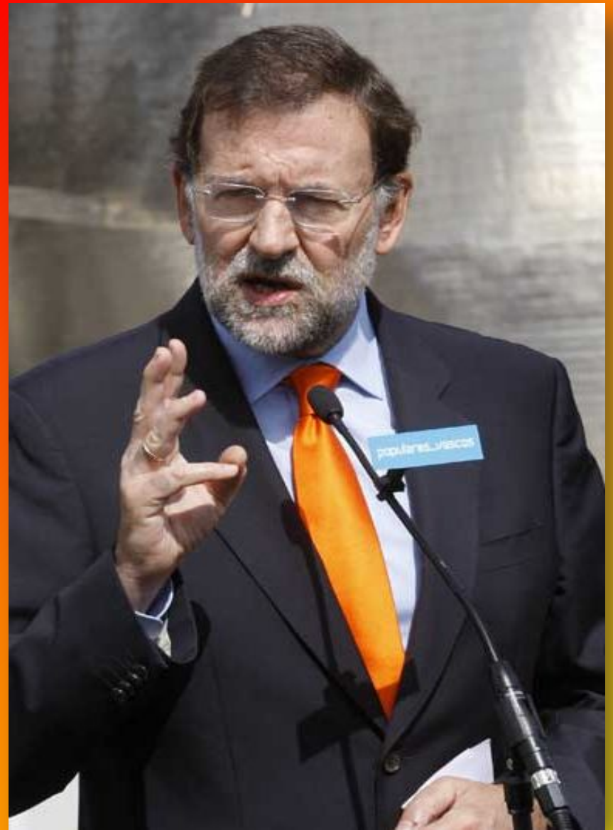
Mariano Rajoy, Prime minister