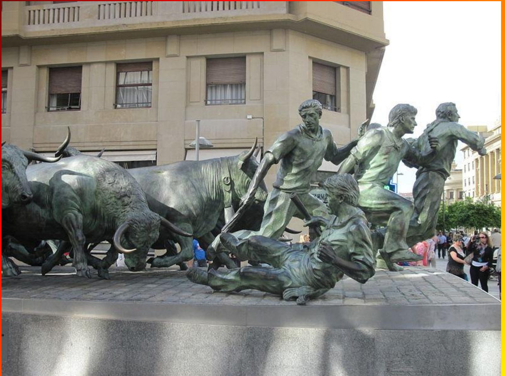
Monument in Pamplona