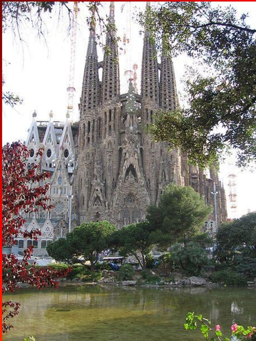
Sagrada Família of Antoni Gaudí, Barcelona.