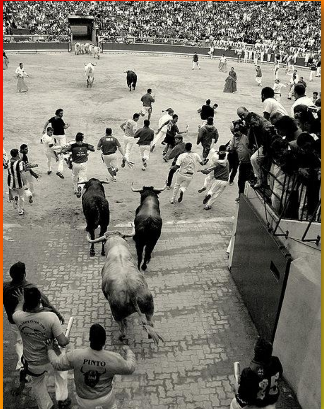
Pamplona, 2007. Bulls following some runners enter the bull ring, where the event ends. The bulls can be seen in the foreground and background of the picture.