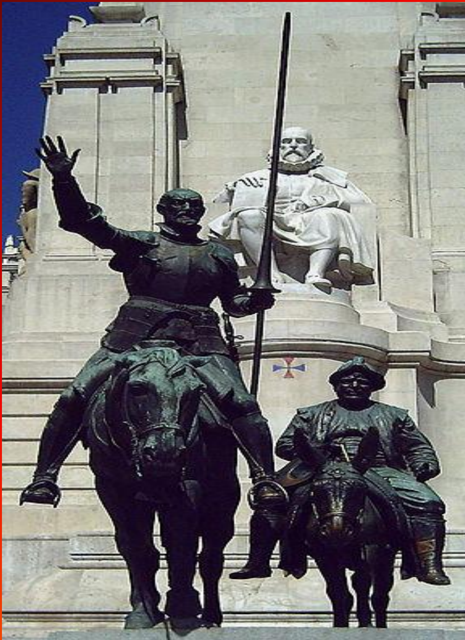
Bronze statues of Don Quixote and Sancho Panza, at the Plaza de España in Madrid