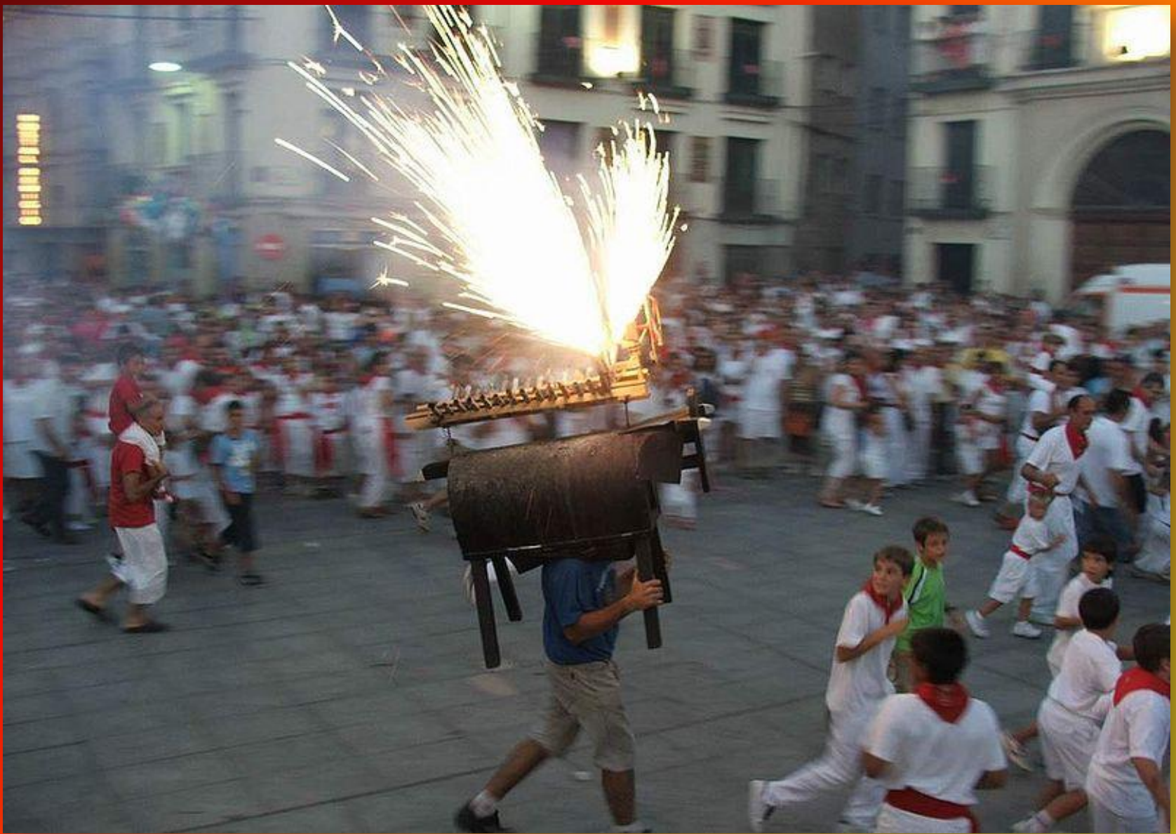
Fire bull and children running from it.