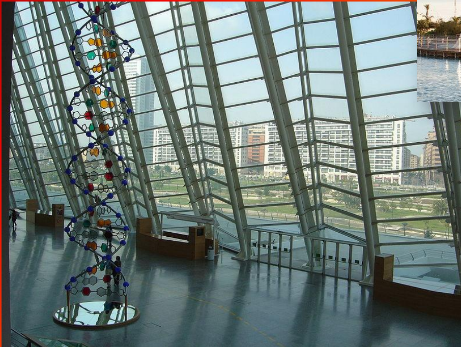
El Museu de les Ciències Príncipe Felipe