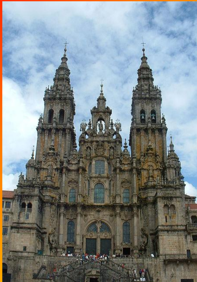
Santiago de Compostela Cathedral, A Coruña; terminus of the Way of St. James