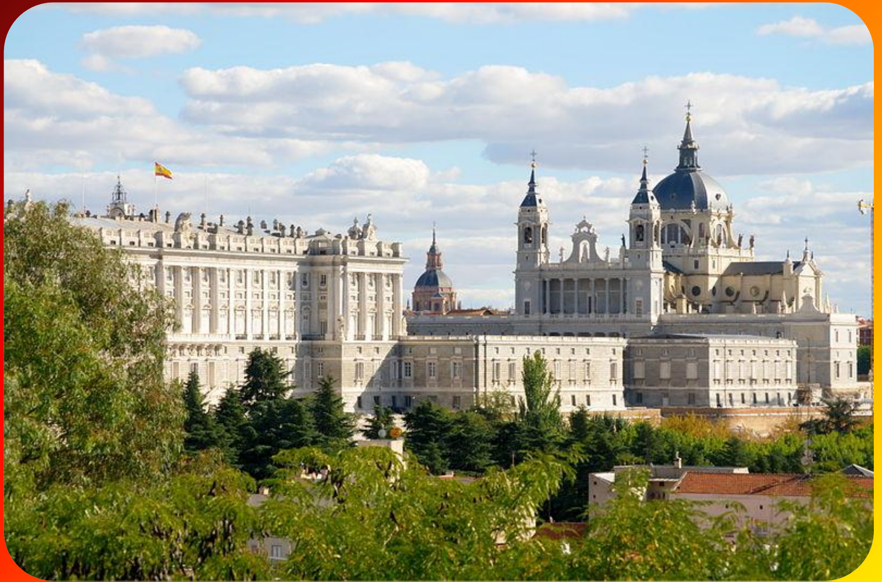
Royal Palace and Santa María la Real de La Almunera