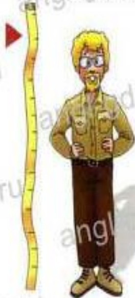
1 Uncle Harry