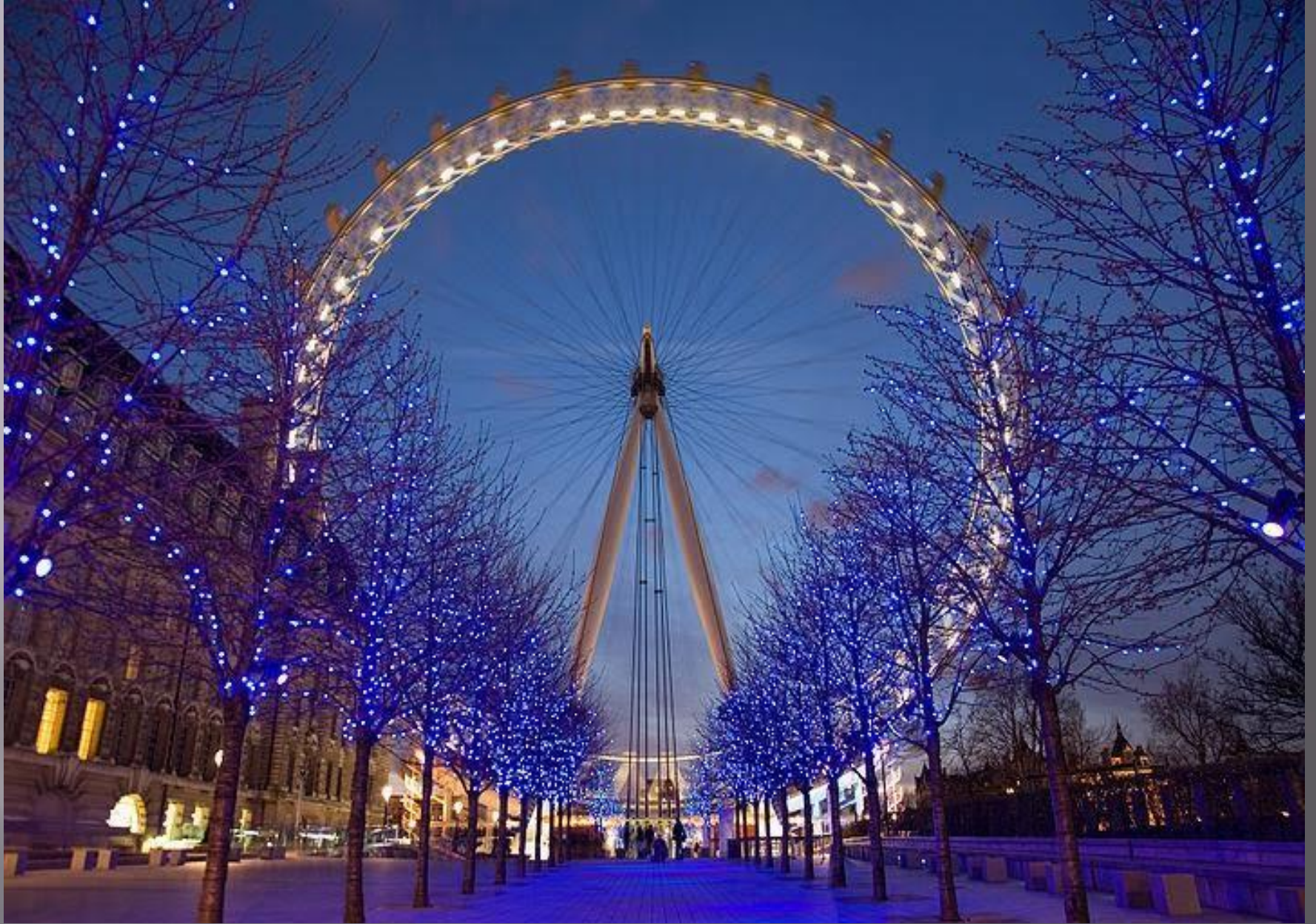
The London Eye