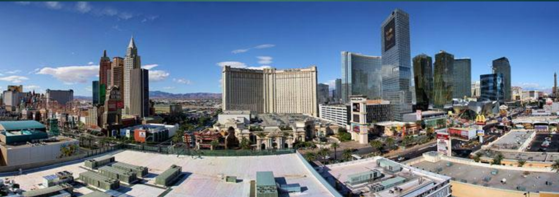
The panorama of the city

Las Vegas (Nev.) - A city in the south-western part of the United States and the largest city in the state of Nevada (Nevada). Las Vegas is an internationally recognized center for entertainment and recreation, it is an unofficial capital of the world of gambling