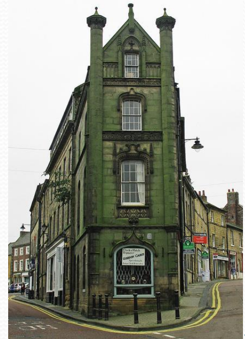
The Tall Green Shop