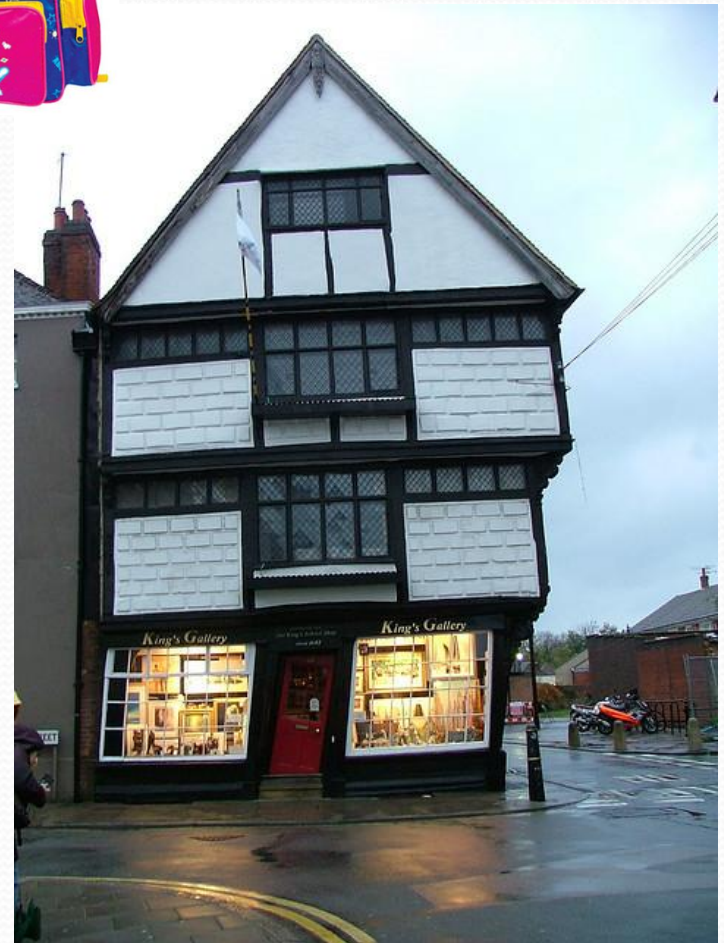
The Old King's School Shop 6