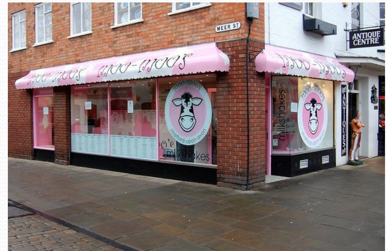
Moo-Moo's Milk Shake Shop 4