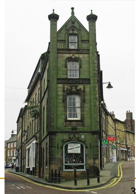
The Tall Green Shop