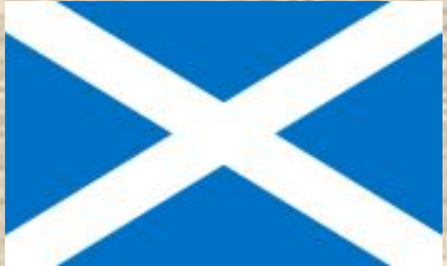
The Flag of Scotland The Flag of Scotland, the Saltire or St. Andrew's Cross and is the oldest national flag still in use.