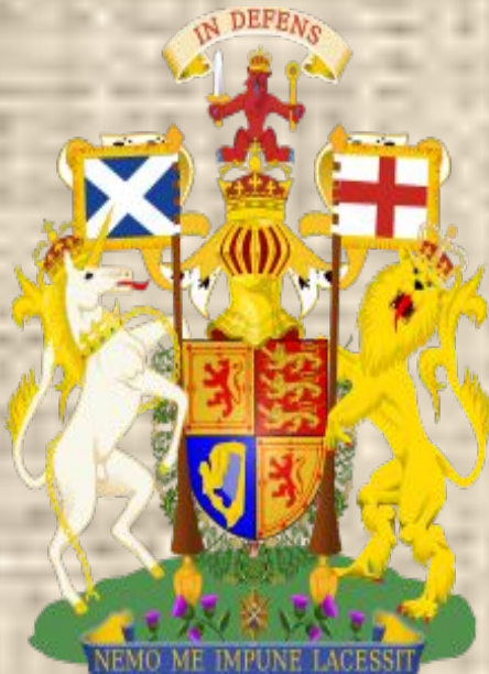
The Royal Coat of Arms of Scotland