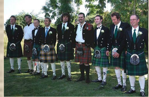
THE EDINBURGH MILITARY TATTOO