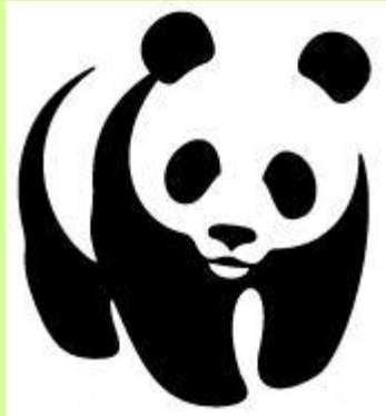
World Wildlife Fund