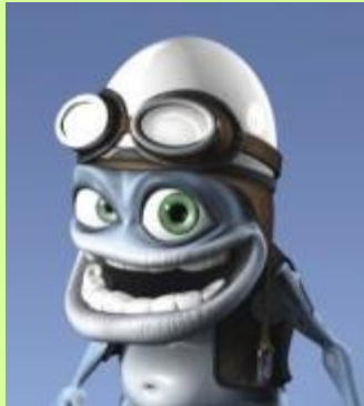
Crazy Frog Ringtone