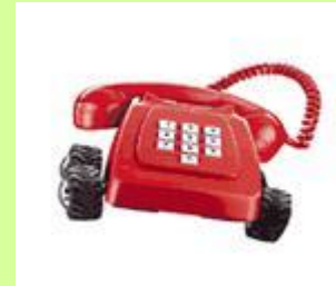
Direct Line Insurance