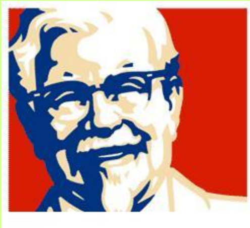
Kentucky Fried Chicken