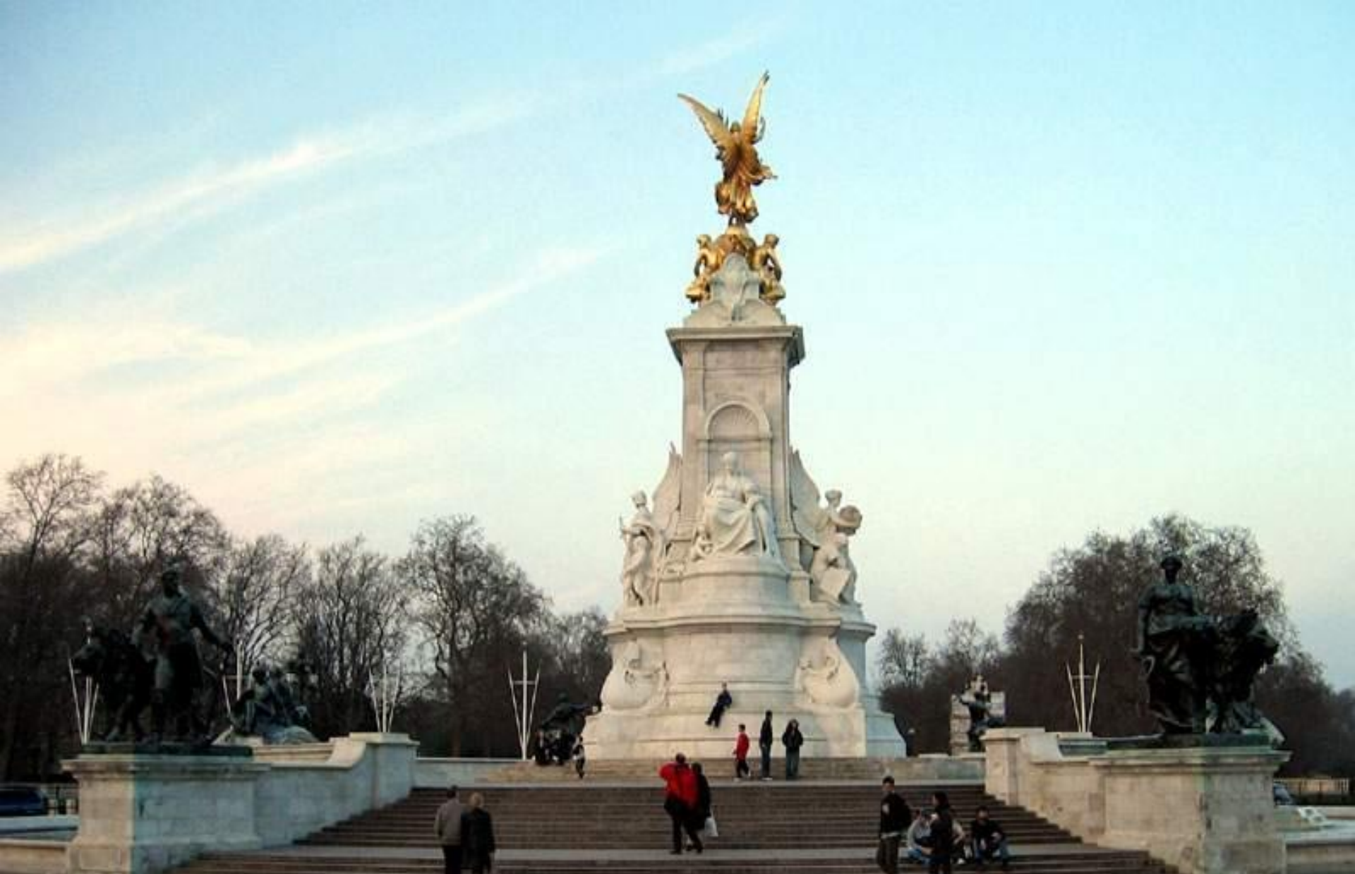
Queen Victoria Memorial