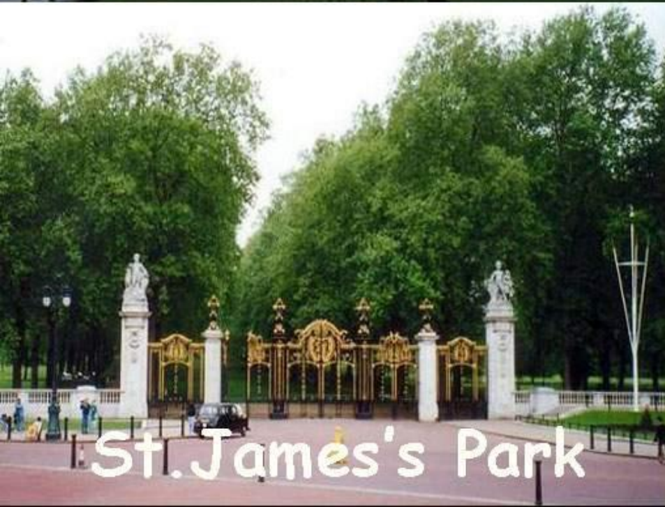
St. James's Park