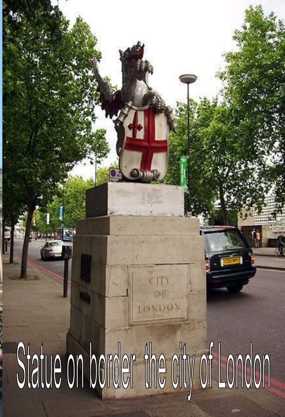
Statue on border the city of London