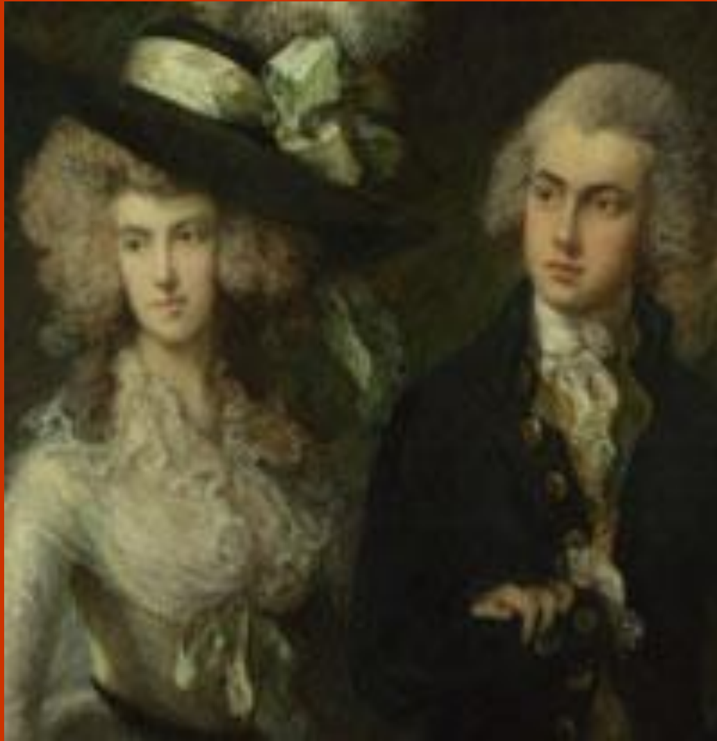
Painting of the Month

The Tate Gallery is two national collections in one: