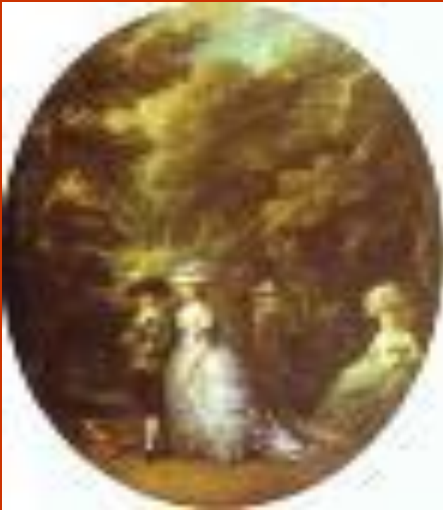
Thomas Gainsborough Portrait of Henry Duke of Cumberland

The Modern collection includes highlights by Monet, Pissaro and Van Gogh, Matisse, Picasso.