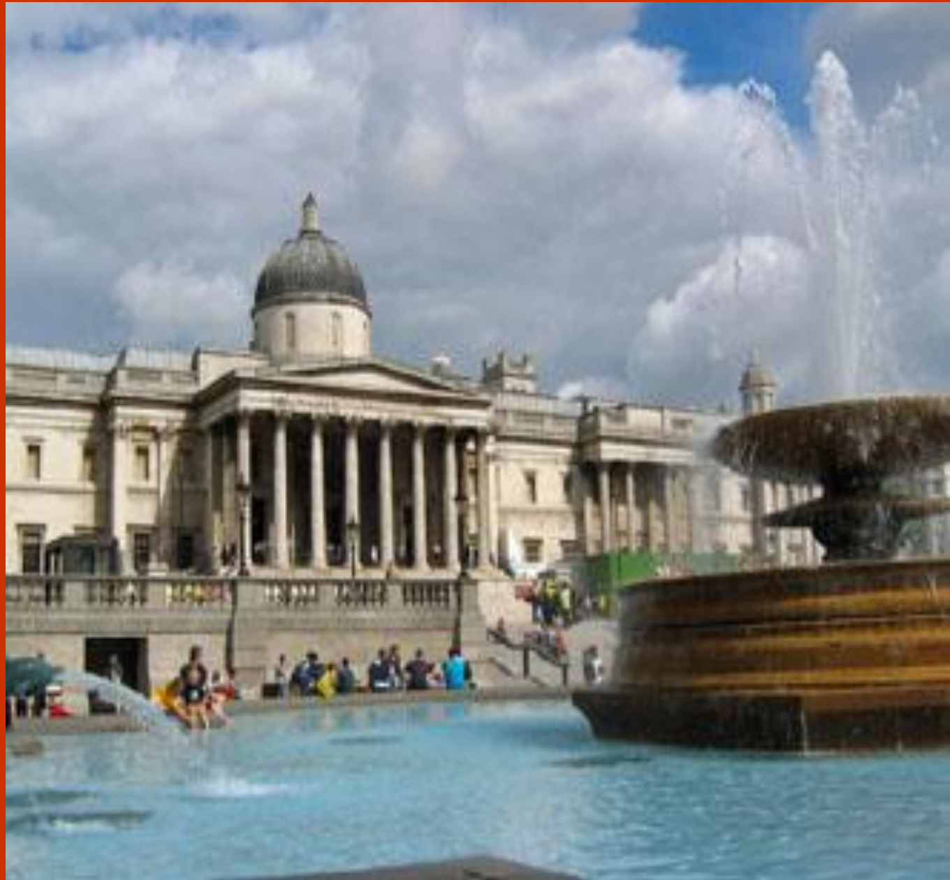
The National Gallery

The National Gallery houses the national collection of Western European painting, comprising more than 2000 pictures dating from the late 13th to the early 20th century. The Gallery was founded in 1824