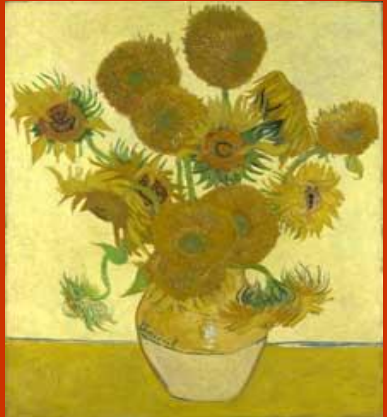
Van Gogh Sunflowers