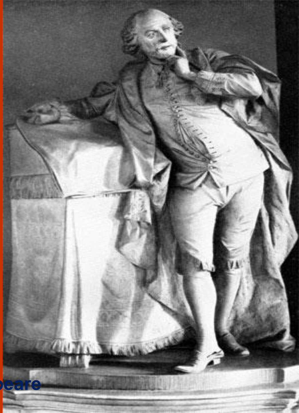
The sculpture of W. Shakespeare

To this diverse collection of manuscripts, sculpture works of art, antiquities and natural history items the extensive library was added.