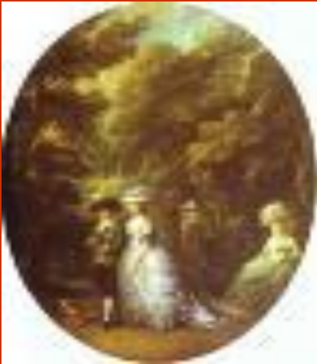
Thomas Gainsborough Portrait of Henry Duke of Cumberland

The Modern collection includes highlights by Monet, Pissaro and Van Gogh, Matisse, Picasso.