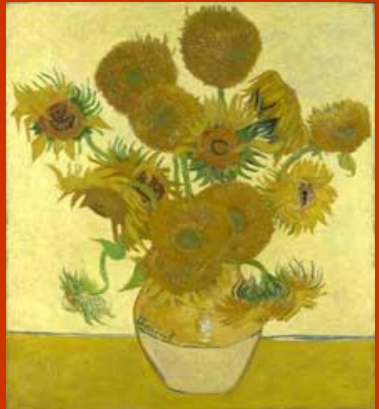
Van Gogh Sunflowers