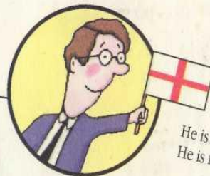
He is English. He is from England.