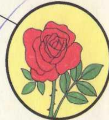
The symbol of England is a rose.