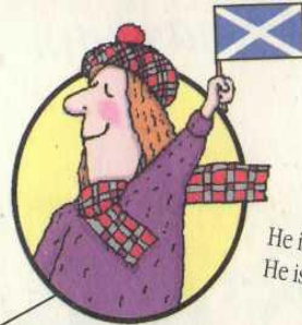
He is Scottish. He is from Scotland.