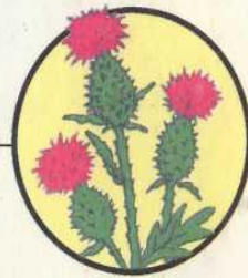
The symbol of Scotland is a thistle.