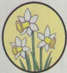
The symbol of Wales is a daffodil.