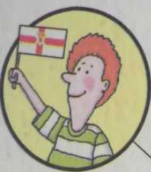
He is Irish. He is from Northern Ireland.