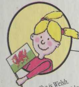
She is Welsh. She is from Wales.