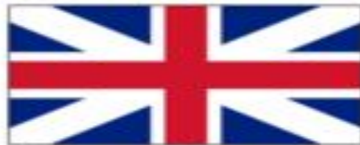
Original Union Flag (1606)