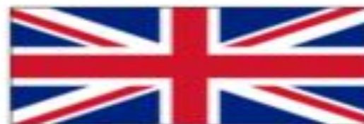
Current Union Flag (1801)