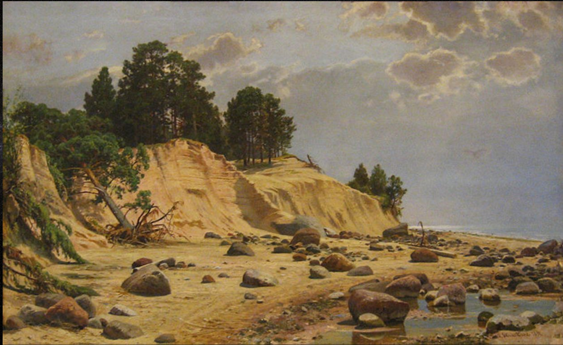
Landscape "After the storm in Mary-Hovi" Shishkin