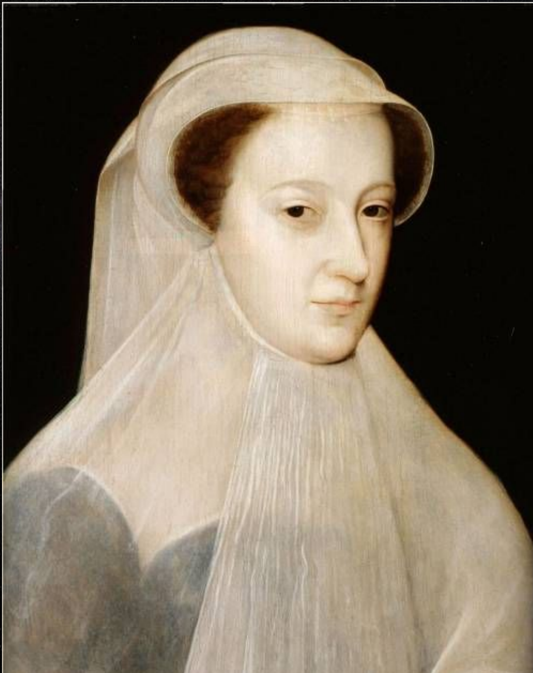
Portrait of Mary Stuart