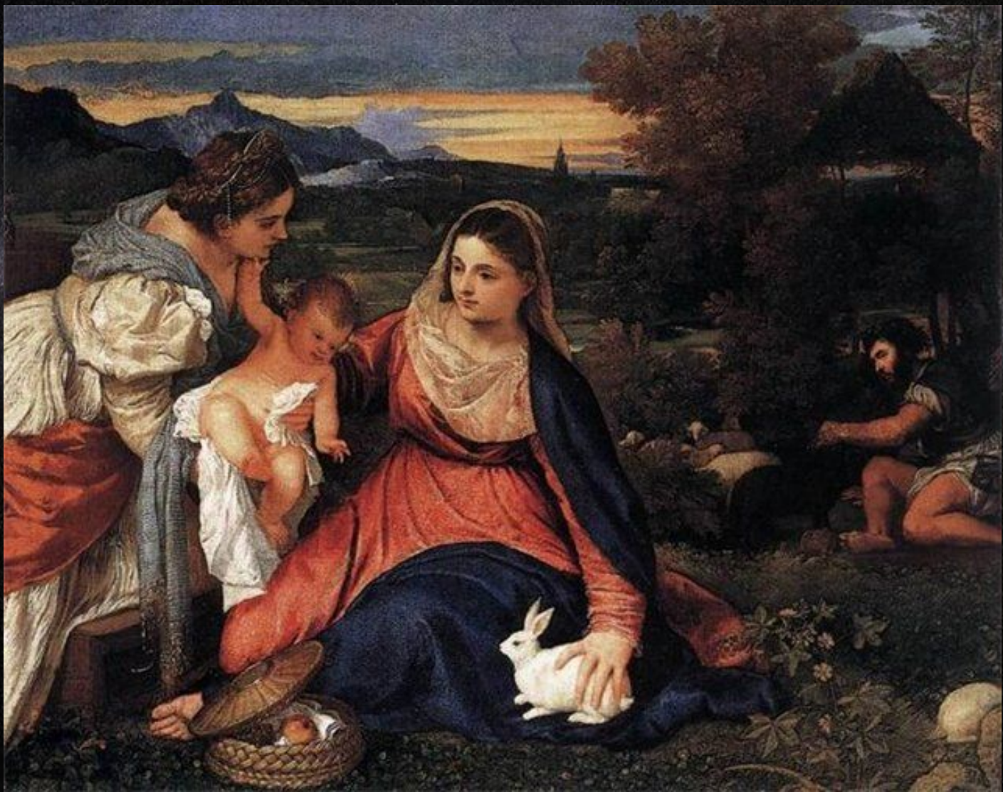
"Madonna with Child and Catherine of Alexandria"