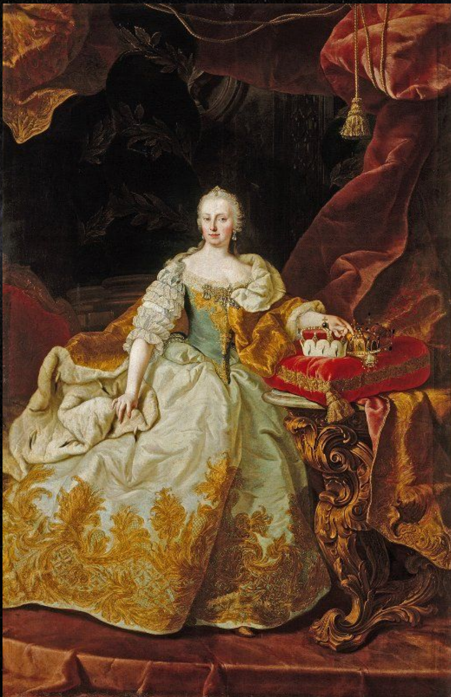
Portrait of Empress Maria Theresa.