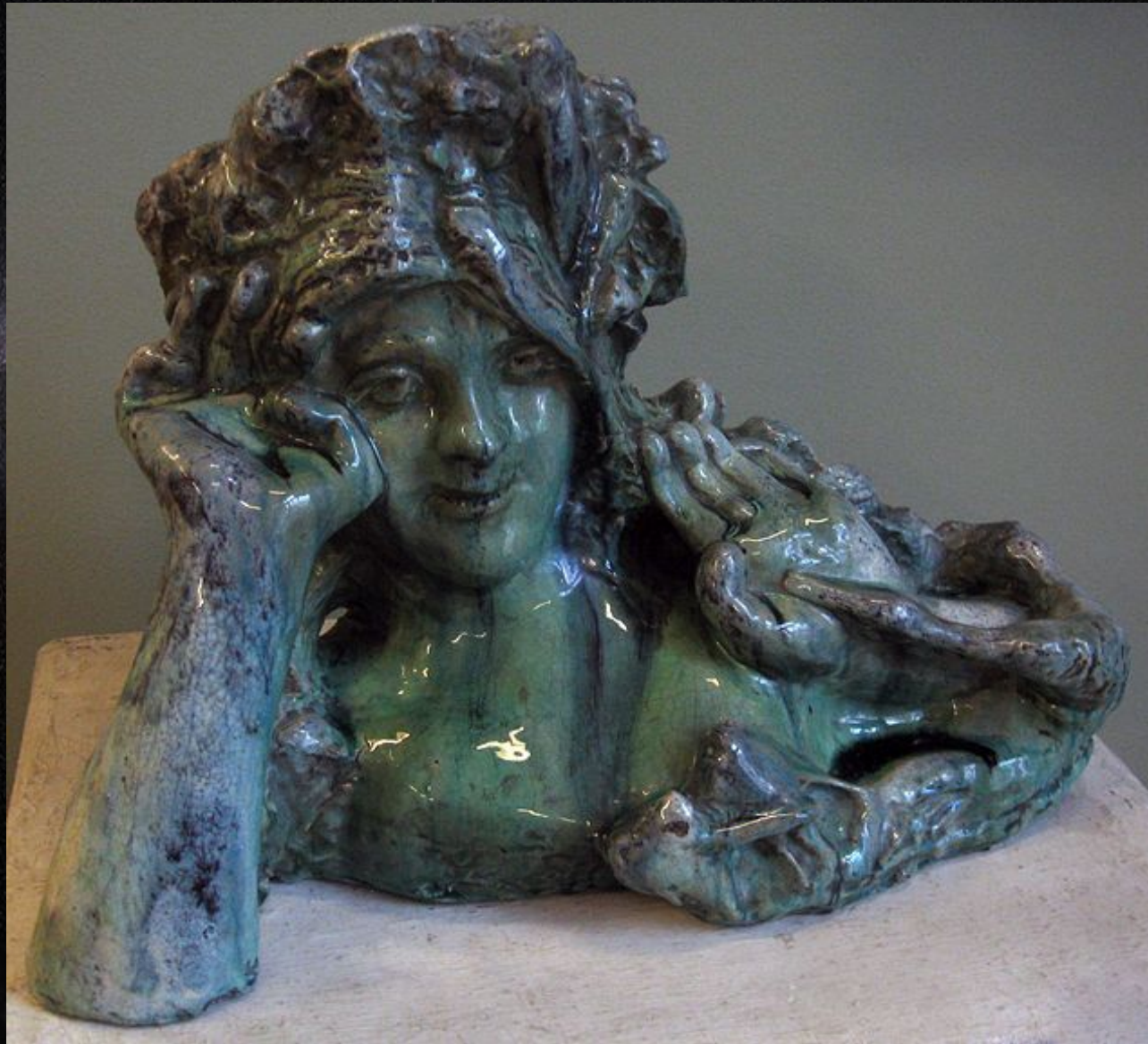
"Sea Queen Volkhov" - Mikhail Vrubel