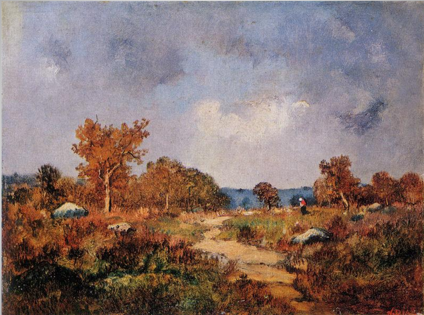
Narcisse Virgile Diaz de la Pena Autumn Landscape