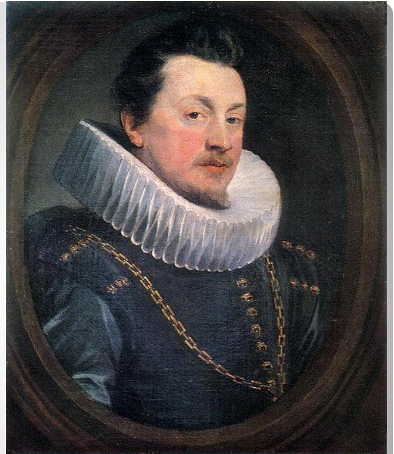
Sofonisba Anguissola. Portrait of a young patrician Peter Paul Rubens. Man Portrait