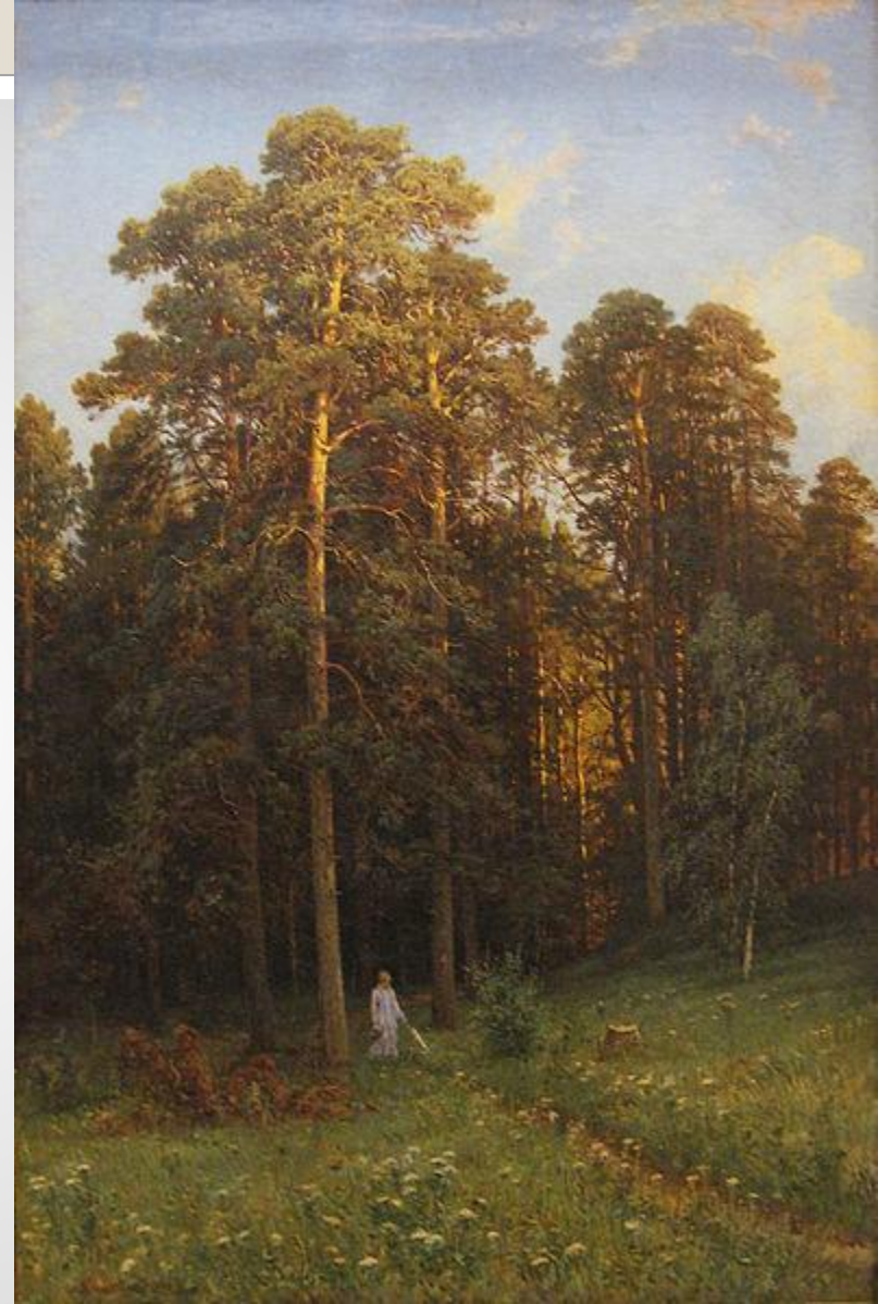
Ivan Shishkin At the edge of a pine forest

In 1940, after the city of Lviv/Lwów had been occupied by the Soviet Union, Soviet government ordered nationalization of private property. As a result, works from the Lubomirski family museum, the Baworowscy Library, and some other private collections came into the possession of the gallery. All these works had until the 1939 Invasion of Poland belonged either to the Polish state, or to Polish private collectors, as well as Roman - Catholic church.