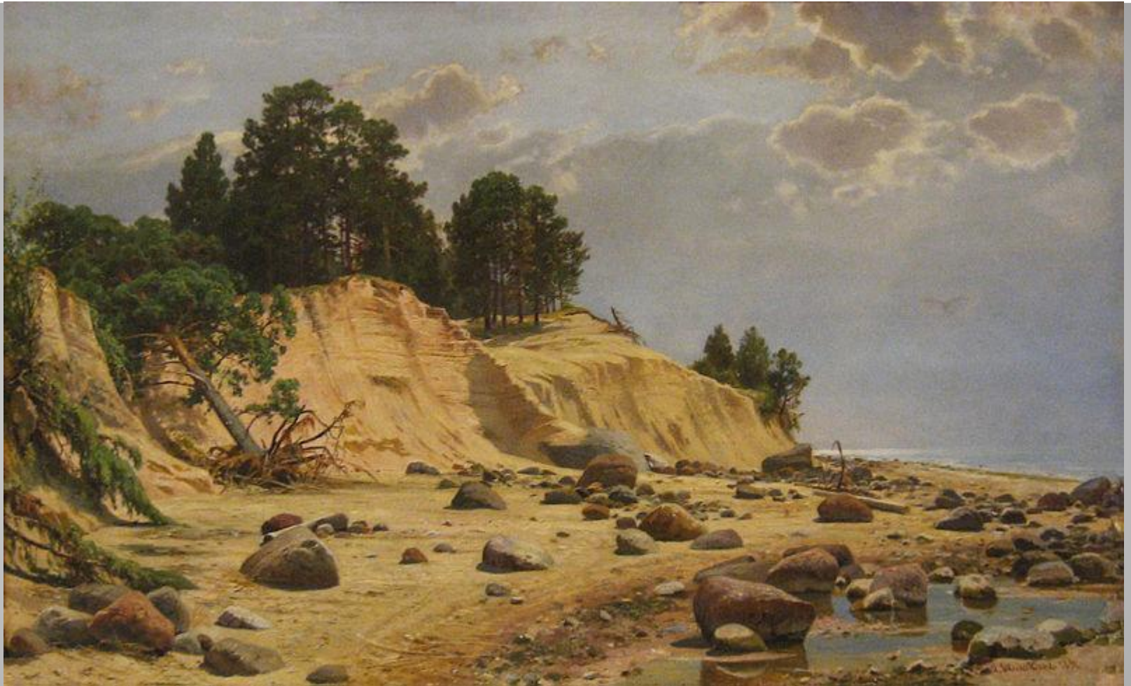
Ivan Shishkin After the storm in Mary-Howie 1891