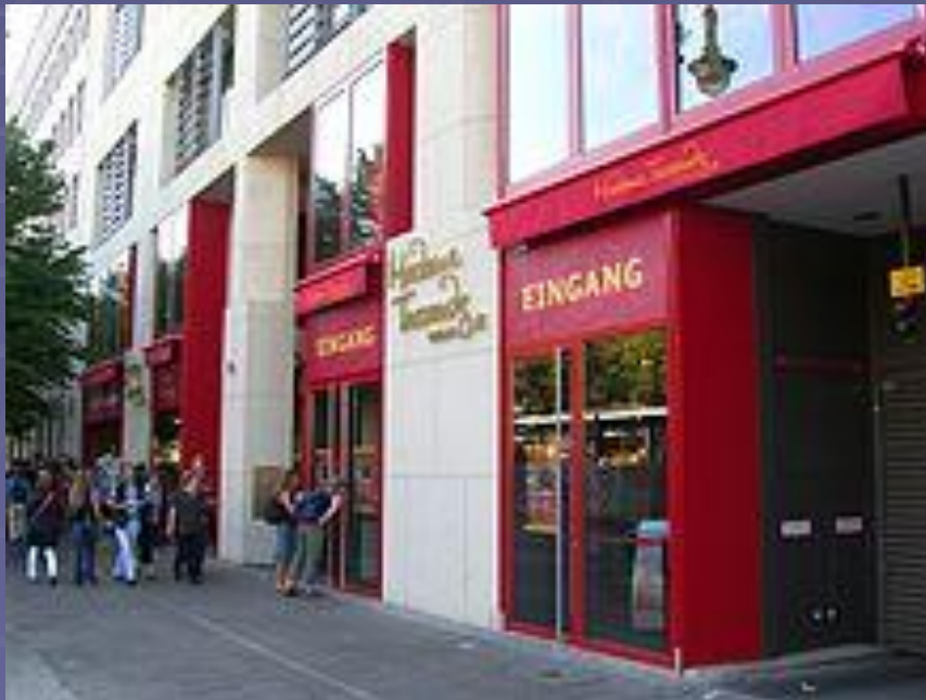
Entry of Madame Tussauds in Berlin