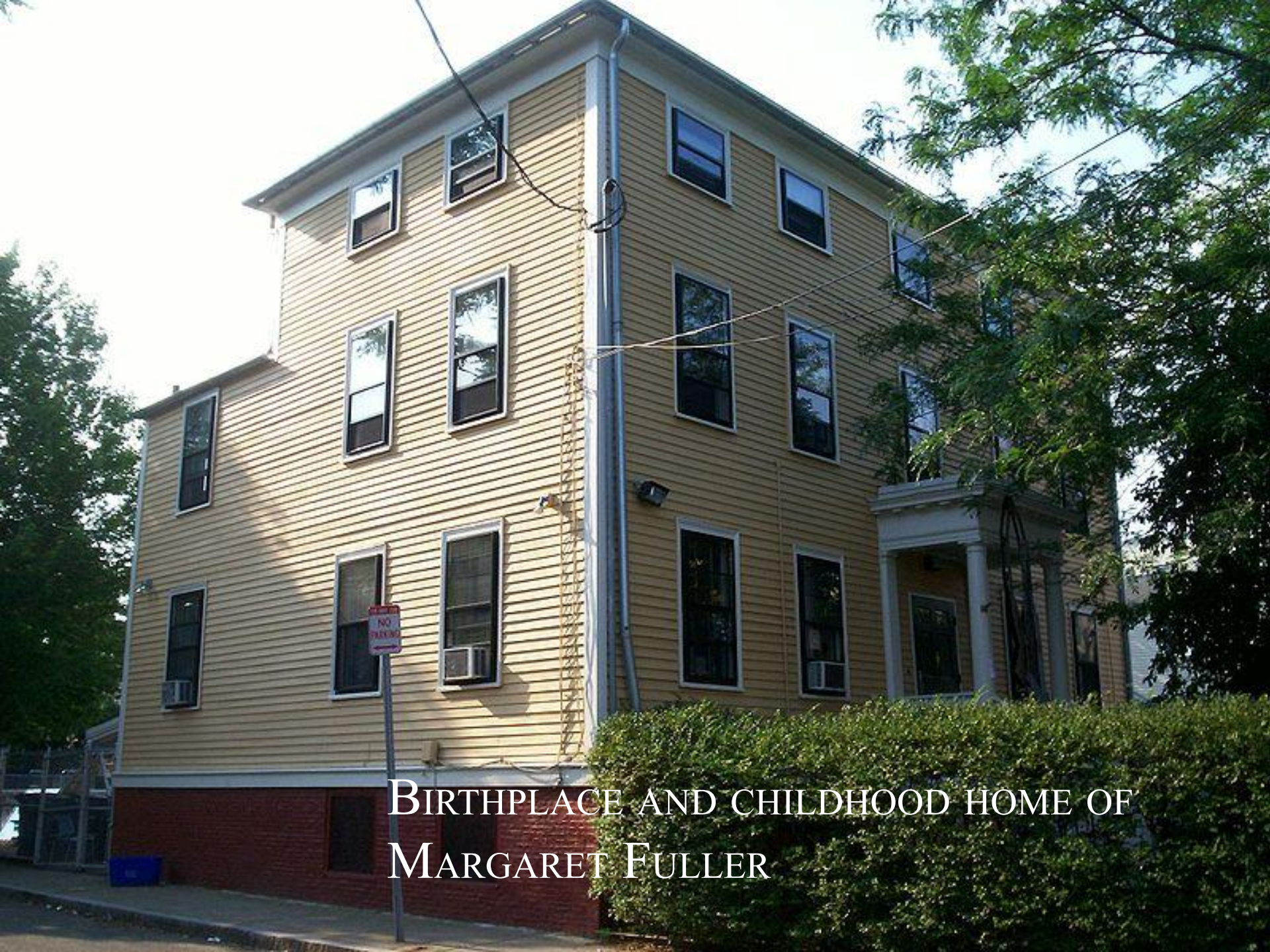
BIRTHPLACE AND CHILDHOOD HOME OF MARGARET FULLER