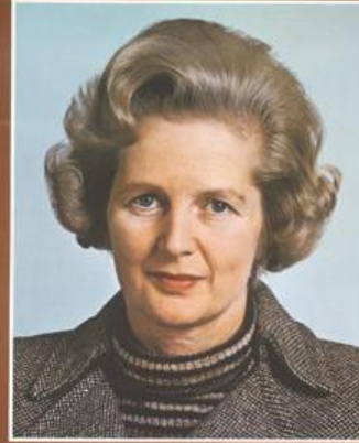
The Rt. Hon. Margaret Thatcher MP Leader of the Conservative Party