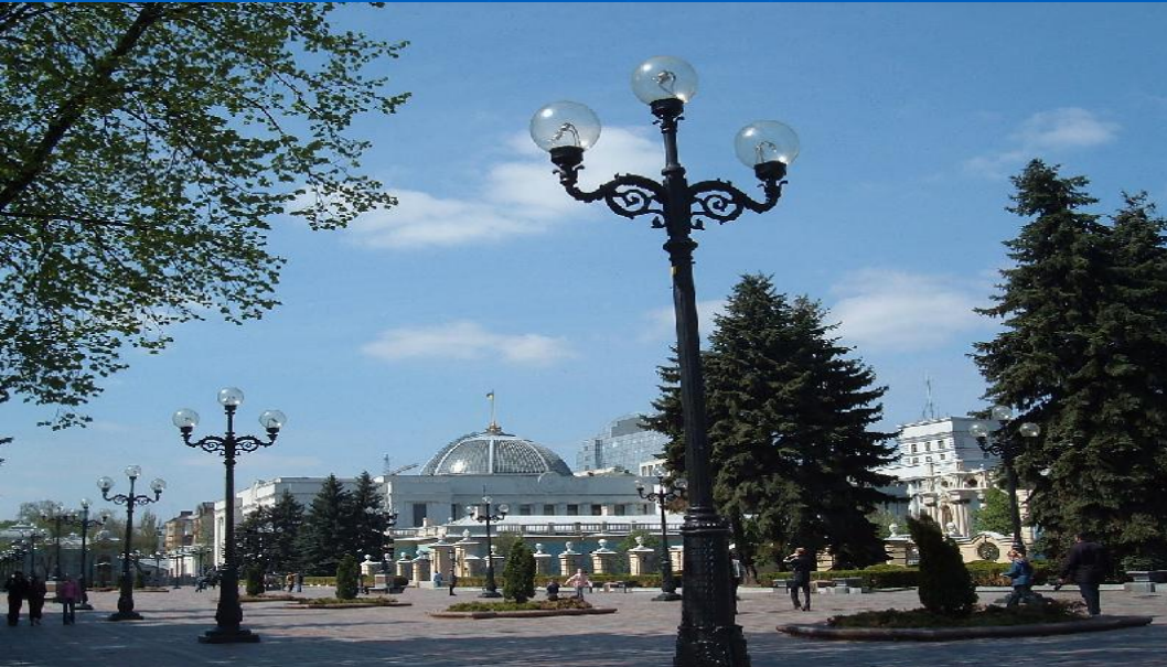
The Verchovna Rada

Maryinsky Park is one of the oldest parks in Kiev. It now hosts two important buildings