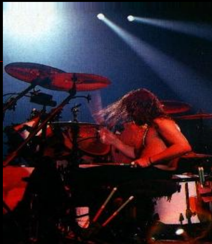
Lars Ulrich, drums (all time)