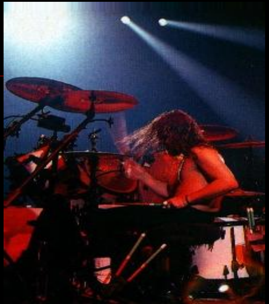
Lars Ulrich, drums (all time)