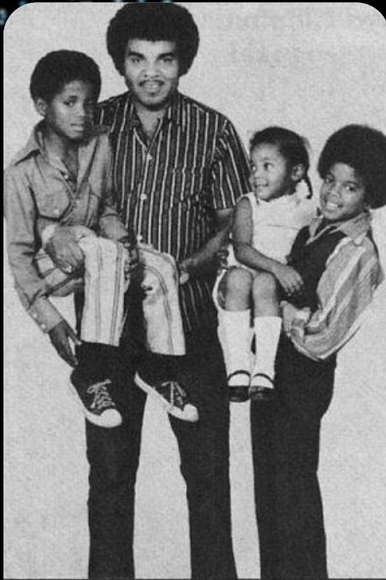
Joe Jackson, the J-5's father!