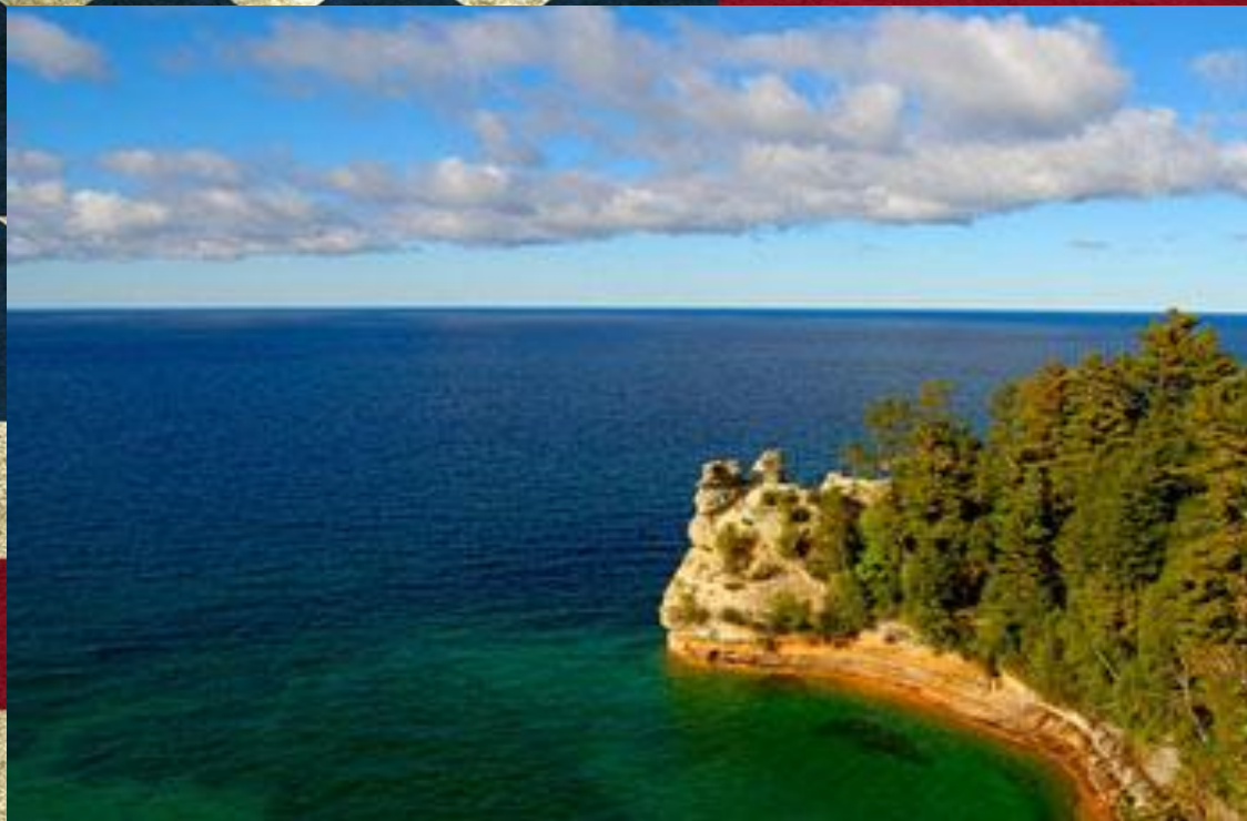
Coast of Lake Superior in northern Michigan

In their language the word "mishigama" means "big water" or "large lake". Hence the name of Michigan State - "State of the Great Lakes."