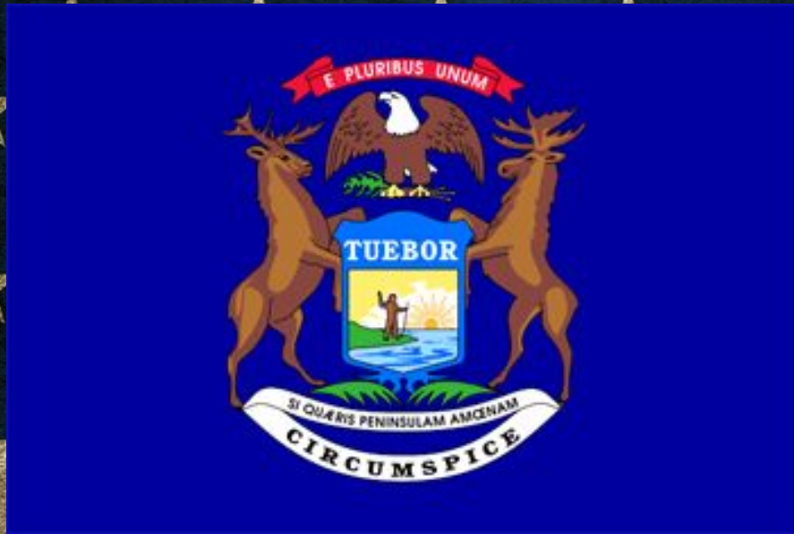
Flag of Michigan

The nickname of Michigan: "State of the Great Lakes," "Wolverine State"