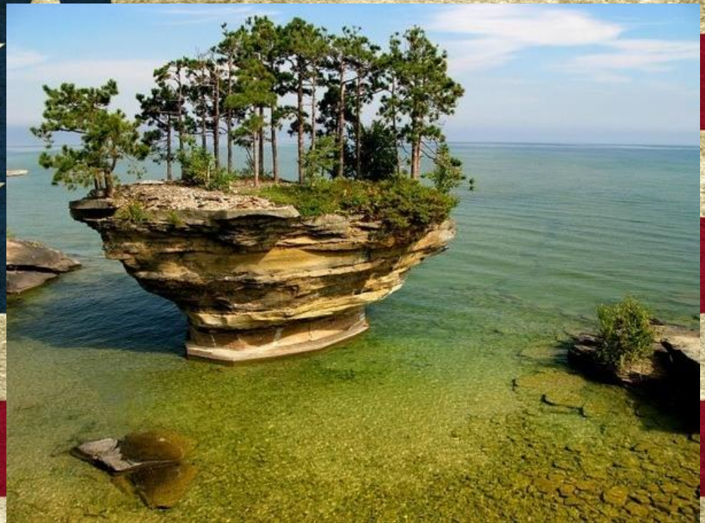
Lake Huron and unusual island on it

In the north and east of Michigan is bordered by the waters of Lakes Superior and Huron