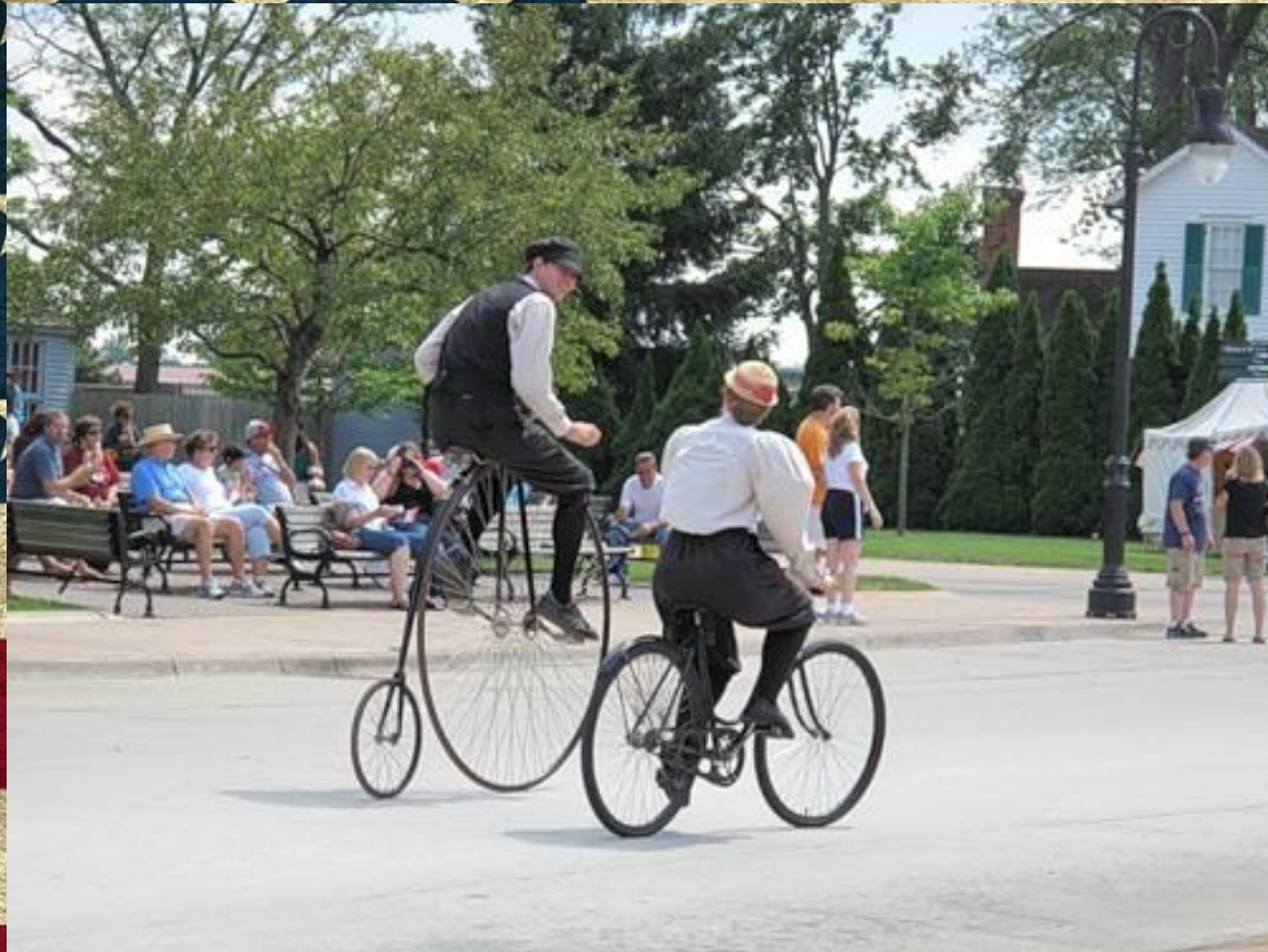
cyclists on the streets of Greenfield Village

Greenfield Village, five-kilometer waterfront park (38-hectare park with many historic buildings, vehicles, and several museums), as well as dozens of other cultural and sports facilities.