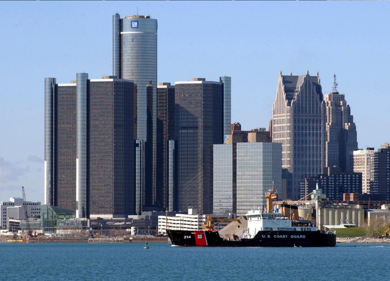
Cultural Center General Motors

A few miles north of downtown Cultural Center is located, the world-famous galleries and museums - a collection of the Detroit Institute of Arts